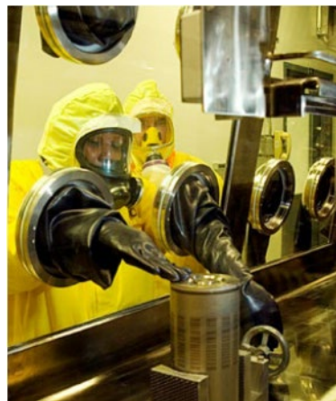
Figure 2. Glovebox

A glovebox (Figure 2) is an enclosure that separates workers from equipment used to process hazardous material, while allowing the workers to be in physical contact with the equipment. Gloveboxes are normally constructed of stainless steel, with large acrylic/lead glass windows. Workers have access to equipment through the use of heavy-duty, lead-impregnated rubber gloves, the cuffs of which are sealed in portholes in the glovebox windows.