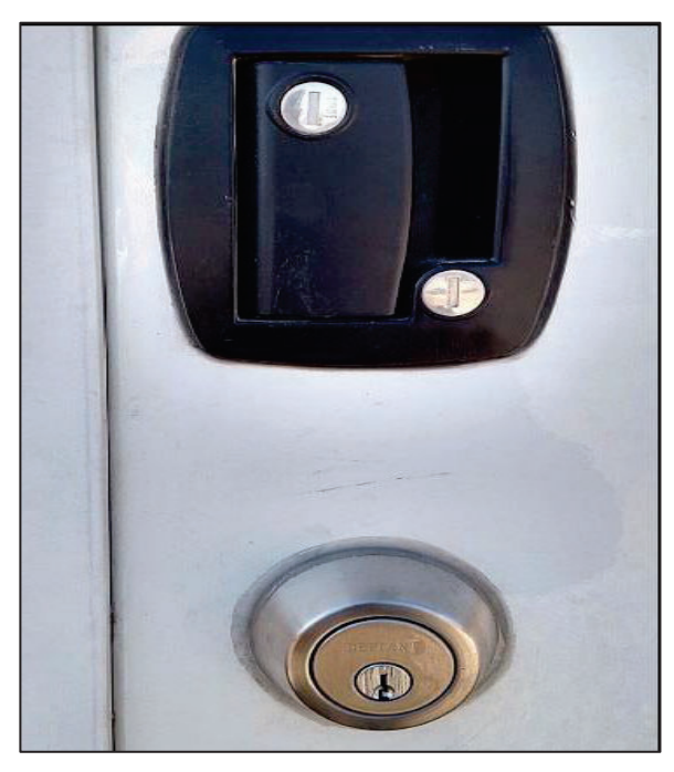
Figure 3. Curbside Pedestrian Door Deadbolt Lock