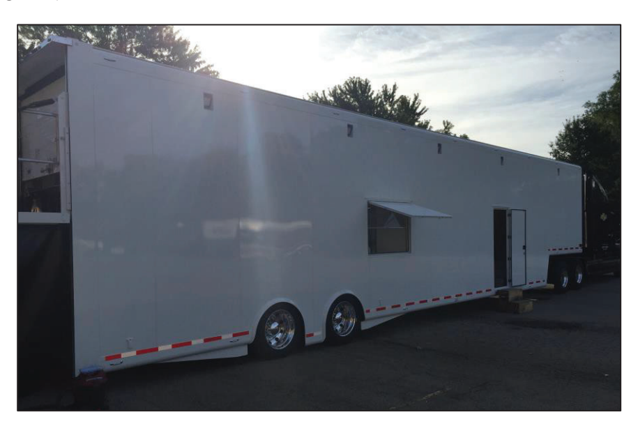
Figure 1. Transport Trailer

A dedicated ESS logistics trailer reduces the wear and tear on high-value government equipment by providing shelter from ambient weather and mitigating the need to frequently load/unload equipment (i.e., some equipment items remain on the trailer between deployments). More, a dedicated ESS logistics trailer also provides enhanced security and accountability for ESS firearms and sensitive items, as well as a more efficient issue point for ESS firearms and equipment during EA assessments and Composite Adversary Team training (see Figure 1).