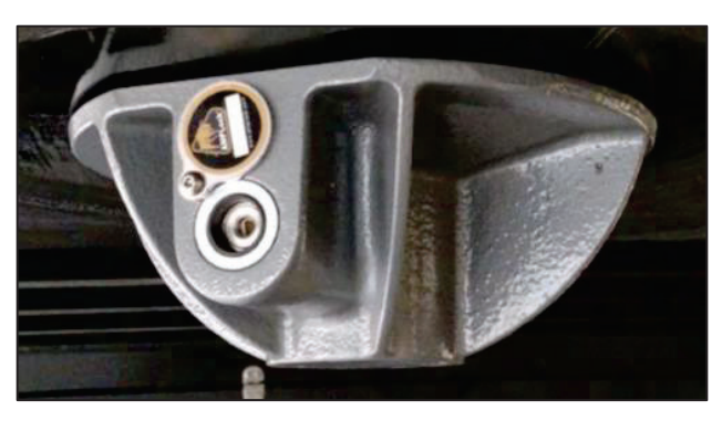
Figure 2. Kingpin Lock Shroud