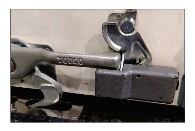
Figure 4. Rear Rollup Door and Lock Shroud

The rear rollup cargo door is the primary security barrier at the rear of the trailer. When the trailer is unattended, the rear door is secured with a high security lock shroud (see Figure 4). Additionally, the side vending window is secured by closing the window and ensuring that the spring-loaded latches are fully seated in the locked position.