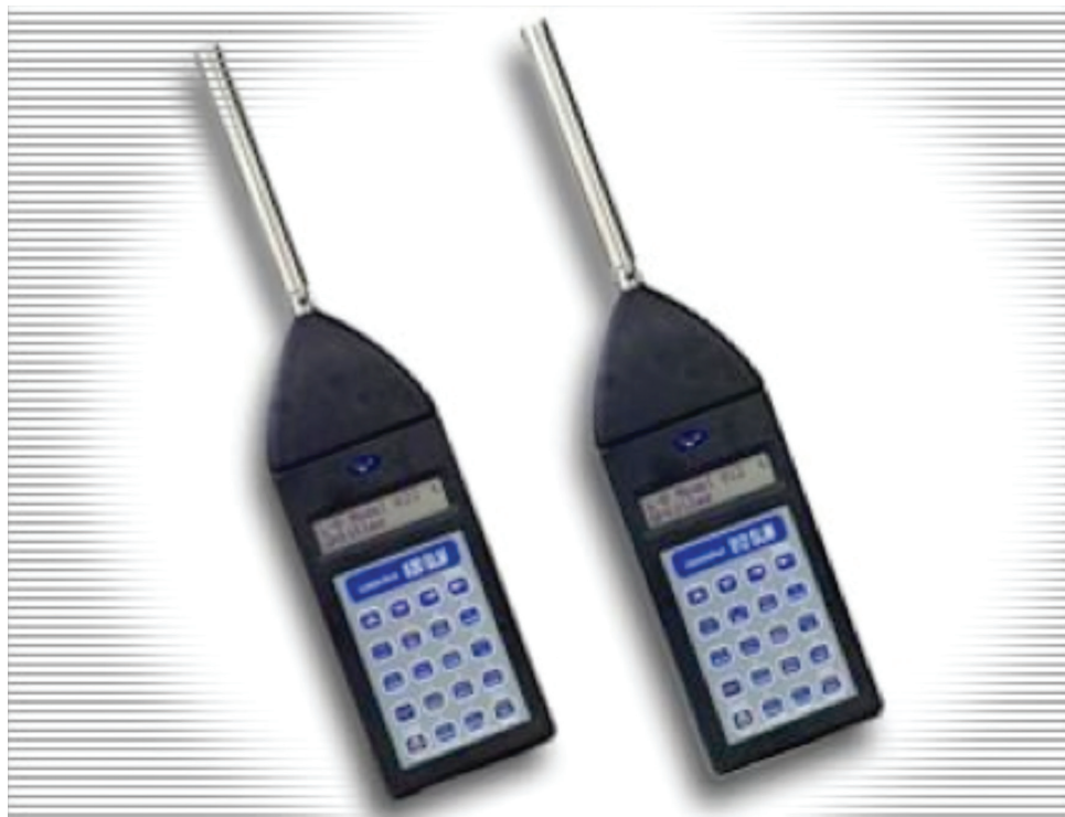
Noise monitoring activities will use noise monitors like these to measure sound levels associated with passing vehicles.