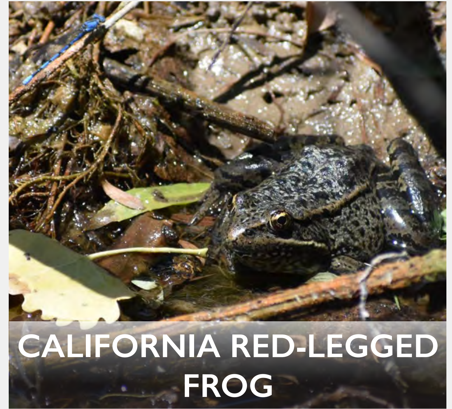
CALIFORNIA RED-LEGGED FROG