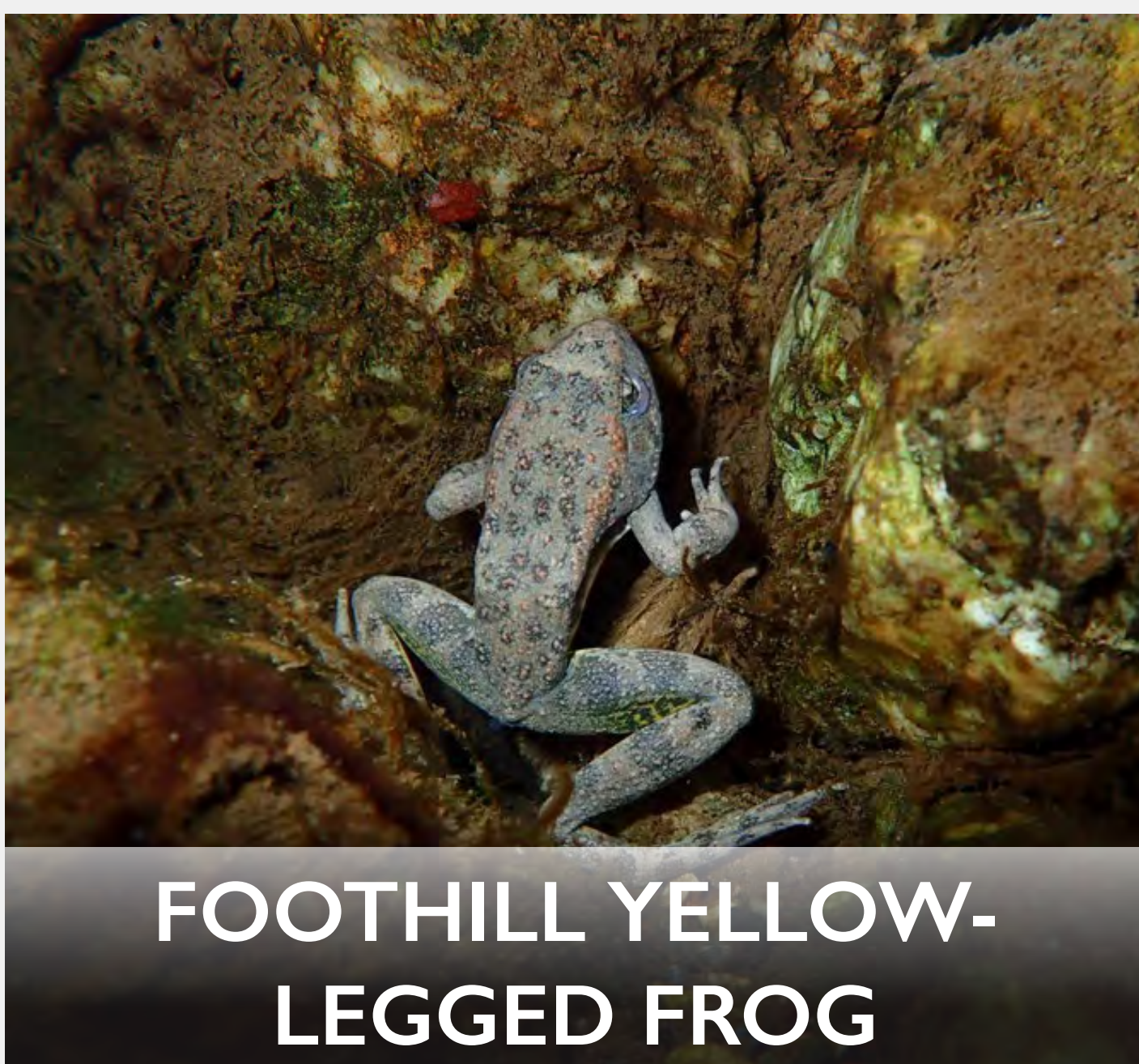
FOOTHILL YELLOW- LEGGED FROG