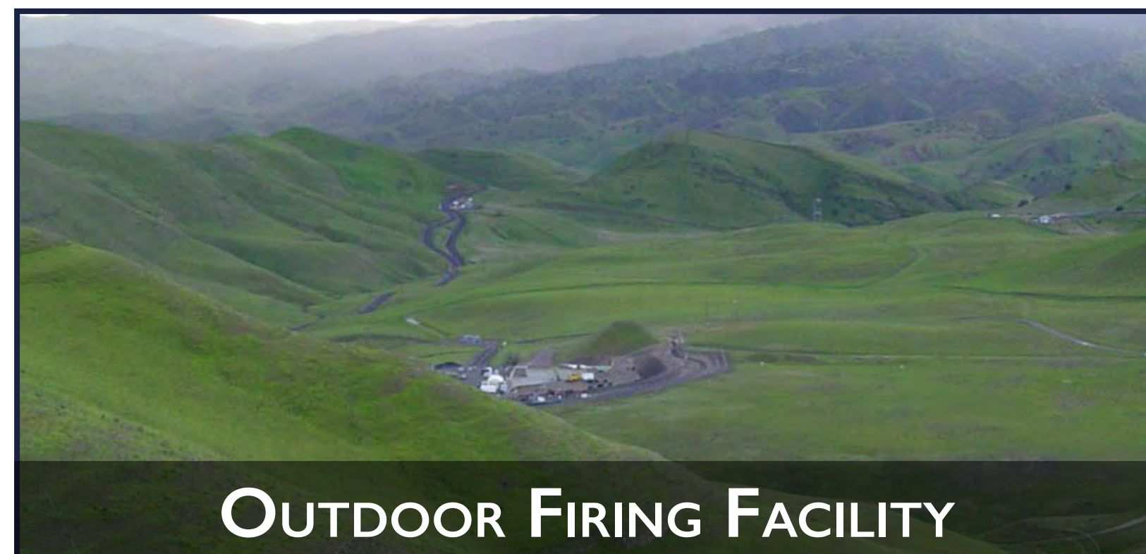
OUTDOOR FIRING FACILITY