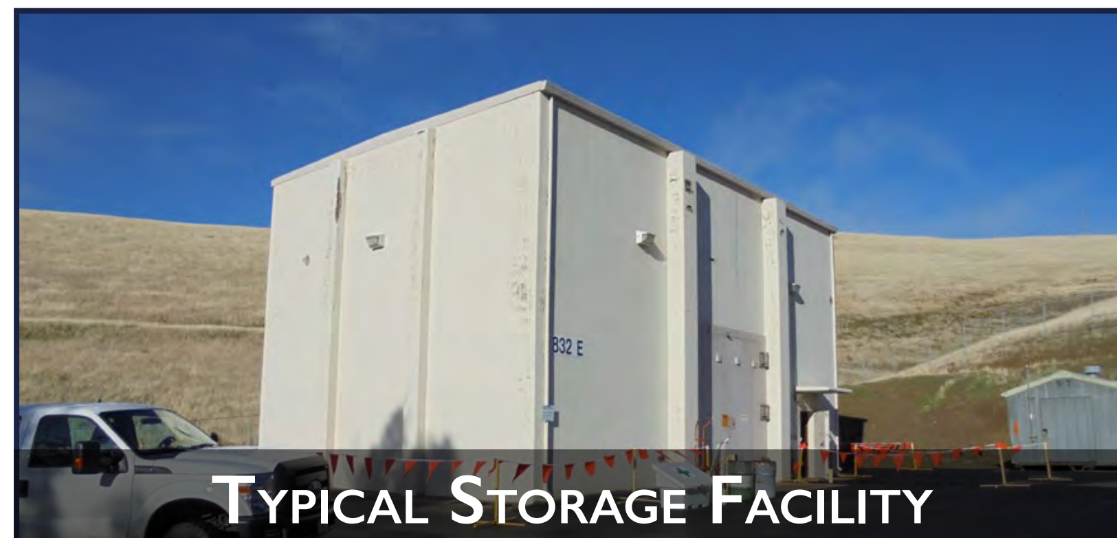
TYPICAL STORAGE FACILITY