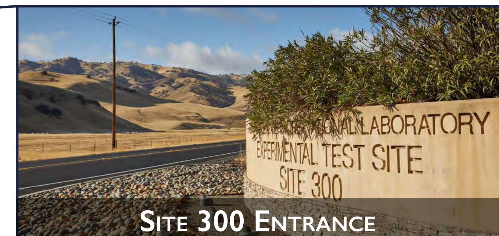
SITE 300 ENTRANCE