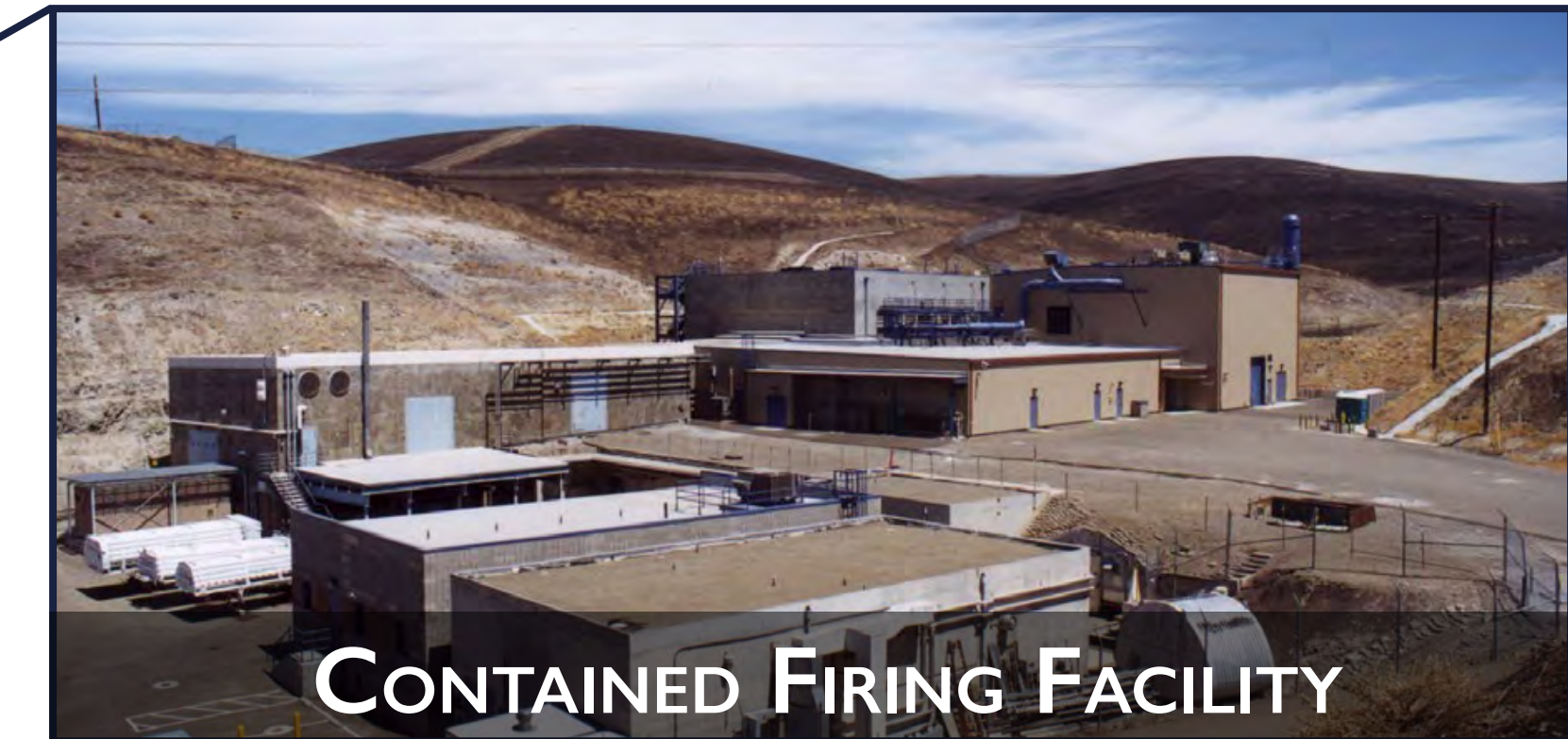
CONTAINED FIRING FACILITY