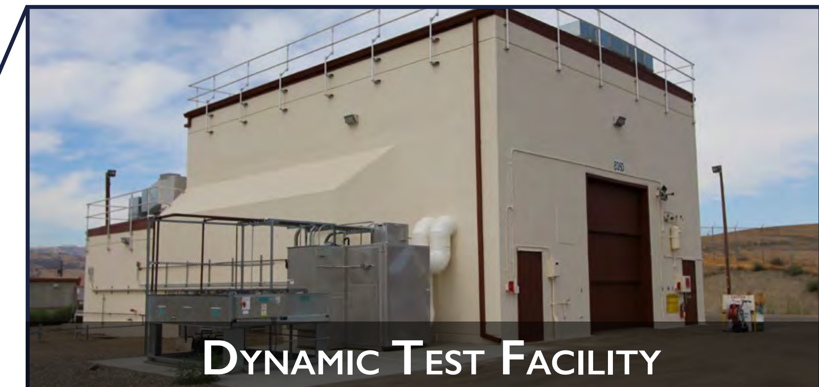
DYNAMIC TEST FACILITY