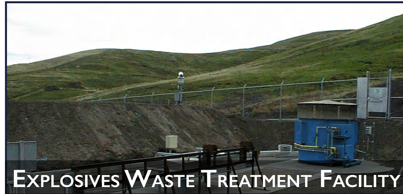
EXPLOSIVES WASTE TREATMENT FACILITY