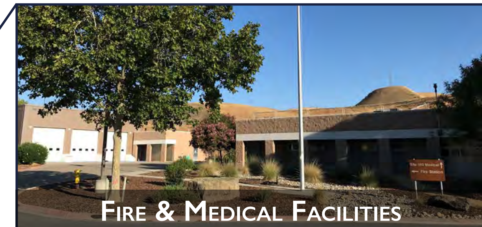
FIRE & MEDICAL FACILITIES