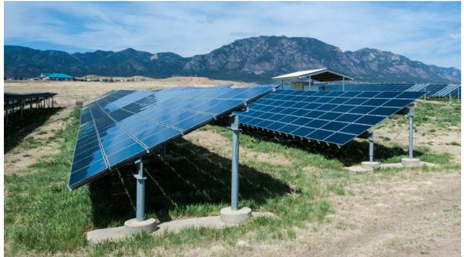
Figure 1. Fort Carson is the tenth-largest military base in the United States, home to 13,000 troops and more than 900 facilities. FEMP helped Fort Carson leverage performance contracting to integrate energy efficiency with an 8.5-MWh battery energy storage system and peak-shaving controls. As a result, Fort Carson benefits by saving approximately $500,000 per year on its electric bill.

We convene key partners, share best practices, innovate, and advance the market. With more than 300,000 energy-utilizing buildings and 600,000 vehicles, the