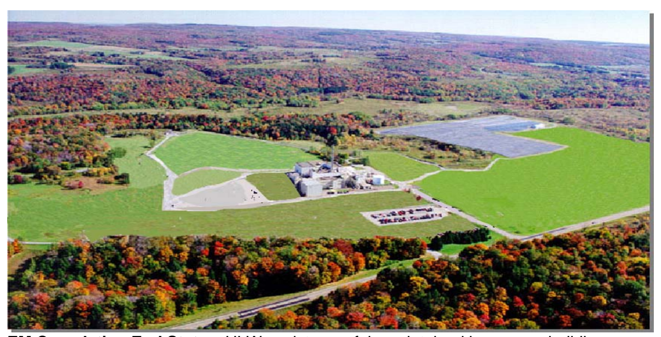
EM Completion End State – HLW canisters safely maintained in process building awaiting transport to a federal repository. HLW tank farm and WVDP facilities remediated per Decommissioning EIS ROD.