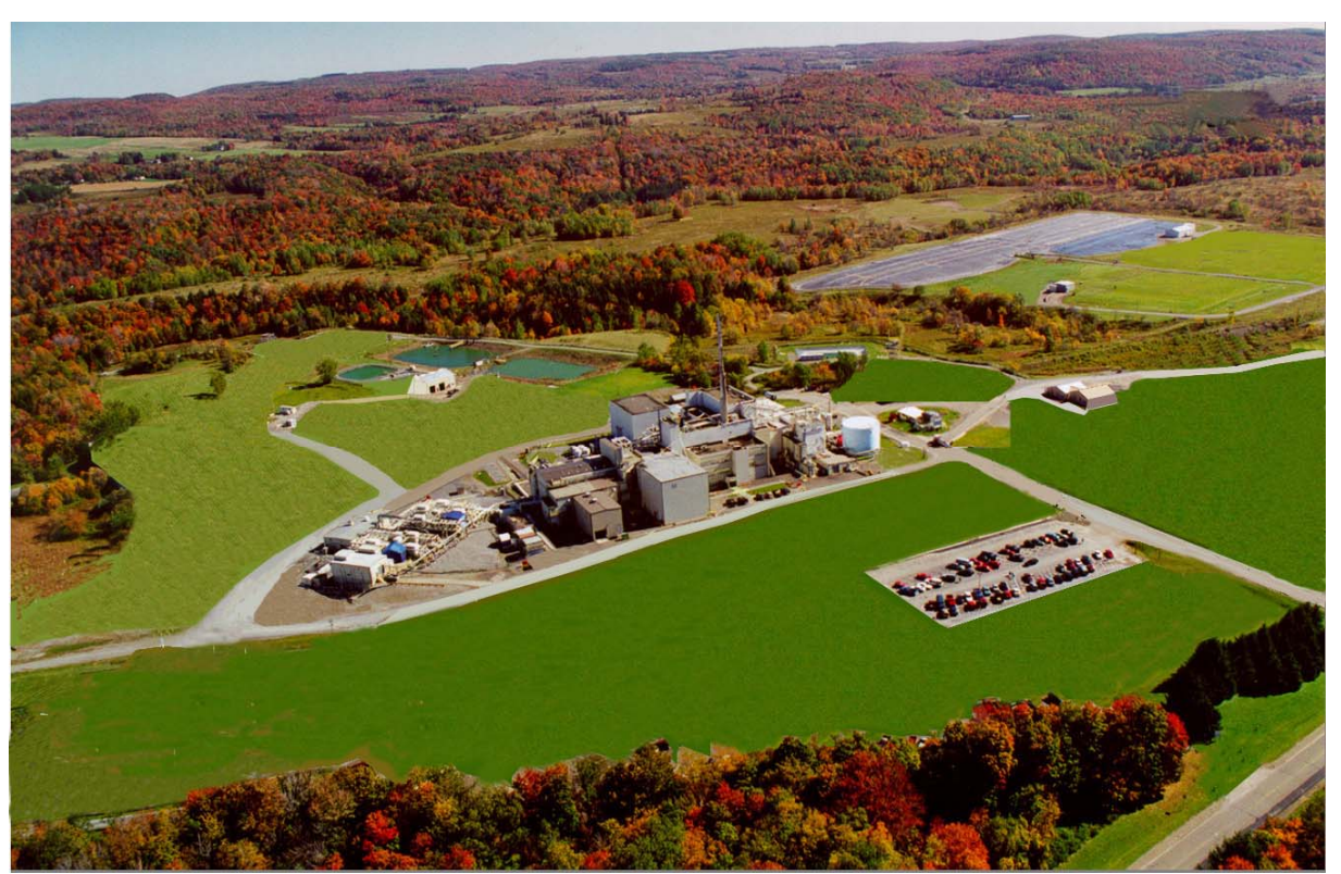
Interim End State Completion – Process building decontaminated, LLW and TRU waste shipped off-site for disposal, non-essential facilities demolished or removed (foundations remain).