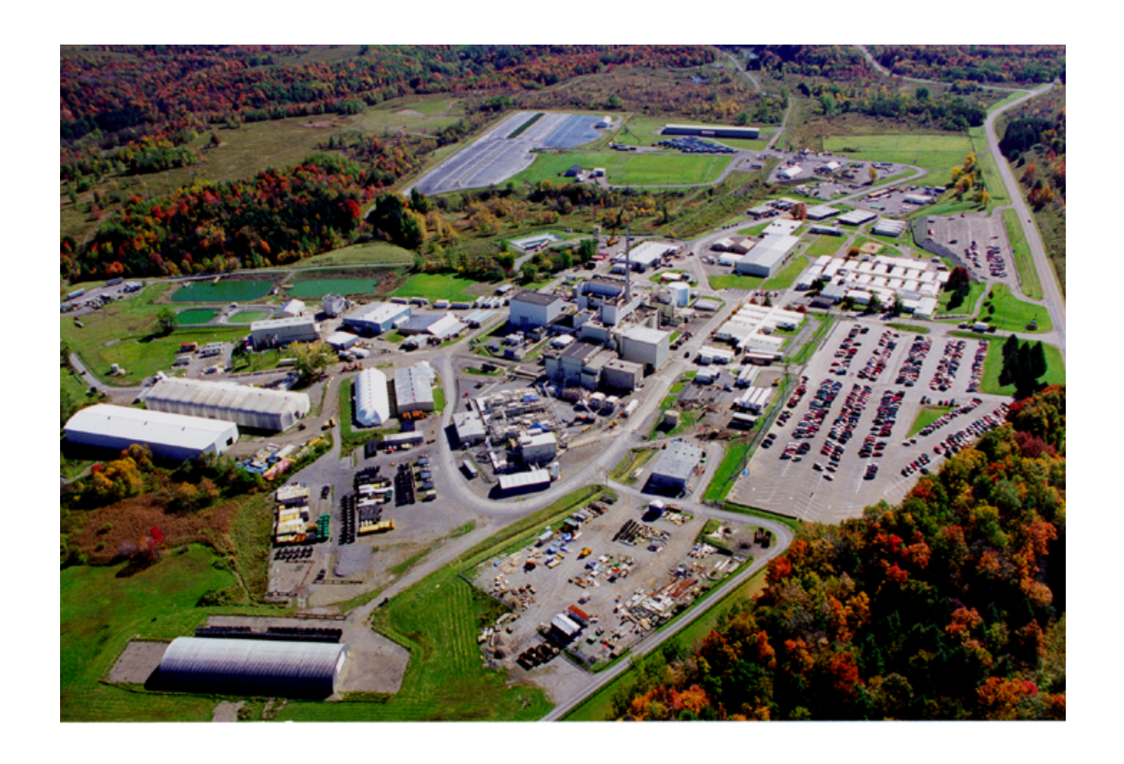
SITE UTILIZATION MANAGEMENT PLAN August 2005