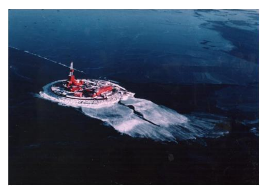
Figure 1: Example manmade island in Beaufort Sea.