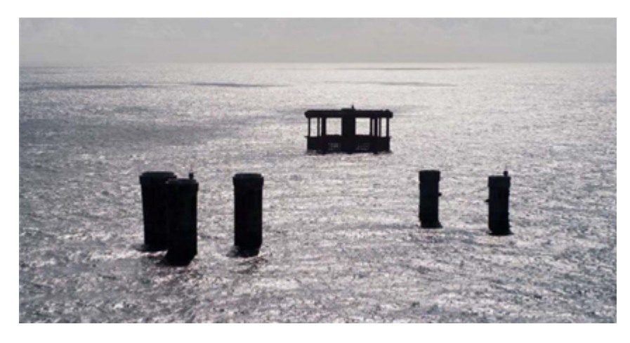
Figure 8: Remaining concrete structures at the Frig Field Center, North Sea

The basic requirement when designing a GBS substructure is that it should be possible to remove it when the field life has come to an end. This has been the case for large GBS structures designed and built for the last 30 years in the North Sea. Removal of the platform is in principle a reverse installation process and the same systems used for installation will be in operation. This does require that all the applicable systems like ballast and skirt evacuation/soil drain system have the same design life as the platform. To obtain this will require high quality stainless steel or titanium material to be used for some equipment and piping systems. The large GBSs that so far have been taken out of service were designed and built prior to implementation of the decommissioning requirement and the substructures of these platforms have been left after removal of the topside. Examples are the Frigg Field Center at the border between Norway and UK in the North Sea and the Ekofisk Tank in the Norwegian sector of the North Sea.