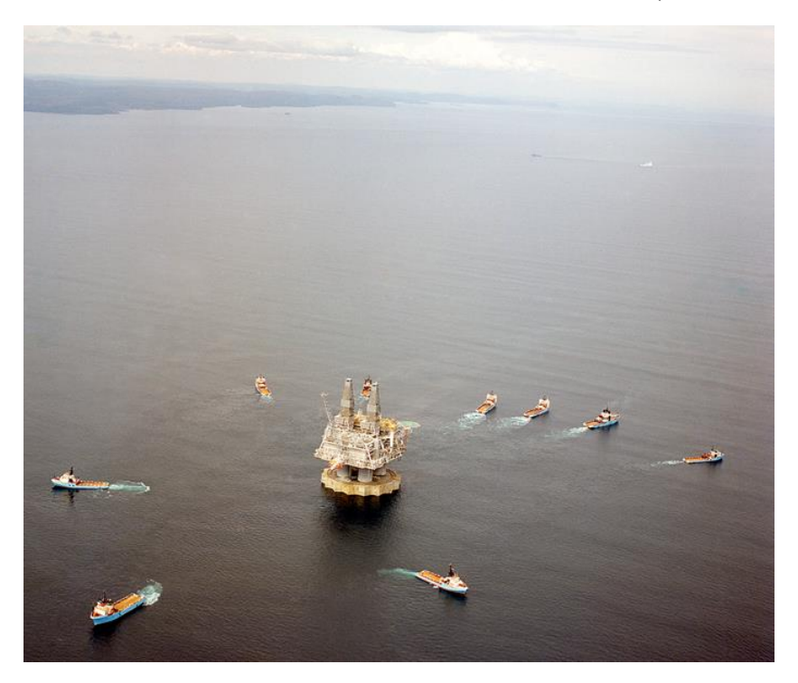
Figure 7: Towing of the Hibernia platform from Bull Arm, Newfoundland, to final location

Figure 6: Construction of the Hebron concrete GBS at the Bull Arm site, Newfoundland