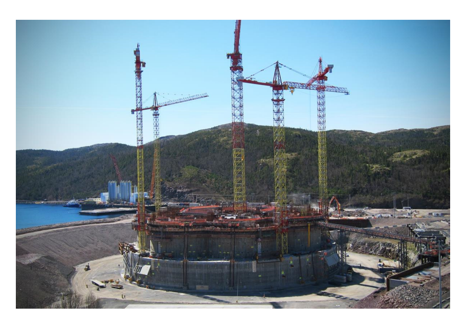
Figure 6: Construction of the Hebron concrete GBS at the Bull Arm site, Newfoundland

the in-field activities. However, if the solid ballast has to be installed after installation this would be another operation that has to be completed in the short open water season.