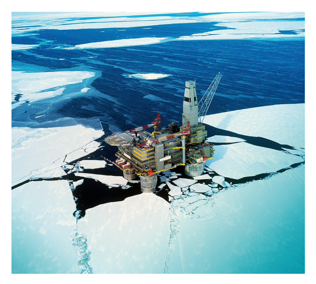
Figure 3: Sakhalin II platform with multi-shaft GBS in level ice.

Offshore Arctic Exploration and Development Technology