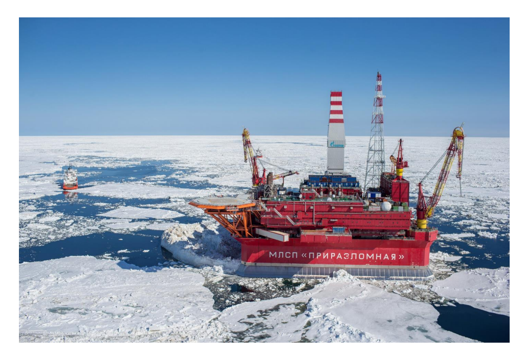
Figure 2: Prirazomnaya monolithic GBS