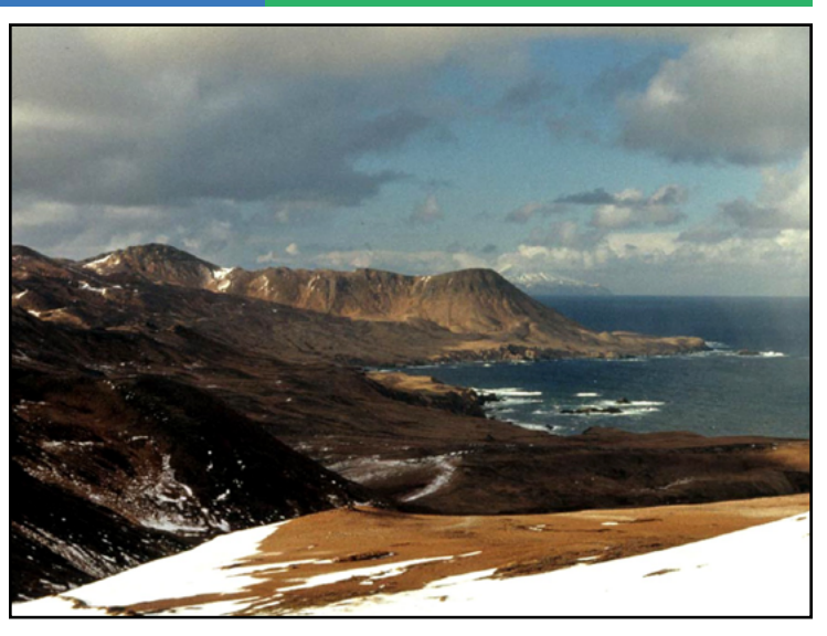
Amchitka Island; View From the East End Looking North (U.S. Fish and Wildlife Service Photo).

Drilling at the three nuclear test sites and the three emplacement/exploratory locations used large quantities of drilling mud, which consisted of water, diesel fuel, and other additives, including bentonite, chrome lignosulfonate, chrome lignite, cement, paper, and sodium bicarbonate. The drilling mud pits were left in place when AEC completed the tests and remained open until DOE began reclamation work in 2001. Chemical analysis of mud pit samples collected during a 1998