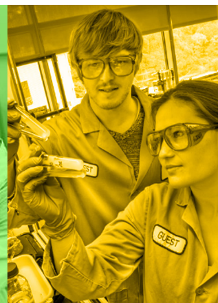
Energy Technology Manufacturing and Workforce

materials and manufacturing process technologies across the Department's mission areas that increase the competitiveness of a secure, domestic supply chain. Novel materials have improved properties, such as high strength, high-temperature performance, and/or enhanced conductivity. Manufacturing process innovations will lead to increased manufacturing and subsequent scale-up of new materials and technologies. In addition, the subprogram will support information technology innovations to enable manufacturing systems and supply chains to be competitive; energy efficient; and responsive to disruption, change, and opportunity. These materials and manufacturing innovations can be deployed by multiple industries and improve U.S. competitive advantage.