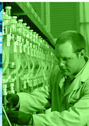
Secure and Sustainable Materials