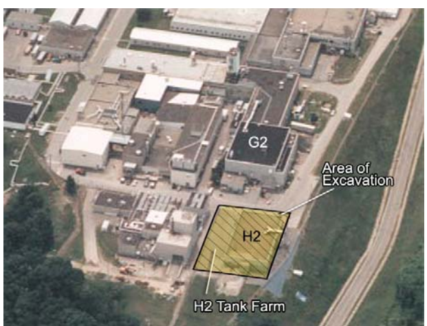
Upper Level Soil Removal (Alternative UL-2)

Alternative UL-2, Upper Level Soil Removal, is the preferred Upper Level land area alternative. Alternative UL-2 best satisfies the evaluation criteria presented in the EE/CA (i.e., effectiveness, implementability, and cost). Alternative UL-2 was also the alternative most preferred by the public, as expressed during the December 22, 2006 to January 26, 2007 public comment period. It is anticipated that Alternative UL-2 will be implemented in conjunction with the Building H2 and G2 removal, which will start in 2008 and finish by 2014.