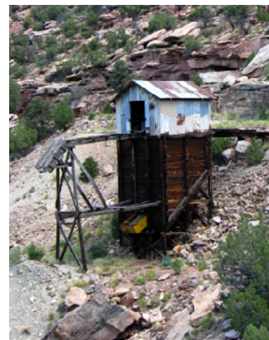
Wild Steer Mine (BLM-administered land).

the report, which identified significant data gaps for DRUM sites. DOE determined that further review of DRUM sites was needed to fully meet the intent of the act. For more information, please visit the Report to Congress web page at www.energy.gov/lm/defense-related-uranium-mines-report-congress .