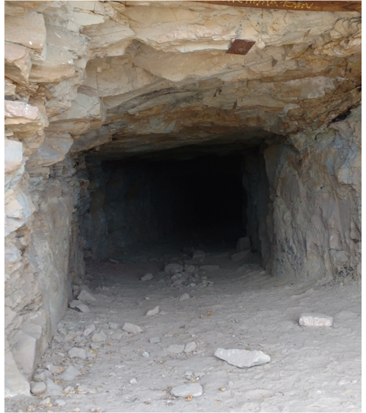
Adit at the Cedar Mine, a Small Mine Located Southeast of Moab, Utah (BLM-administered land).

Field crews implementing the work administered by DOE are the backbone of the program. Their efforts support DOE in achieving its current goal of addressing the estimated 2,500 DRUM sites located on public land by the end of FY 2023.