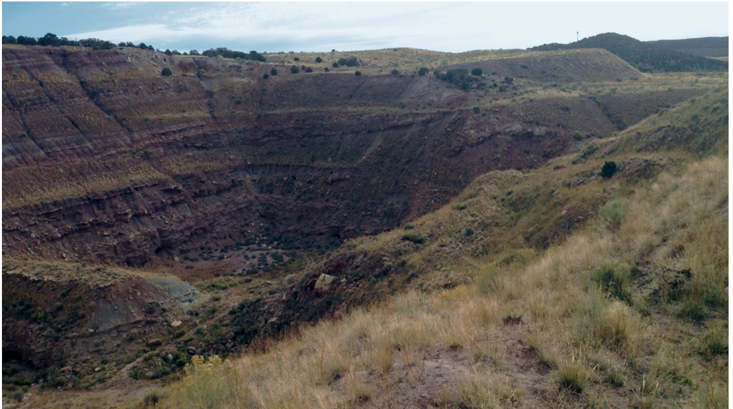
Rattlesnake Open Pit, a Large Mine Located Southeast of Moab, Utah (BLM-administered land).