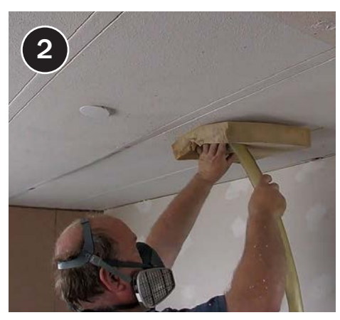
Blow loose fill fiberglass insulation to the correct density while ensuring complete coverage.