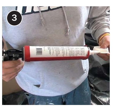
Apply a bead of caulk around the edge access hole plugs or seal holes using an alternative method that is aesthetically acceptable (e.g., foam plug covered with spackling compound).