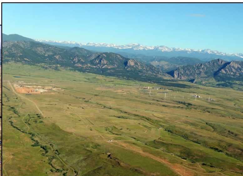
Rocky Flats Site (June 2014).

A separate no-action Corrective Action Decision/Record of Decision (CAD/ROD) dated June 3, 1997, addressed the off-site areas, known as Operable Unit 3.