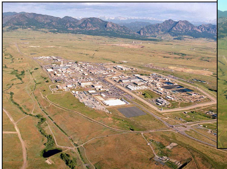
Rocky Flats Site Prior to Final Cleanup (June 1995).

The former Rocky Flats Plant was added to EPA's National Priorities List (NPL) in 1989 because environmental investigations indicated that site operations released materials defined as hazardous substances, contaminants, and pollutants by the Comprehensive Environmental Response, Compensation, and Liability Act (CERCLA). Site operations also released materials defined as hazardous wastes and waste constituents by the Resource Conservation and Recovery Act (RCRA) and the Colorado Hazardous Waste Act (CHWA).