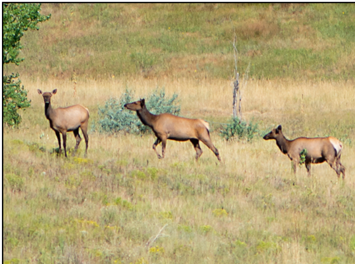
Wildlife at the Rocky Flats Site, Colorado.

LM is responsible for the long-term care of legacy liabilities at former nuclear weapons production sites following cleanup,