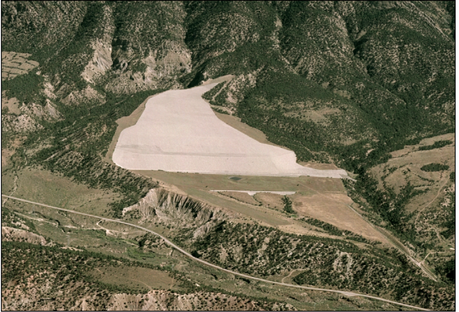
Rifle Disposal Cell, 2010.

applicable standards. The city of Rifle requires residents within the ICs boundary to tap into the municipal water system if the property is annexed to the city. To compensate property owners for limiting the beneficial uses of the groundwater, DOE funded two water line extensions to the current municipal system to ensure the availability of potable water to properties affected by site-related contamination. Because the second water line extension does not provide services within the full extent of the ICs boundary, DOE provided reverse osmosis systems for users within the boundary but beyond the reach of the water line. Energy-related economic growth in the Rifle area during the past decade prompted the city to extend water lines within the ICs boundary and all users are currently serviced by municipal water.