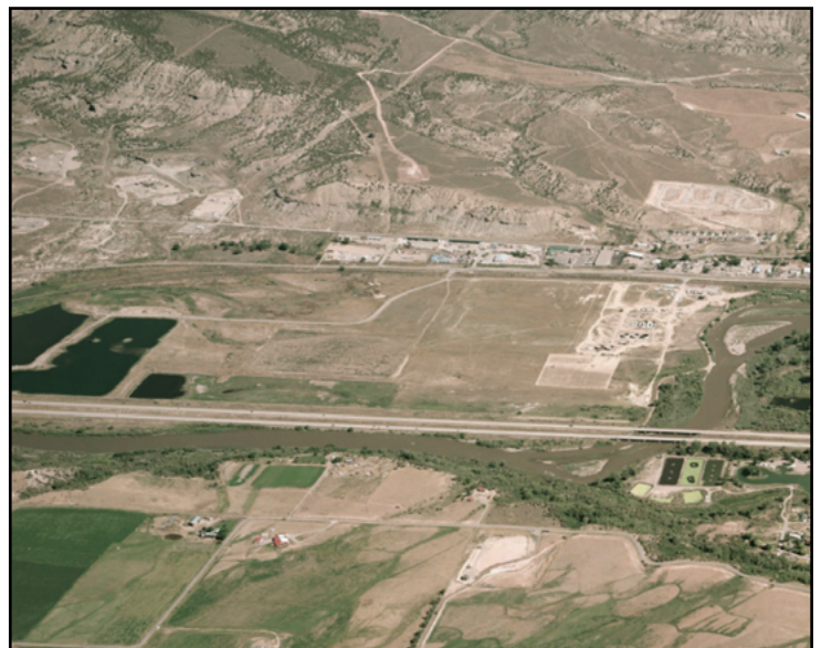
New Rifle Processing Site in 1974 (above) and 2008 (below).