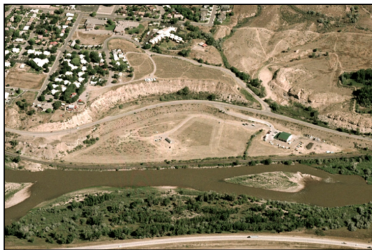
Old Rifle Processing Site in 1957 (above) and 2008 (below).