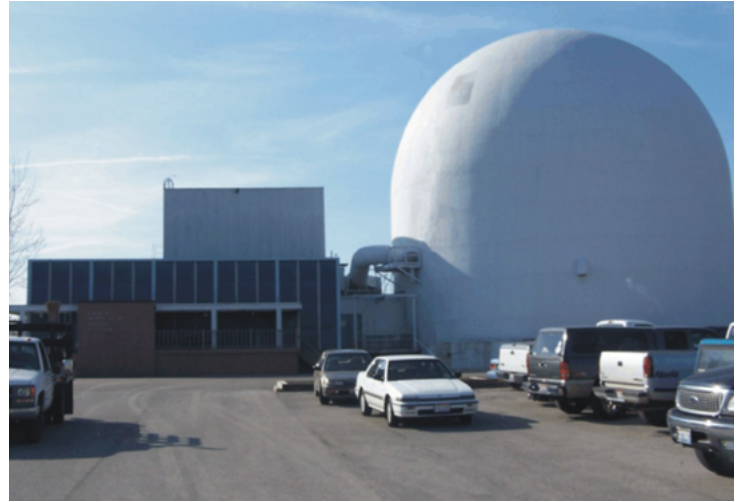
Aboveground Portion of the Piqua Decommissioned Reactor Complex and Auxiliary Building.

In December 2021, DOE finalized its decision to demolish the buildings at the site via an Environmental Assessment/Finding of No Significant Impact . DOE will leave an on-site, low-level radioactive waste entombment belowground in a protected state. In May 2022, DOE will initiate site-demolition activities,