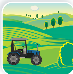
Soil Carbon Sequestration