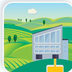
Biomass Carbon Removal and Storage