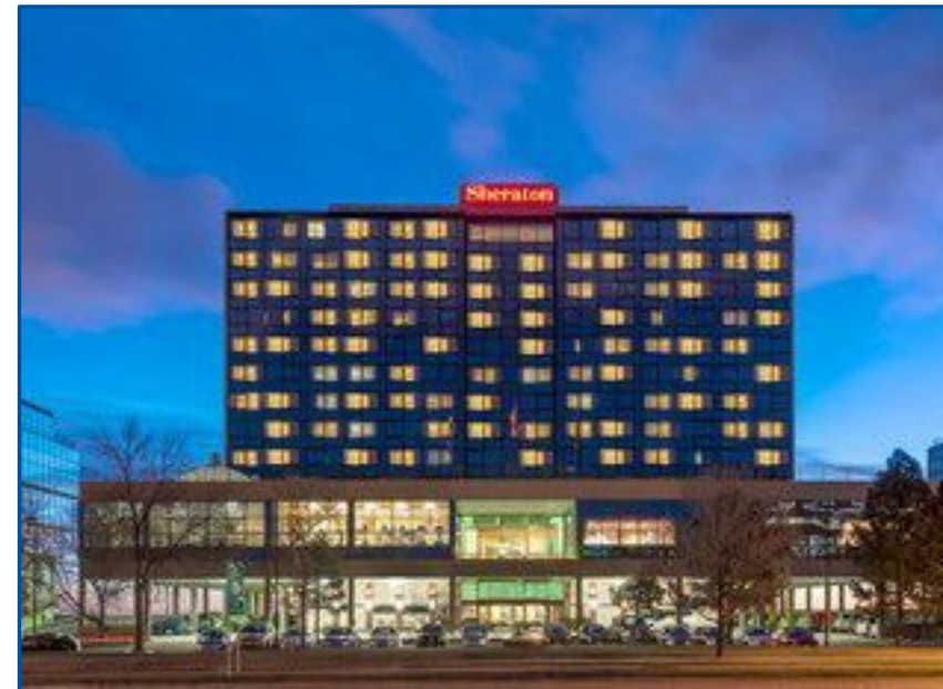
Sheraton Denver West Hotel in Lakewood, Colorado

For more, see https://www.energy.gov/indianenergy/projects/program-review