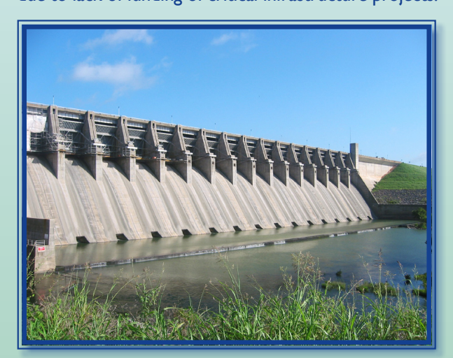
Whitney Dam was fully rehabilitated using $32 million in customer funding, resulting in an uprate of 13 MW.

SWPA must have access to funds when needed to plan for and meet daily contractual commitments in the dynamic energy environment. A lack of funding flexibility hinders SWPA in meeting its obligations to its customers during times of drought and low water conditions. It also elevates the risk for unplanned outages and increased costs at the hydropower plants due to lack of funding of critical infrastructure projects.