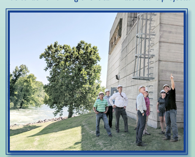
SWPA staff and customers tour Tenkiller Dam, near Gore, Oklahoma.

SWPA must have access to funds when needed to plan for and meet daily contractual commitments in the dynamic energy environment. A lack of funding flexibility hinders SWPA in meeting its obligations to its customers during times of drought and low water conditions. It also elevates the risk for unplanned outages and increased costs at the hydropower plants due to lack of funding of critical infrastructure projects.