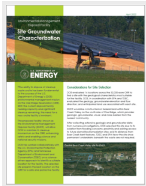
EMDF Site Groundwater Characterization fact sheet