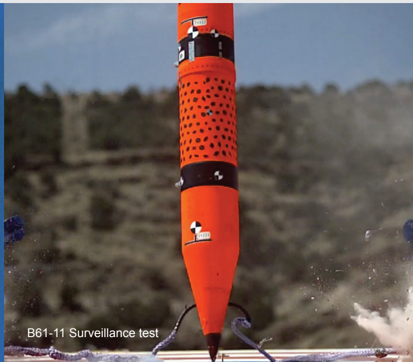
B61-11 Surveillance test