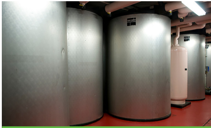
An 8,600 ton-hour ice-on-coil internal melt TES system supplements the traditional air conditioning at Rockefeller Center in New York City. 8

Most latent heat technologies use frozen water (ice) as the phase change material, although others have been employed (e.g., eutectic salts). These technologies store cool energy in the form of ice at 32°F; the ice absorbs heat during its phase change to water, with a heat of fusion of 144 Btu/lb. Ice storage systems require a charging fluid at temperatures of 15°F or more below the normal operating range of conventional cooling equipment for air conditioning. Depending on the storage technology, special ice-making equipment may be used, or standard chillers could be engineered for low-temperature operation. The heat transfer fluid may be the refrigerant itself or a secondary coolant such as water–glycol or some other antifreeze solution. Table 2 shows ice storage technologies in common use today.