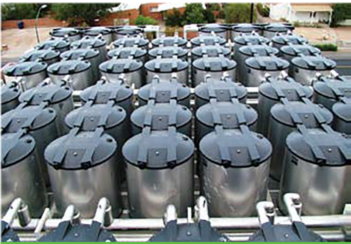
Ice storage integrated with CHP provides 23,400 ton-hours of cooling at the University of Arizona in Tucson. 4

Cool TES technologies provide advantages to both facilities and utilities. For sites, TES helps reduce energy costs (through load shifting) and equipment costs (through equipment size optimization). For example, many office buildings have air conditioning loads during the day that are two or more times above their average load. 3 The technologies can be integrated into microgrids to help balance cooling supply and demand. Cooling backup can be made available to sites that rely on intermittent renewable resources such as wind and solar. Utilities also benefit when customers implement Cool TES technologies, as they help alleviate strain on the grid by reducing peak electricity demand. Peak load management can help utilities defer or avoid expensive generation, transmission, and distribution system upgrades.