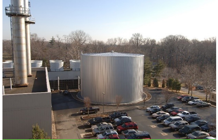
The 40,000 ton-hour low-temperature-fluid TES tank at Princeton University provides both building space cooling and turbine inlet cooling for a 15 MW CHP system. 1

This fact sheet is focused on TES used in CHP applications. For CHP sites, thermal energy can be stored in various forms for cooling (collectively referred to as “Cool TES”) or stored as hot water for heating.