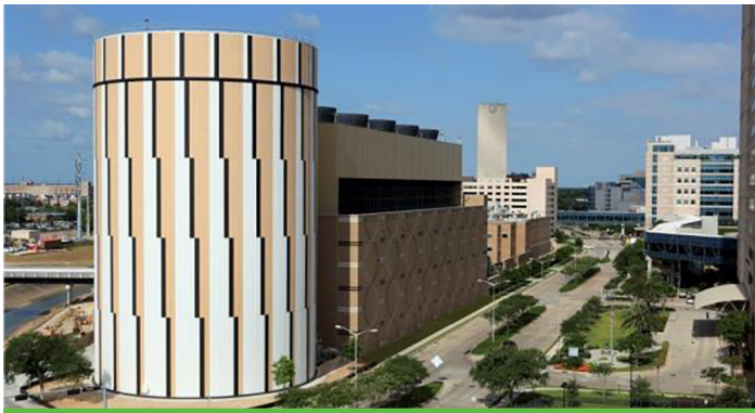
This 8.8-million-gallon chilled-water TES tank provides 75,000 ton-hours of cooling, integrated with 45 MW CHP at Texas Medical Center in Houston. 2

Cool TES technologies provide advantages to both facilities and utilities. For sites, TES helps reduce energy costs (through load shifting) and equipment costs (through equipment size optimization). For example, many office buildings have air conditioning loads during the day that are two or more times above their average load. 3 The technologies can be integrated into microgrids to help balance cooling supply and demand. Cooling backup can be made available to sites that rely on intermittent renewable resources such as wind and solar. Utilities also benefit when customers implement Cool TES technologies, as they help alleviate strain on the grid by reducing peak electricity demand. Peak load management can help utilities defer or avoid expensive generation, transmission, and distribution system upgrades.