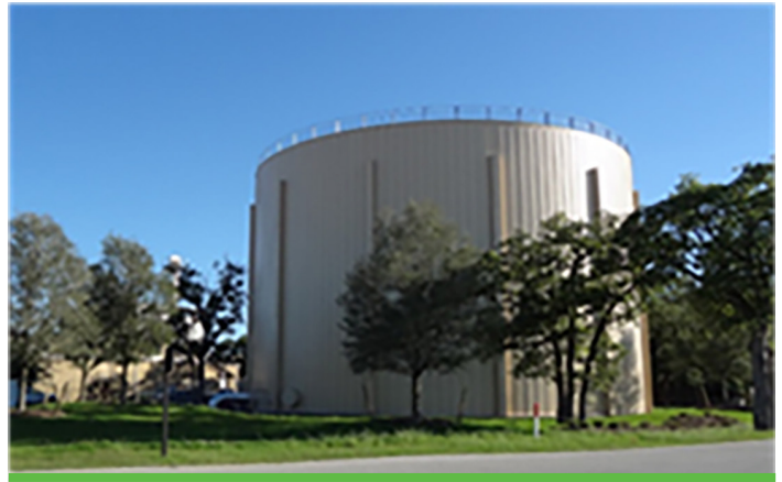
The 24,000 ton-hour thermally stratified chilled water TES tank is integrated with the 45 MW CHP system at Texas A&M University. 6

Several design variations have been used for chilled water systems, as listed in Table 1 , but all work on the same principle: storing cool energy based on the heat capacity of water (1 Btu/lb-°F). Stratified tanks are by far the most common design. In these systems, colder water remains at the bottom, and warmer, lower-density water remains at the top. During times of peak cooling demand, the cooler water flows out the bottom and is integrated into the cooling system, leaving warm water in the tank. During off-peak hours, the warm water exits the tank at the top and runs to the chiller. Chilled water systems typically store supply water at 39°F to 42°F, which is compatible with most water chillers and distribution systems. Return temperatures are typically in the range of 55°F to 60°F or higher. Stratified low-temperature-fluid TES systems operate similarly but with lower supply temperatures, typically between 29°F and 36°F.