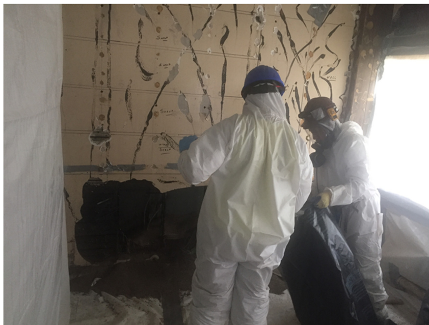
Photo 8. Asbestos Workers Removing Vermiculite for Disposal

Photo 8 shows two asbestos abatement workers in proper PPE and inside a containment area, shoveling vermiculite (that poured out from the Administration Building north wall area onto the floor) into asbestos disposal bags.