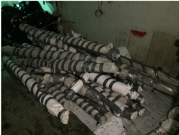
Photo 26. ACM Pipes