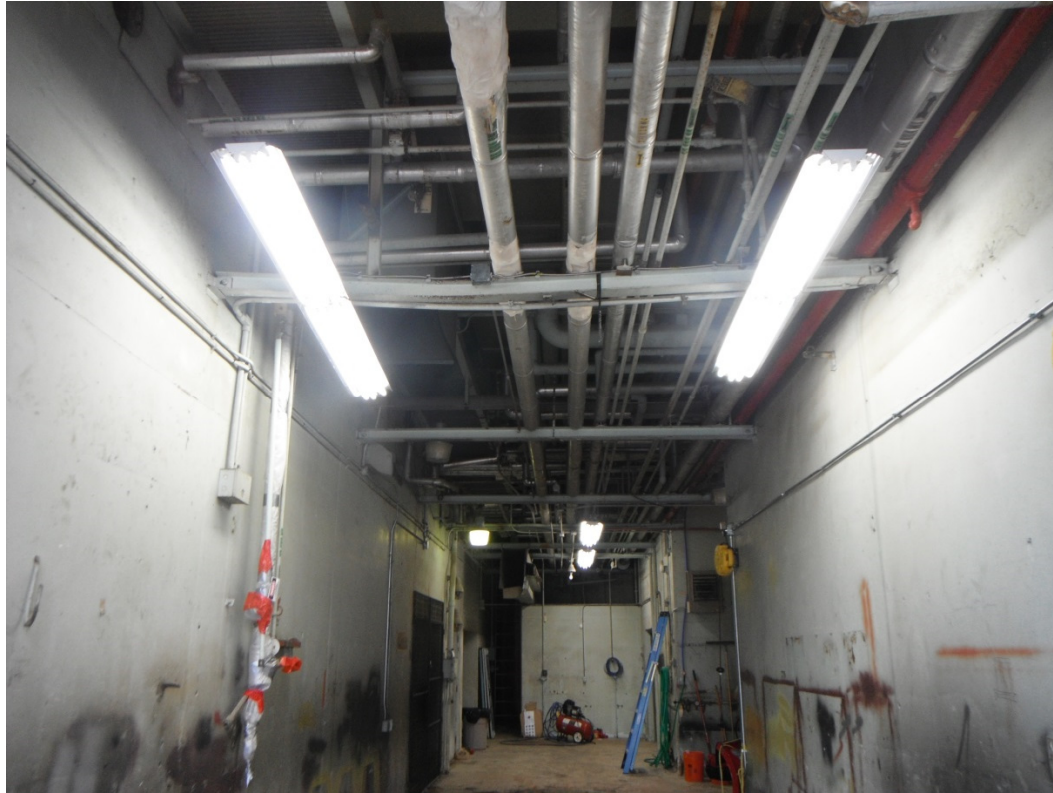
Photo 13. Piqua Administration Building, Basement Level Hallway, Before Abatement

Photo 13 and Photo 14 are before and after images of the Administration Building basement level hallway. More than 2500 linear feet of ACM pipes were glove bagged, cut, and wrapped for disposal. This area required scaffolding and scissor lifts to access the pipes.