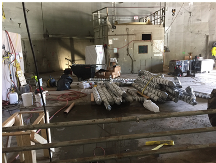
Photo 27. Laydown Area