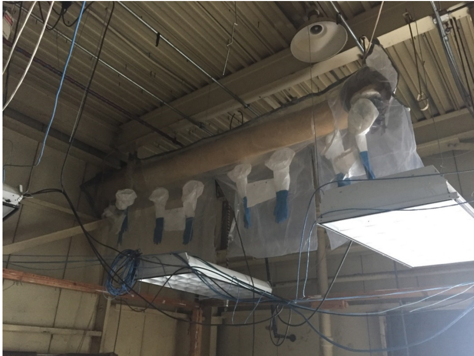
Photo 31. Administration Building, First Floor: Glove-Bag Abatement in Conference Area