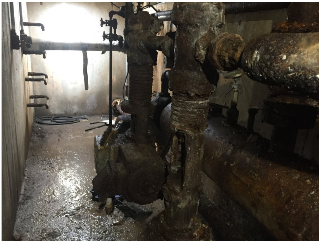
Photo 23. North Vault After Pumping and Before Abatement