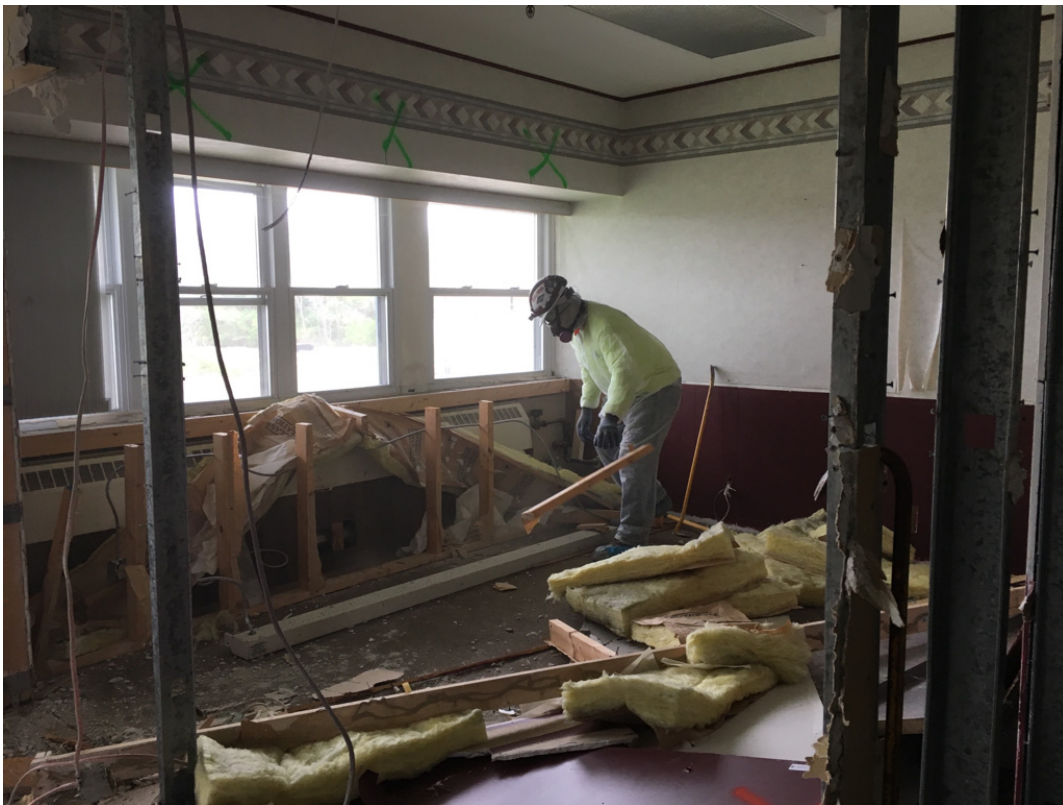
Photo 3. Administration Building, First Floor Office Area, Selective Demolition