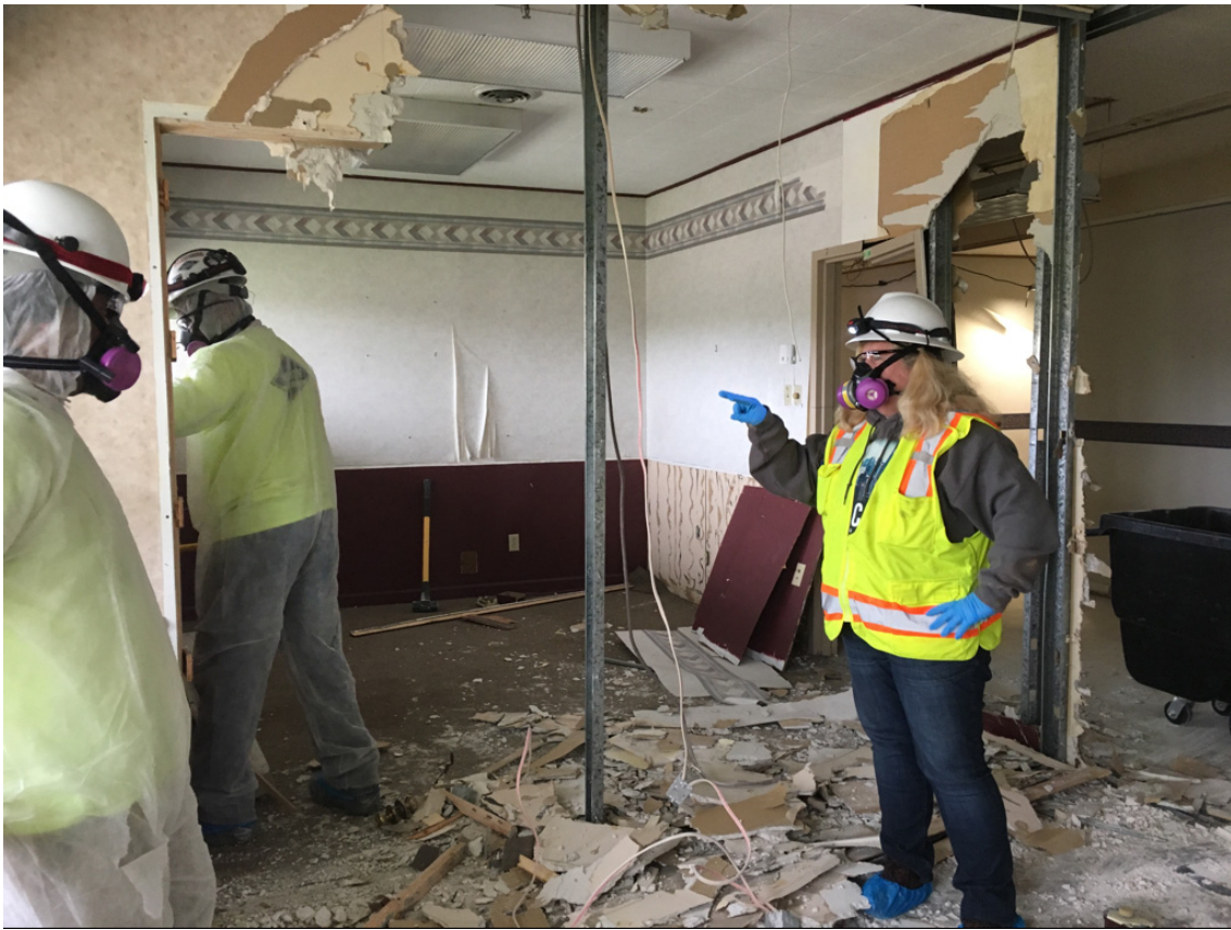
Photo 4. Administration Building, First Floor Office Area, Demolition

During the planning of waste loadout from the third-floor demolition, the approach for waste loadout was altered from the original plan. The original plan was to walk and carry the debris down two levels of winding stairs to the first floor, and then discard the waste in the dumpster for construction and demolition (C&D) debris. The revised approach (as documented in the revised work plan submittal number 44) was to utilize the Administration Building roof as the loadout area. The rationale for the change was driven by the safety benefit to the workers, allowing for the loadout to be placed onto the third-floor exterior exit door platform, where a second worker would carry the bagged debris across a level walking area directly to a large waste box—an activity involving no stairway tripping hazards and less worker fatigue. The protection of the roof with a plywood walkway to ensure compliance with the National Historic Preservation Act, the establishment of the leading edge line for safety, and the use of a waste box to load and unload the demolition debris were procedures put in place. The waste box was lifted to and from the roof using the telehandler, with a spotter on the roof as well as in the parking lot. The same waste loadout approach was used during the third-floor ACM abatement (see Photos 5, 6, and 7).