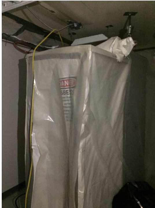
Photo 33. Containment Entrance to Clean Room

Throughout each working day, Neuber and Rii personnel frequently monitored the negative pressure differential in the full containment with a manometer (Photo 34). A pressure differential of 0.02 inch of water or above was required. When the pressure differential dropped less than 0.02 inch of water, the work practices and containment setup were evaluated to determine the root cause. Corrective measures included adding additional air filtration devices to lower the inside containment negative pressure, reducing the number of times workers went in and out of containment, and reinforcing to the workers the proper closure of the containment poly door flaps.