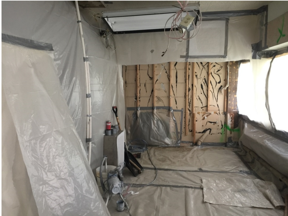
Photo 30. Administration Building, First Floor: Inside Full Containment