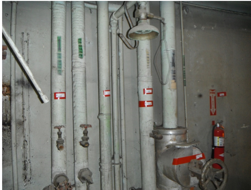
Photo 17. Reactor Building, Level 100, Before Abatement

The 4380 ft 2 Reactor Building has an above-ground containment dome known as Level 100 that extends 68 feet high. The portion of the Reactor Building below grade has several levels and extends 44 feet below ground level. Photo 17 shows a section of ACM pipes requiring abatement located at Level 100 in the Reactor Building. Photo 18 shows the same area after the ACM pipes had been removed.