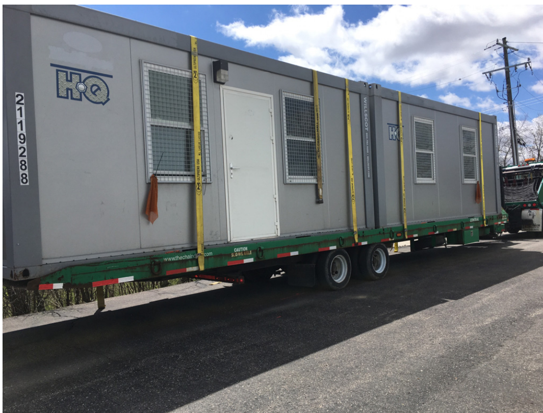
Photo 1. Arrival of Project Trailers

Mobilization started as scheduled on Monday, April 15, 2019, with focus on equipment and supply receipt, placement of three 8 × 20 trailers, and setting up the perimeter fence defining the project area. At the request of LM, the LMS project lead made provision for a U.S. Army Corps of Engineers sitewide tour on the that day to participate in a walkdown of the facilities prior to abatement and scheduled the de-energizing of the site electric power for April 16. The abatement contractor Neuber followed suit by rescheduling the temporary electric hookup for the trailers for the afternoon of April 16. Similar LM requests to accommodate site tours and other activities occurred throughout the project, and the LMS contractor accommodated these access requests with no adverse impact to the abatement project.