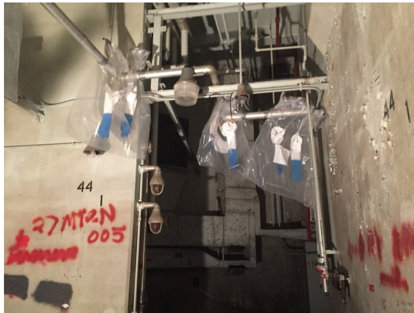
Photo 19. Reactor Building, Level 56, Before Abatement

Photo 19 shows the placement of glove bags in preparation of removal of ACM pipes in an area on Level 56 in the Reactor Building, and Photo 20 shows the same area after the ACM pipes had been removed. That removal required the use of a scissor lift due to the area limitations and height of the pipes.