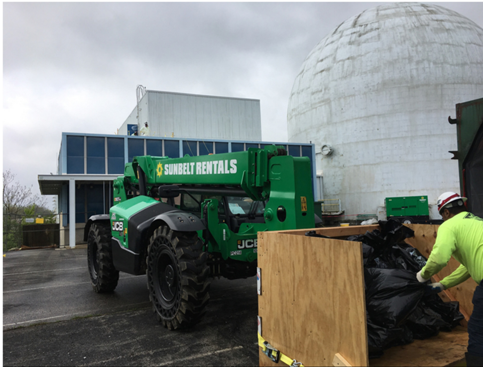
Photo 28. Using a Waste Box to Transport ACM Bags to the Waste Container

The integral process of properly dispositioning waste was well executed, given the circumstance that the Piqua site is a remote unmanned facility. The advanced and real-time coordination among the project workers at the Piqua site; the certified waste shipper in Westminster, Colorado; and the LM security subcontractor in Grand Junction, Colorado, was exceptional.