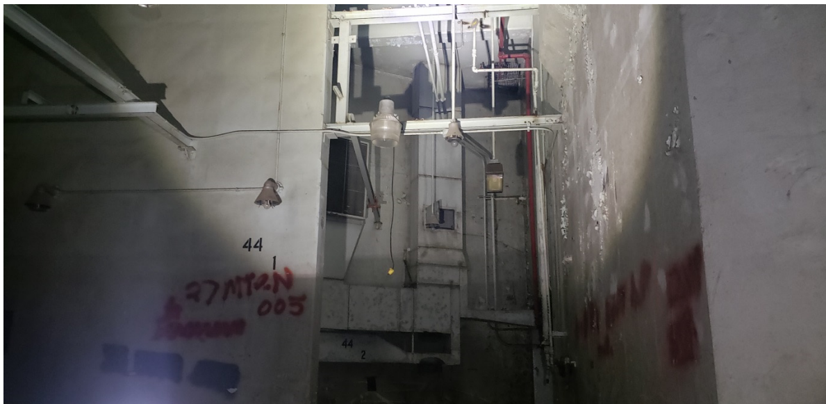
Photo 20. Reactor Building, Level 56, After Abatement