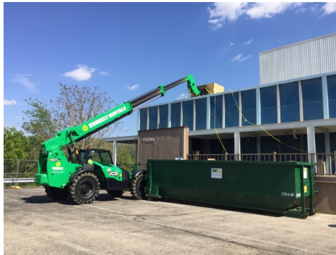
Photo 6. Using a Telehandler to Move the Waste Box