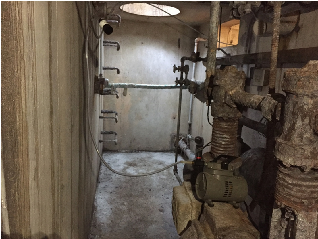
Photo 24. North Vault Final Condition, After Abatement

To summarize the asbestos abatement project, Table 6 provides a detail inventory of abated material during the Piqua asbestos abatement project.