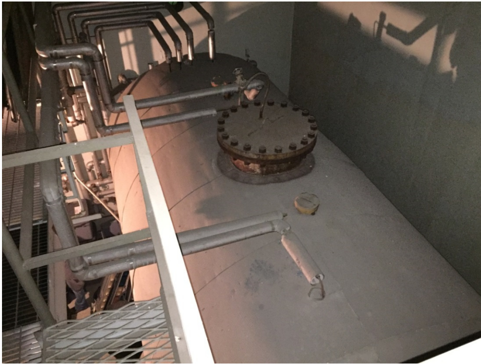
Photo 15. Administration Building, Basement, Large Chemical Tank Before Abatement

Photo 15 and 16 illustrate the large chemical tank inside the Administration Building before and after abatement. In Photo 15, the view is from above the tank that has metal-jacketed ACM. In Photo 16, the metal jacket and the ACM has been removed to reveal the heating coils on the tank.