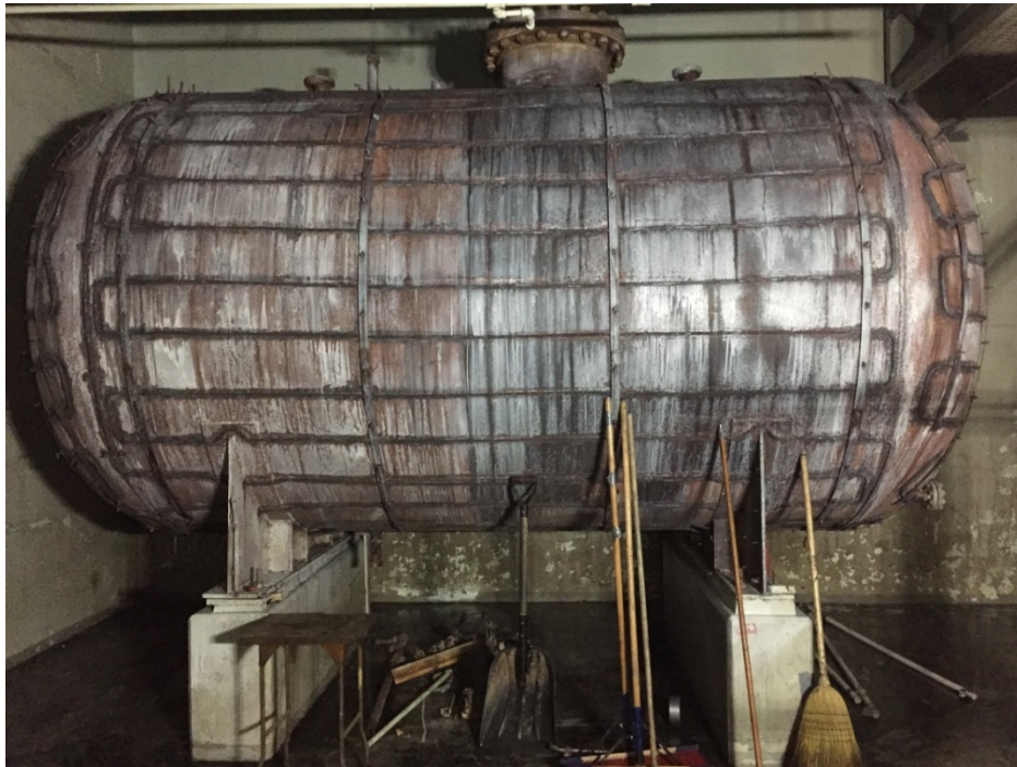
Photo 16. Administration Building, Basement, Large Chemical Tank, After Abatement