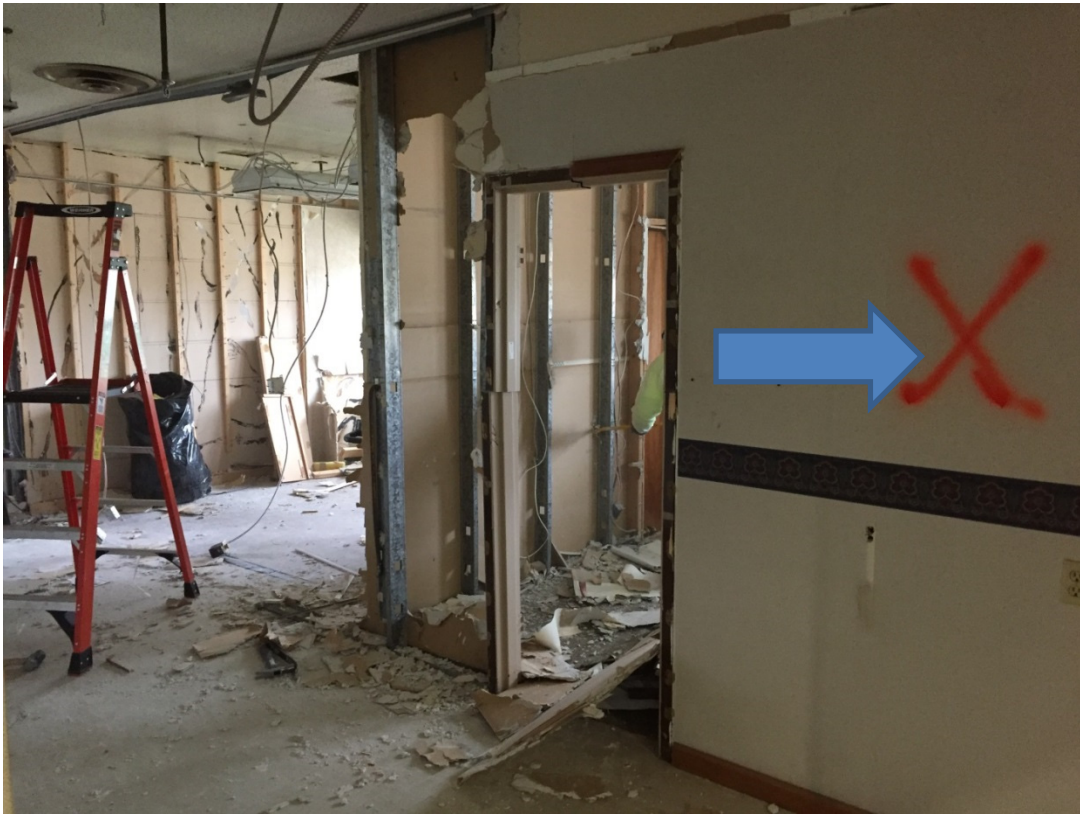
Photo 2. Administration Building, First Floor Office Area, Wall Marked for Selective Demolition