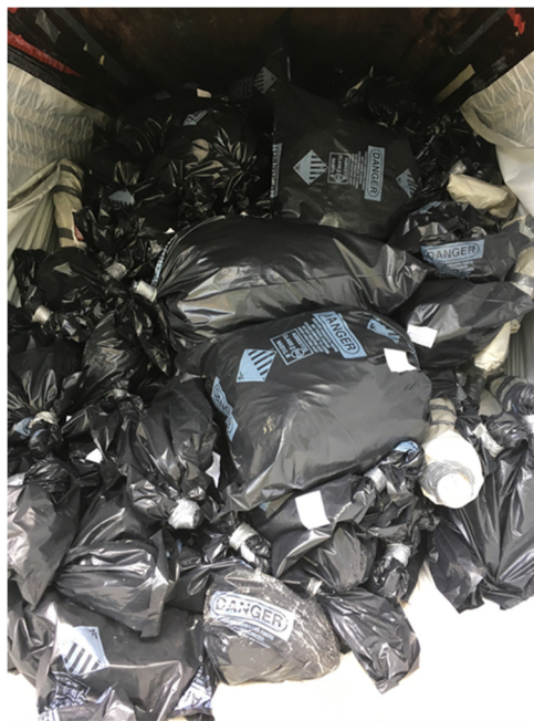
Photo 25. ACM Bags

Photos 25–28 illustrate different aspects of the placement of ACM into the waste container. Photo 25 shows ACM-labeled double bagged-units. Photo 26 shows glove-bagged ACM pipes wrapped and candystriped. Note that the sharp edges of cut pipe are taped to prevent injury in transport and avoid tearing adjacent ACM bags. Photo 27 shows a laydown area of abated ACM pipe lifted from the lower levels of the Reactor Building. Photo 28 illustrates the innovation of using a waste box for safe handling and transport of waste material.