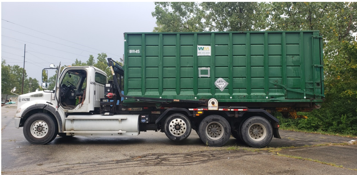
Photo 29. ACM Waste Container Approved for Transport to Stony Hollow Disposal Facility

Of the 10 waste shipments that were prepared for transport at the Piqua site, the majority of shipments were scheduled to be picked up at 7:00 a.m. eastern standard time (EST). This required the certified shipper to be working by 5:00 a.m. EST (3:00 a.m. MT) to review inspection logs and photographs of the waste load to verify compliance prior to signing the waste manifest (Photo 29). Once the waste load was approved for transport, the certified shipper notified LM 24-hour site security subcontractor that the hazardous waste shipment was in route to the licensed landfill. When the waste container arrived at the landfill, Nueber staff notified the certified shipper, and the certified shipper notified LM security.