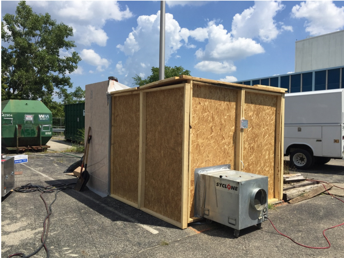
Photo 21. Entry to the Below-Grade Utility Vaults

The abatement of the utility vaults below grade was a challenging endeavor. Air monitoring was required prior to entry into the confined space each day. As shown in Photo 21, a wooden containment area was constructed to be use as the entry point. This structure provided asbestos containment and served as a barrier to entry to prevent falls into the confined space opening.