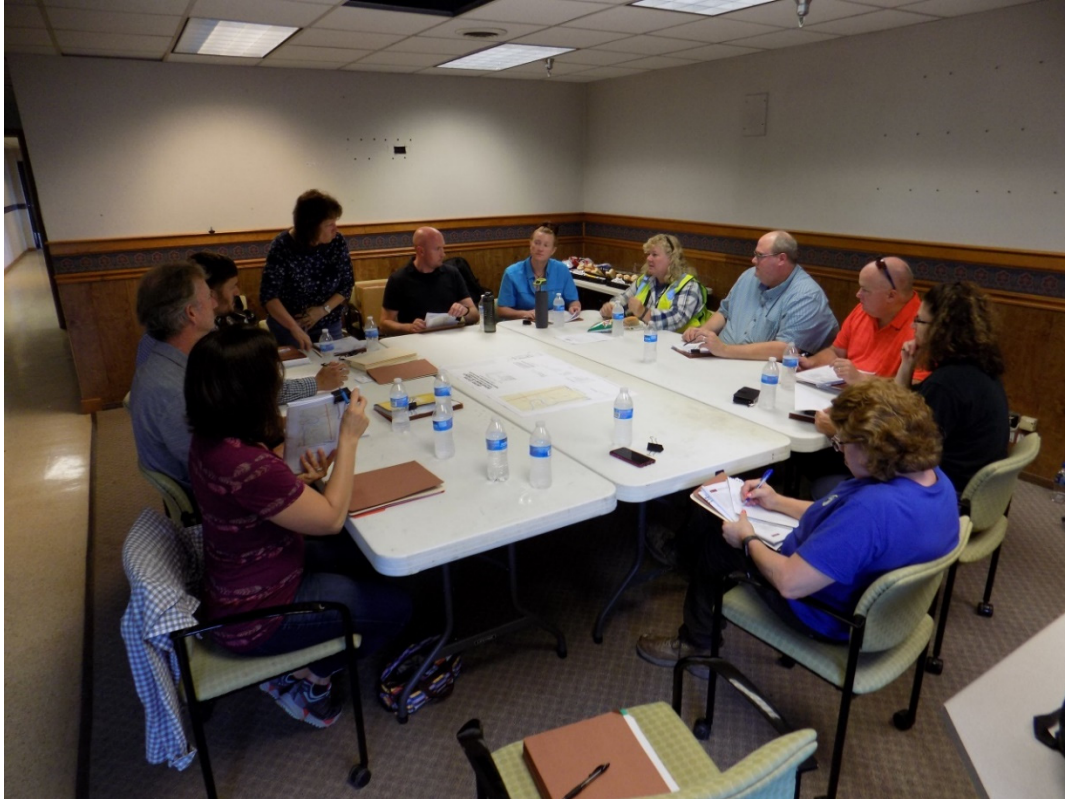
Photo 11. Piqua Administration Building, Conference Room, Before Abatement

Photo 11 shows the first-floor Administration Building conference room before abatement. The area included false rear walls, a dropped ceiling, and carpeting. The room required selective demolition since the room had concealed ACM pipes, ACM floor tiles, and ACM mastic. Photo 12 shows the same room after selective demolition and abatement of those ACM materials.