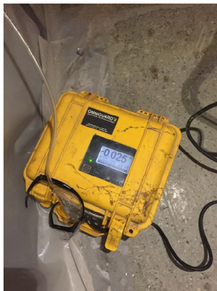
Photo 34. Manometer

Throughout each working day, Neuber and Rii personnel frequently monitored the negative pressure differential in the full containment with a manometer (Photo 34). A pressure differential of 0.02 inch of water or above was required. When the pressure differential dropped less than 0.02 inch of water, the work practices and containment setup were evaluated to determine the root cause. Corrective measures included adding additional air filtration devices to lower the inside containment negative pressure, reducing the number of times workers went in and out of containment, and reinforcing to the workers the proper closure of the containment poly door flaps.