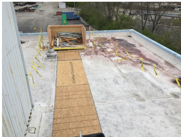
Photo 7. Waste Loadout Area on the Administration Building Roof