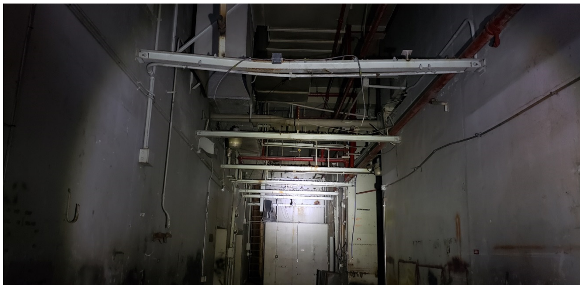
Photo 14. Piqua Administration Building, Basement Level Hallway, After Abatement