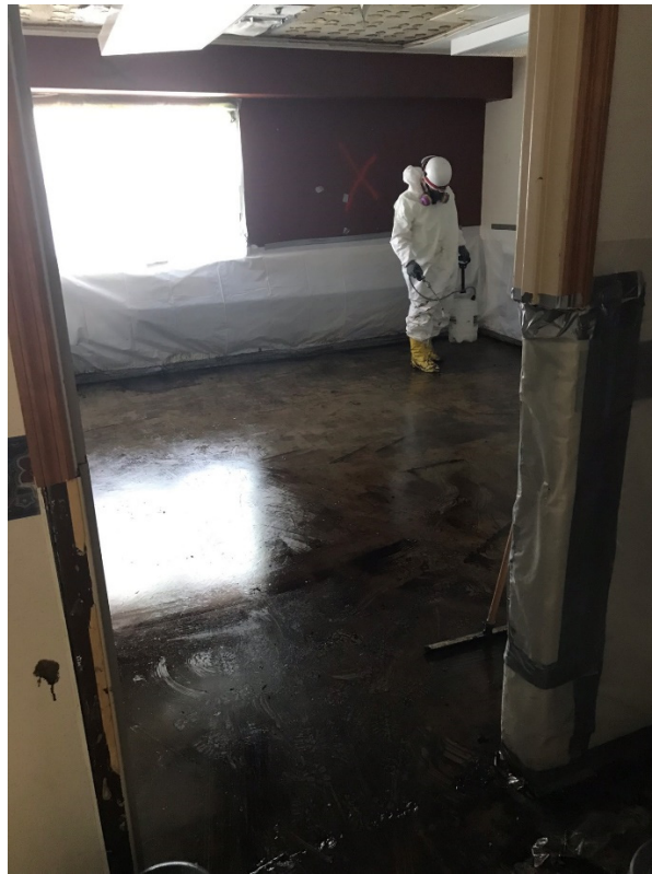
Photo 32. Administration Building, Third Floor: Floor Tile/Mastic Removal in Full Containment

Each full containment constructed required a decontamination enclosure system. Neuber was required to submit an abatement work plan detailing the containment area for review and approval by Navarro and Rii prior to starting the abatement. The containment entrances required building-suitable framing or portable prefab units. The containment entrances (Photo 33) were constructed as three totally enclosed chambers (Equipment/Dirty Room, Shower Room, and Clean Room). The Equipment Room had an airlock to the work area and a curtained doorway to the Shower Room. The Shower Room had two curtained doorways (one to the Equipment Room and one to the Clean Room) and contained at least one shower with hot and cold water. All wastewater from the Shower Room was collected and pumped through a 5-micron filter system, and the filter was disposed of as contaminated ACM waste. The Clean Room had one curtained doorway into the Shower room and one entrance or exit to non-contaminated areas of the Administration Building. The Clean Room had sufficient space for storage of the workers' street clothes, towels, and other noncontaminated items. Joint use of this space for other functions, such as offices or storage of equipment, materials, or tools, was prohibited.