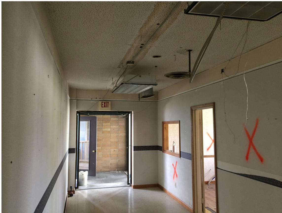
Photo 9. Piqua Administration Building, First Floor Office Area, Before Abatement