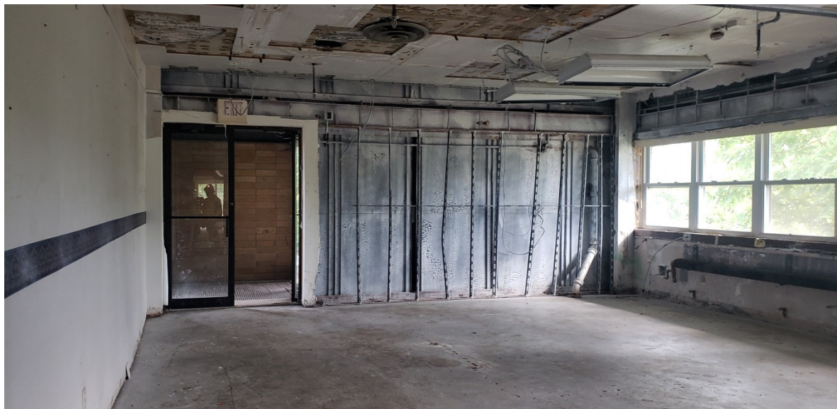
Photo 10. Piqua Administration Building, First Floor Office Area, After Abatement