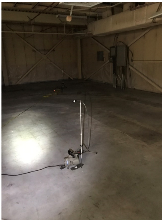
Photo 35. Air Clearance Testing

Rii, as the abatement oversight contractor and the asbestos abatement SME for this project, performed air monitoring during abatement, and for final air clearance testing (Photo 35). Rii also was responsible for approving the continuation of Neuber work practices (daily practices, enclosure construction, modification and removal, and permits for unrestricted entry). In addition, after Neuber provided notification that the abatement was complete (Attachment 11), Rii was responsible for visually inspecting the abatement area and performing final air clearance testing within each containment. Prior to the performance of final air clearance monitoring, Rii completed a visual inspection of each containment for the potential presence of asbestos dust or residue (Attachment 12). If residue is found, the entire abatement work area was given another vacuuming or wipe down.