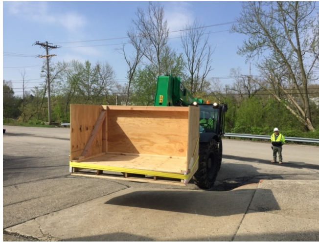
Photo 5. Waste Box for Debris from the Administration Building