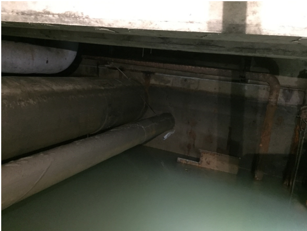
Photo 22. Water in the North Vault, Before Abatement