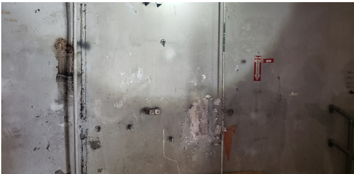
Photo 18. Reactor Building, Level 100, After Abatement