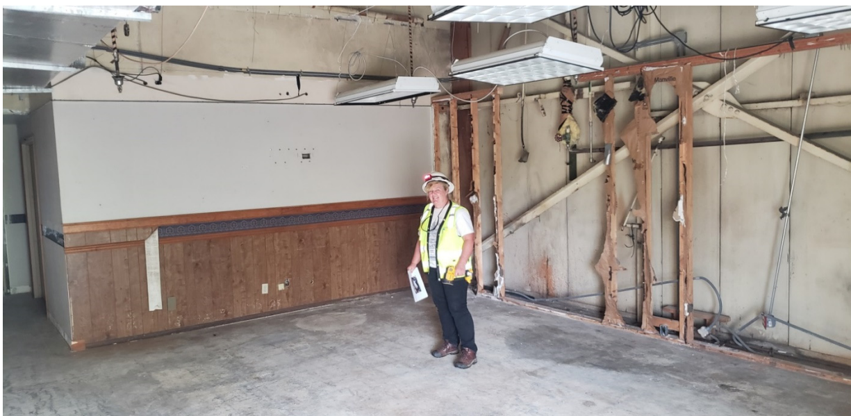
Photo 12. Piqua Administration Building, Conference Room, After Abatement