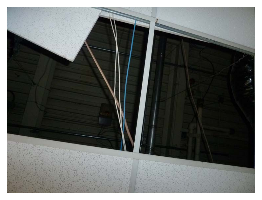
Photo 10. Example of I-beams (in background) and drop ceilings (in foreground) in the administration building which contain LBP (and also PCBs) and asbestos, respectively.