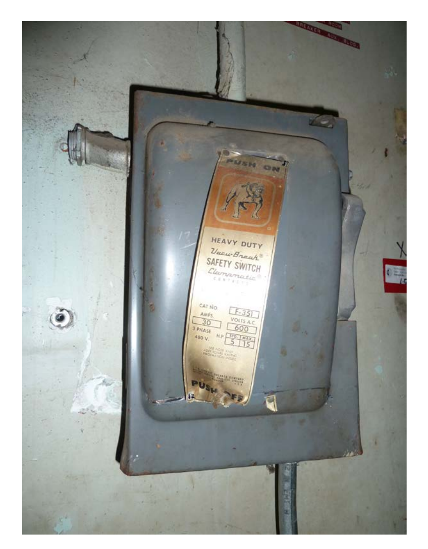
Photo 12. Example of a switch which likely contains mercury. Such switches are throughout the aboveground buildings at the PDRS, and would be handled by trained workers and disposed of at state-approved facilities.