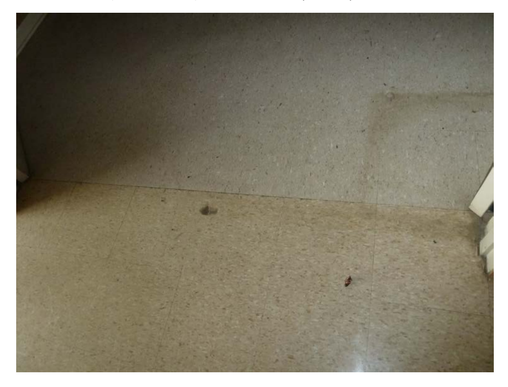
Photo 11. Darker floor tiles in bottom portion of frame contain asbestos and will be abated prior to the proposed demolition. Newer tiles in upper portion of frame do not contain asbestos and therefore will remain in administration building. Floor tiles within three offices within this building contain asbestos.