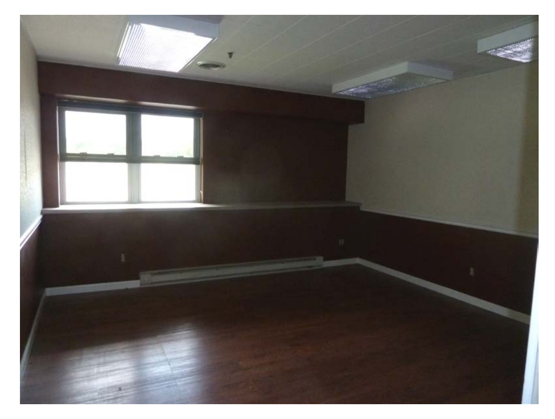
Photo 14. One of the three offices in the administration building. The falls wood floors overlie ACM flooring, which will be abated prior to the proposed demolition.