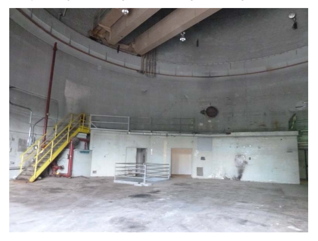
Photo 4. Platform within interior of aboveground containment dome. Chemicals were previously stored under platform.