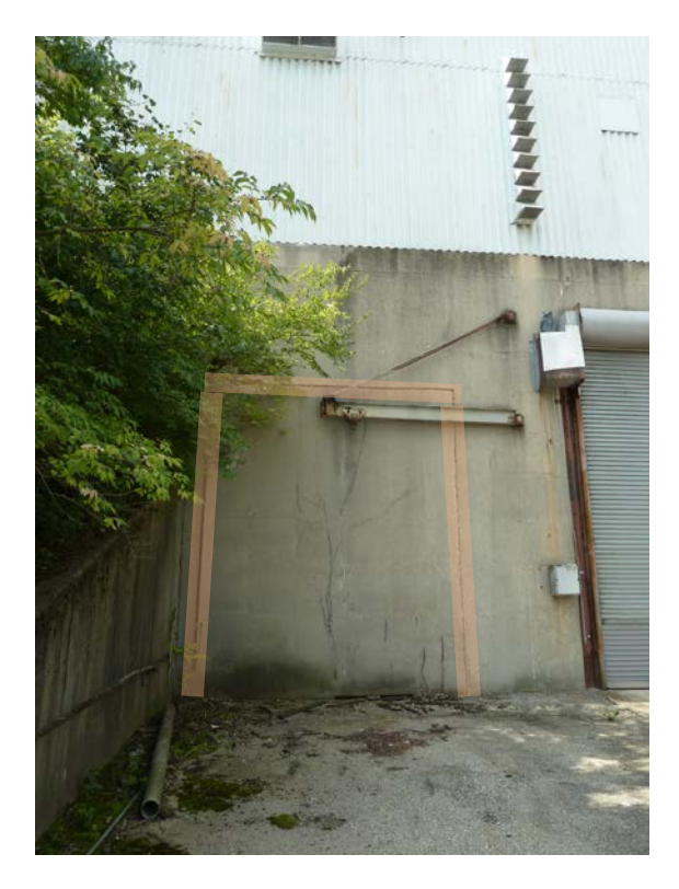
Photo 9. Caulk/epoxy, which may contain asbestos, within the seam of the concrete on the eastern side of the administration building (indicated with transparent orange coloration).