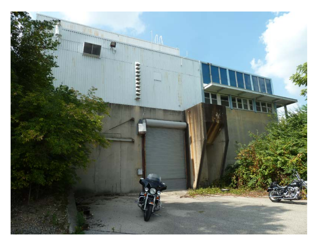
Photo 8. Eastern side of administration building. Blue panels between windows in right side of frame contain asbestos.