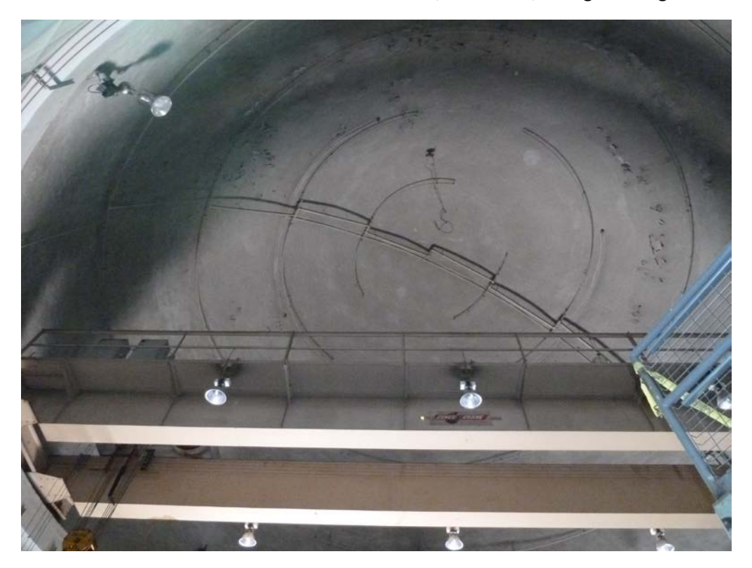
Photo 2. Flaking lead-based paint (LBP) containing polychlorinated biphenyls (PCBs) on the ceiling of the aboveground containment dome.