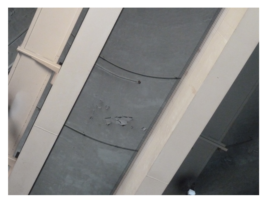
Photo 3. Close-up of flaking LBP containing PCBs on the ceiling of the aboveground containment dome.