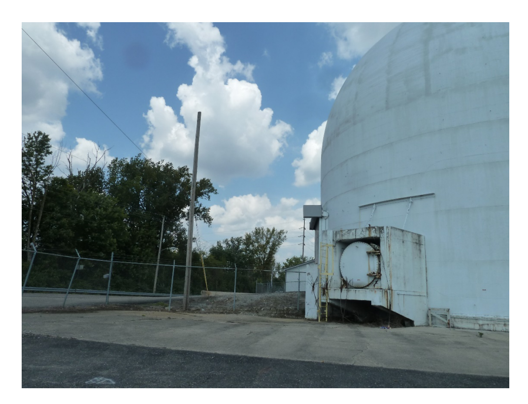
Photo 1. Exterior of aboveground steel containment dome showing barbed wire fence providing security for the site. On other side of containment dome is a secure, motorized, sliding access gate.