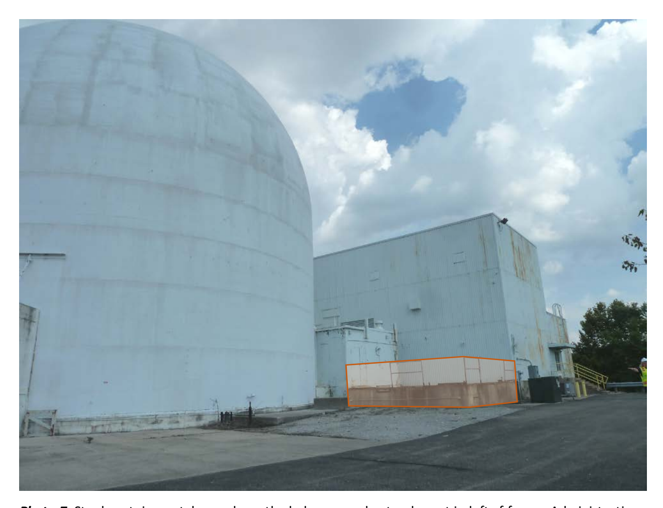
Photo 7. Steel containment dome above the belowground entombment in left of frame. Administration building shown in right of frame. Building between the containment dome and the administration building is an outdoor locker previously used for chemical storage. The concrete pad adjacent to the outdoor locker (indicated with orange outline and tint) may contain PCBs due to previous storage of equipment and fuels.