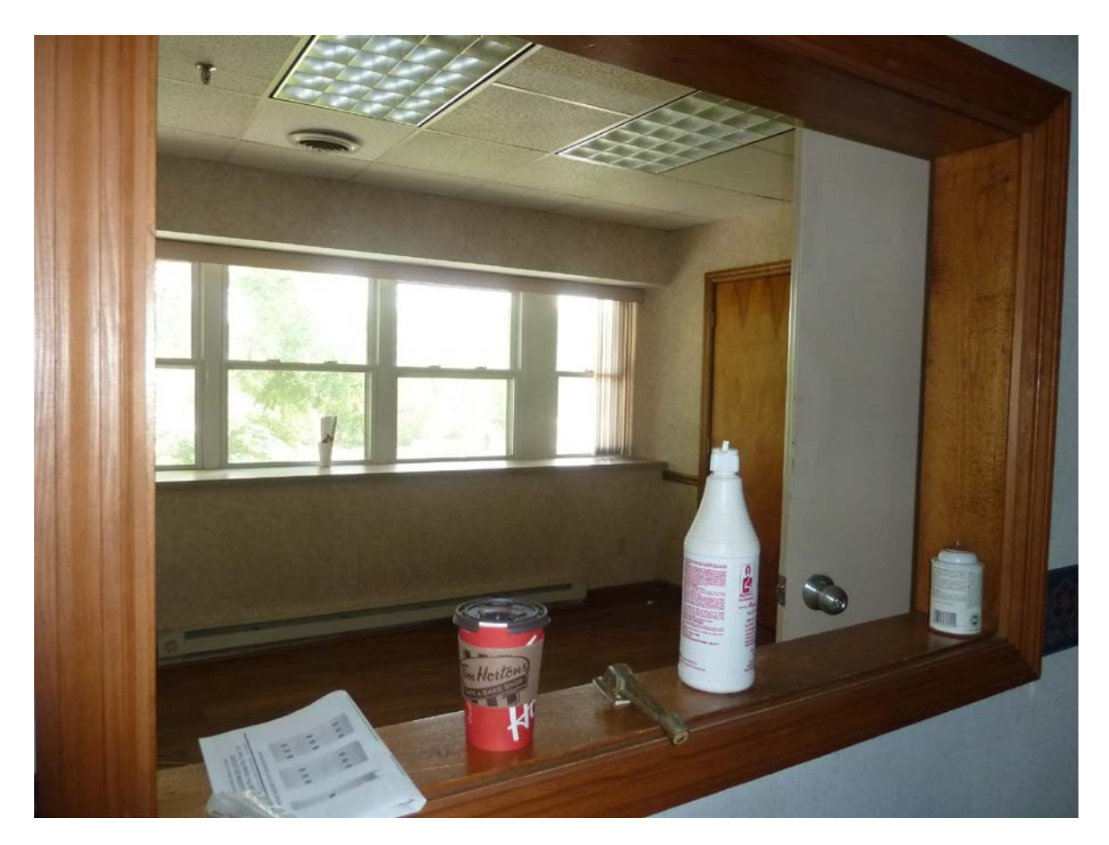
Photo 13. Northernmost office in the administration building. Drywall and wall paneling have LBP. False wood flooring overlies asbestos flooring and therefore will need to be removed during abatement. False walls were constructed to create the three offices. These will need to come out during asbestos abatement, as well, so that the ACM flooring can be accessed.