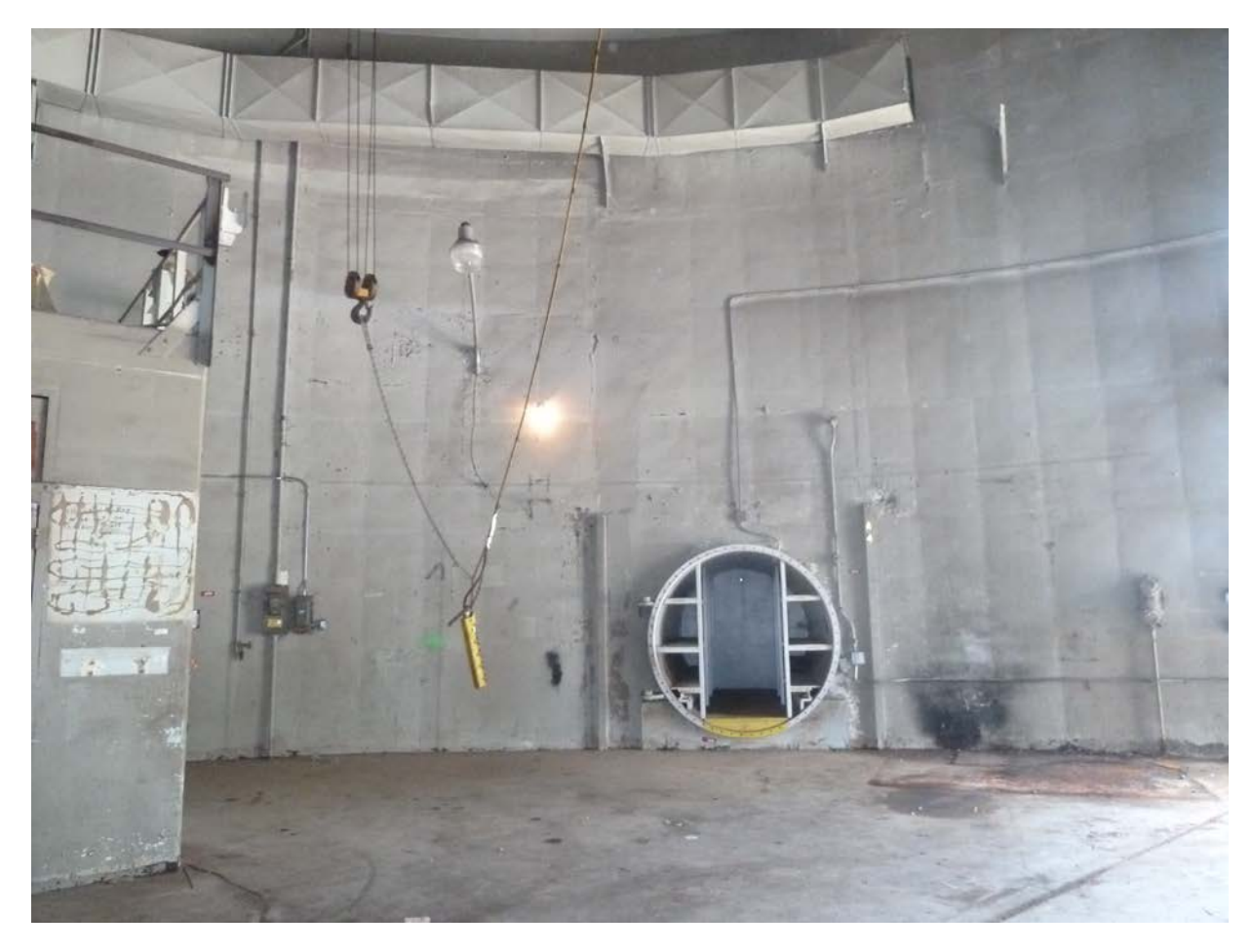
Photo 5. Round air-lock from interior of aboveground containment dome to outdoor locker that leads to administration building.