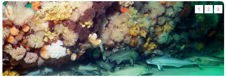
NOAA is committed to improving our understanding and management of human-induced noise and ocean life.