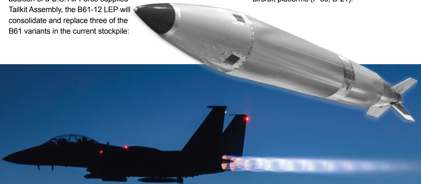
Developmental flight test from an F15-E