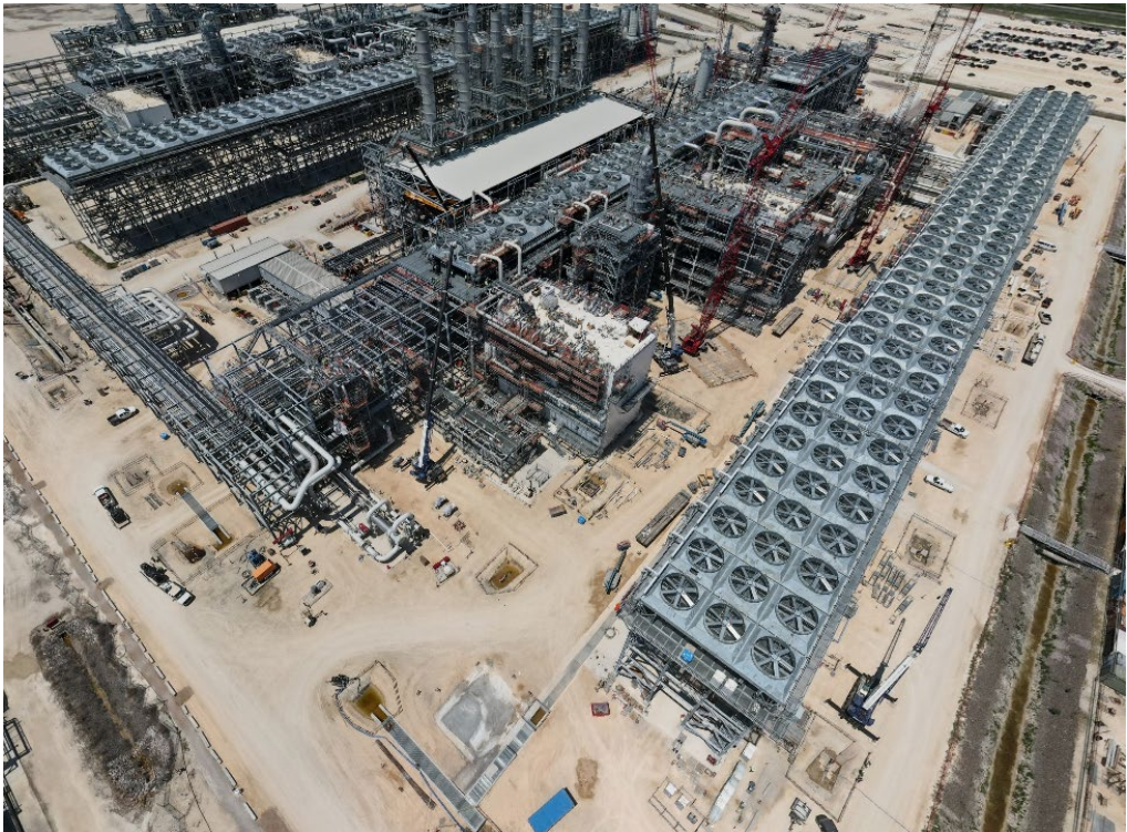
Progress at Train 6 facing Northwest