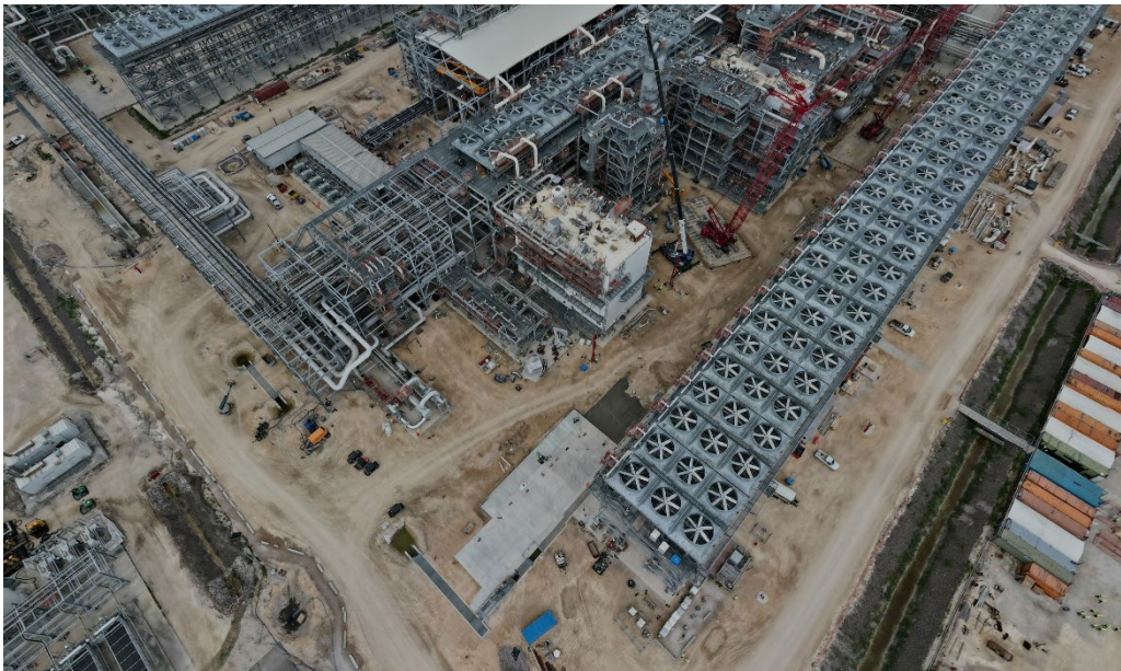
Progress at Train 6 southeast corner