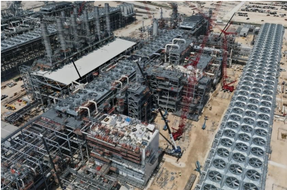
Progress at Train 6 facing North