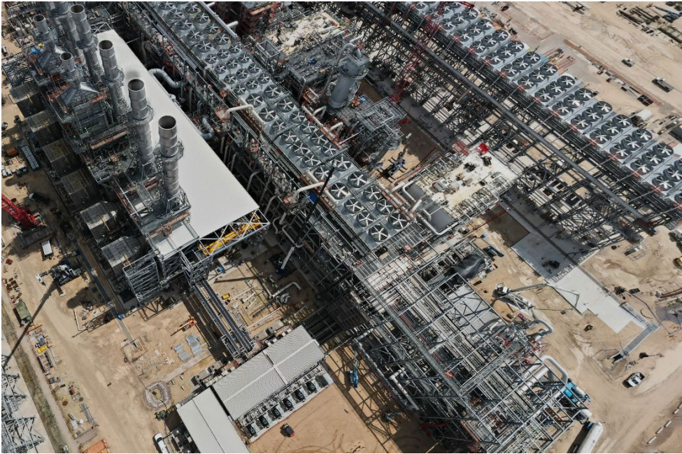
Progress at Train 6 southwest corner