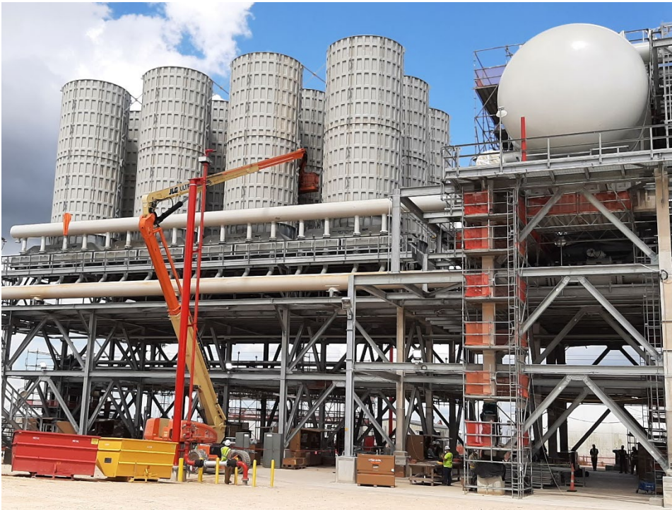
Subcooler Shrouds Installation in Propane Rack