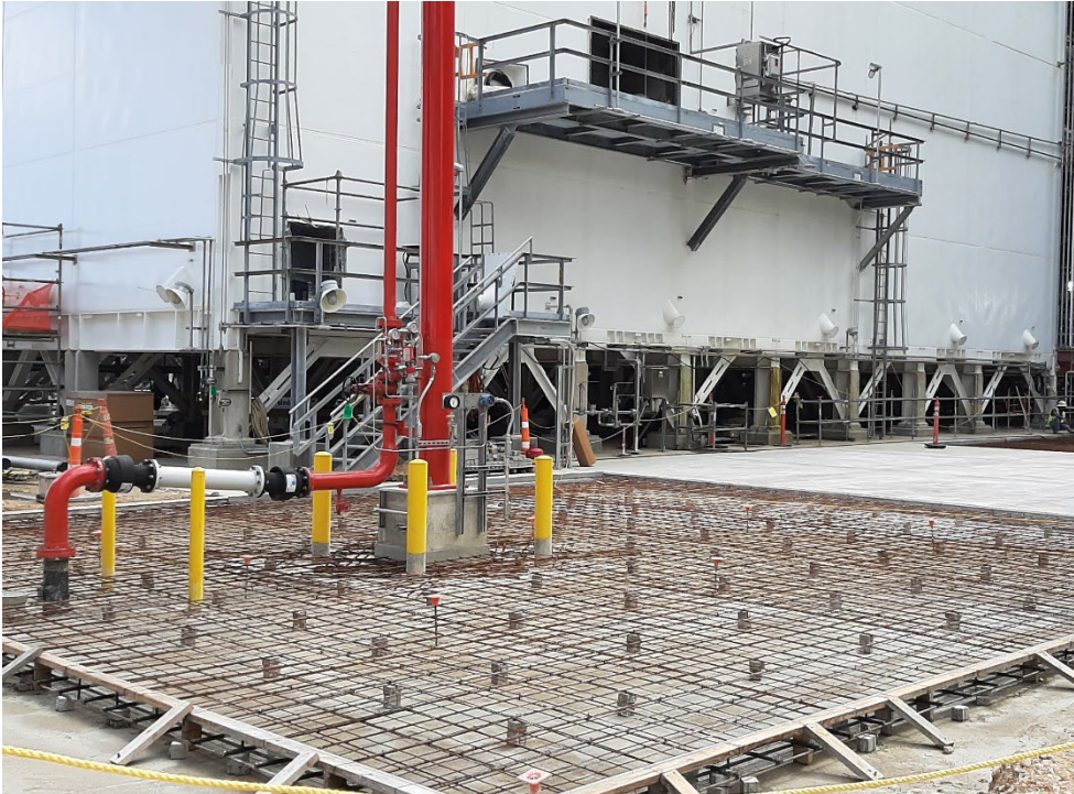
Paving Installation at Cold Box Area