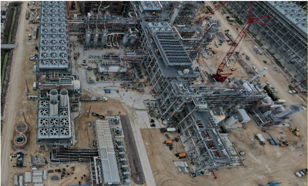
Progress at north side of Train 6 showing subcooler shrouds