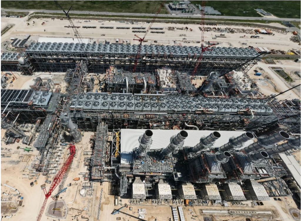
Progress at Train 6 facing East