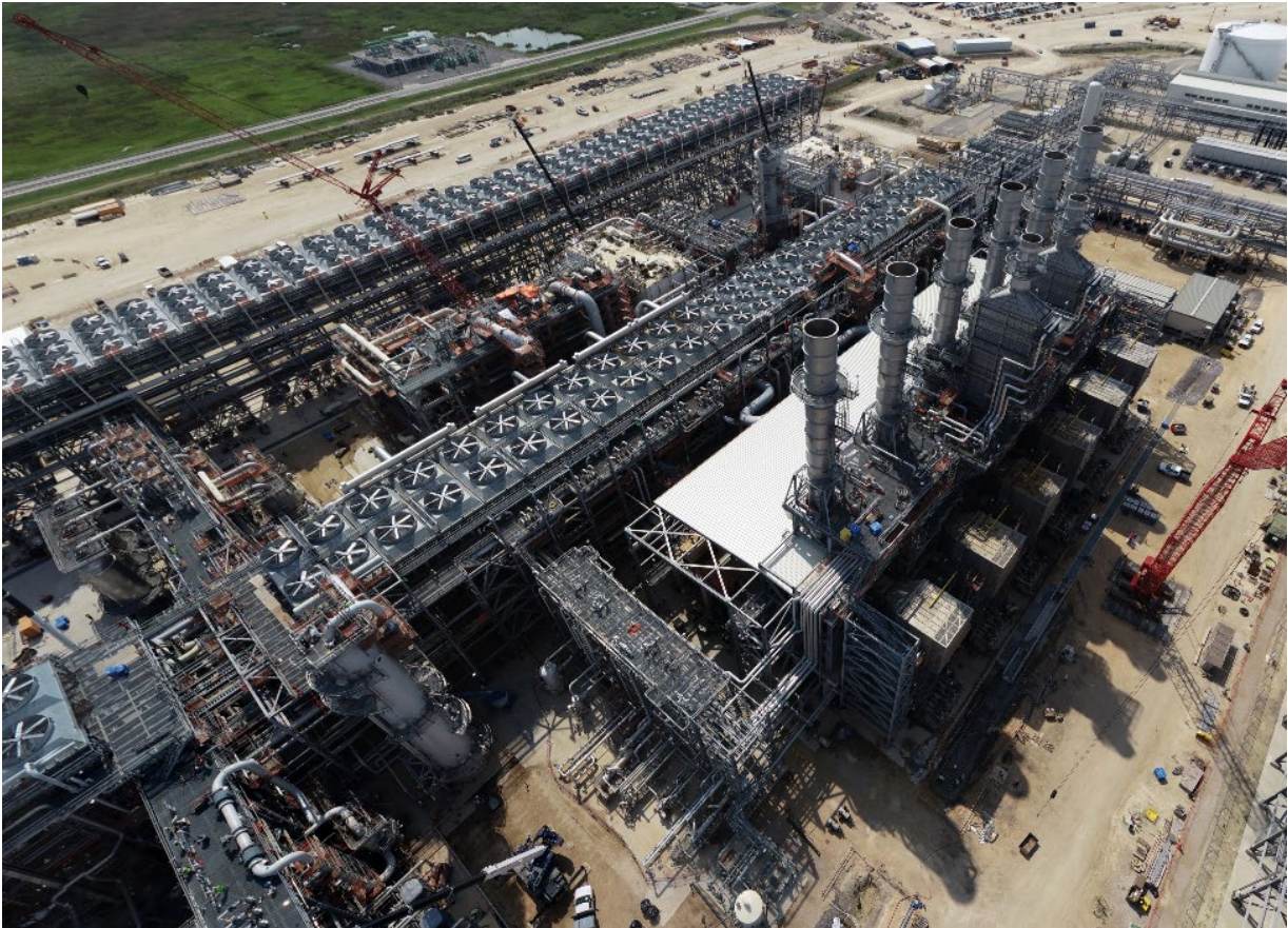
Progress at Train 6