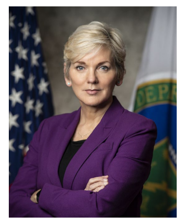
Energy Secretary Granholm

Shortly after taking office, President Biden announced a bold <u>plan</u> to transition the country to a carbon-neutral economy, mitigate climate change and environmental degradation, and improve energy and public health equity. Major goals include decarbonizing the electricity sector by 2035, achieving a carbon-neutral economy by 2050, and rectifying inequities in air and water quality. Supporting actions focus on increasing sustainable and affordable housing, modernizing energy codes, and reducing the carbon footprint of new building construction. A <u>report</u> by the Coalition for Green Capital and Rewiring America shows how these actions could save up to $750 per year for nearly 12 million low- to moderate-income American households and create nearly 700,000 good-paying jobs.