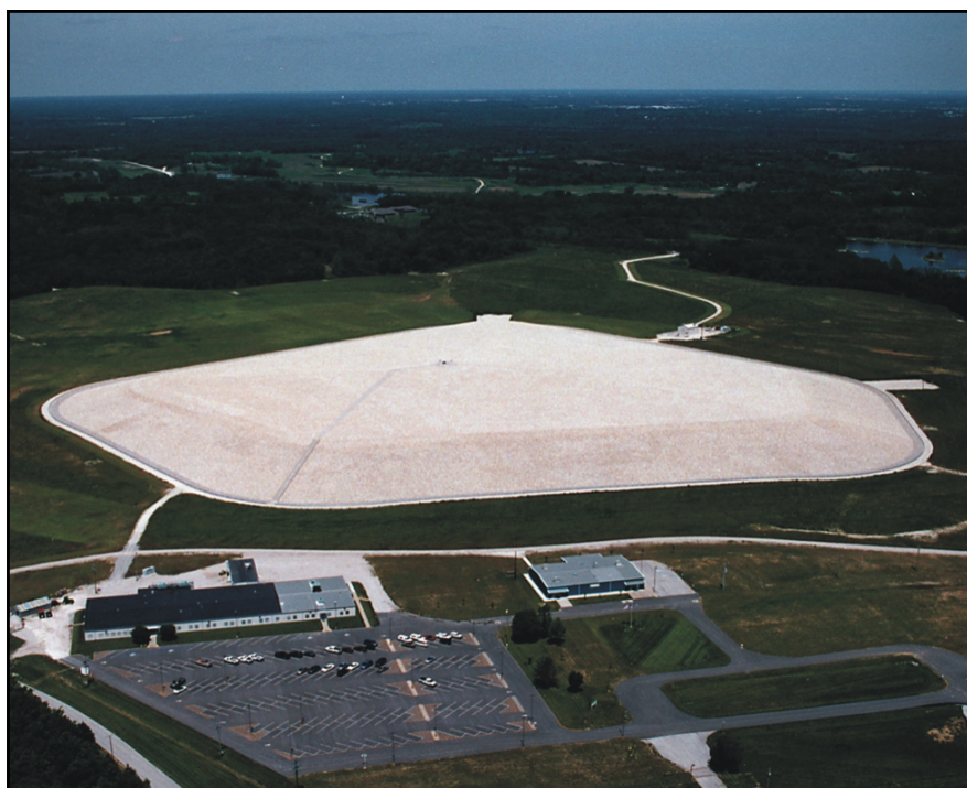
Weldon Spring Disposal Cell circa 2002.

The current, 228.16-acre Weldon Spring site (former 219.5-acre Chemical Plant property and 8.66-acre Quarry) is open to the public. Cleanup and ecological restoration has made the Weldon Spring site home to a thriving community of prairie plants and wildlife in the planted, 150-acre Howell Prairie.