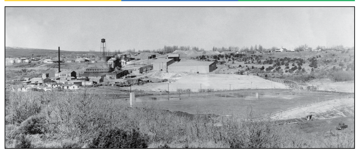
Mill Site Before Remediation.

In 1983, remedial activities for tailings-contaminated, private and publicly owned properties in and surrounding the city of Monticello—known as vicinity properties—were separated from MRAP upon establishment of the Monticello Vicinity Properties (MVP) project. Remaining MRAP properties (mill site and those adjacent to, and downstream of, the mill site) were designated as the Monticello Mill Tailings Site (MMTS) project.