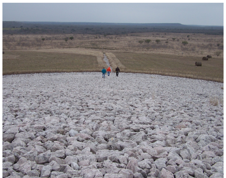
View From the Top of the Falls City, Texas, Disposal Cell.

A rock apron surrounds the base of the disposal cell on all sides. The apron is from six to 10 feet deep and extends 29 feet beyond the toe of the side slopes. The cell was designed to promote the rapid runoff of precipitation to the apron to minimize infiltration. A barbed-wire fence encloses the site.