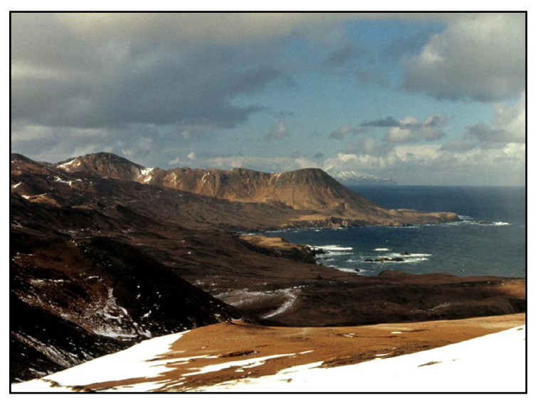
Amchitka Island; View From the East End Looking North.

Drilling at the three nuclear test sites and the three emplacement/exploratory locations used large quantities of drilling mud, which consisted of water, diesel fuel, and other additives, including bentonite, chrome lignosulfonate, chrome lignite, cement, paper, and sodium bicarbonate. The drilling mud pits were left in place when AEC completed the tests and remained open until DOE began reclamation work in 2001. Chemical analysis of mud pit samples collected during a 1998