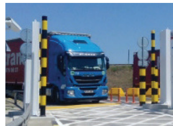
Radiation portal monitors conduct 24-hour screening at points-of-entry

NNSA works with over 100 partners worldwide to secure nuclear and radioactive material and to detect and deter trafficking of this material. This mission includes: international nuclear security; radiological security; and nuclear smuggling, detection, and deterrence.