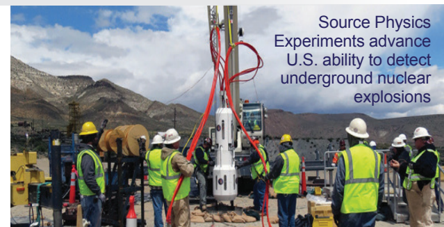
Source Physics Experiments advance U.S. ability to detect underground nuclear explosions

NNSA drives innovative research that develops technologies and expertise to detect foreign nuclear proliferation activities and produces operational proliferation detection capabilities, leveraging technical expertise at the national laboratories, plants, and sites, as well as at universities and within private industry.