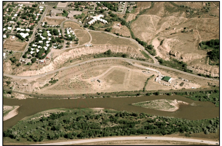
Old Rifle Processing Site in 1957 (above) and 2008 (below).