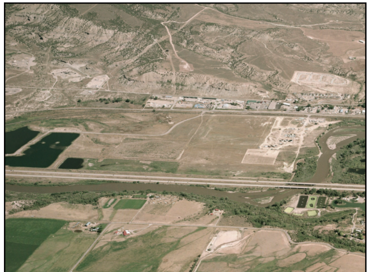
New Rifle Processing Site in 1974 (above) and 2008 (below).