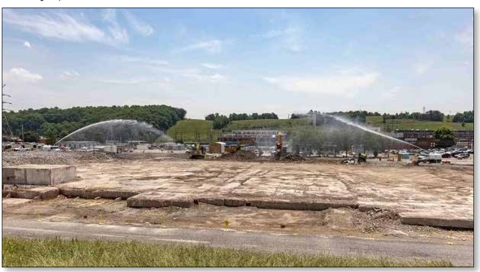
Crews have completed demolition on the last of 11 structures that comprised the former Biology Complex. Its removal enhances safety at the site and clears land for the National Nuclear Security Administration to reuse for current security missions.

EM is working to remove the buildings' foundations, which is slated for completion this fall. That marks the final step before the land is available for reuse by NNSA.