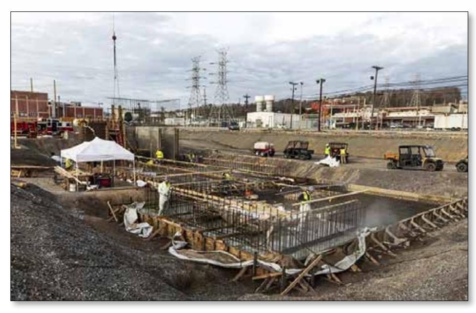
Workers continued construction on the Outfall 200 Mercury Treatment Facility in 2020. Completion of MTF is a key part of EM's vision for the program's next decade.

Completing legacy cleanup activities at the Nevada National Security Site, the Uranium Mill Tailings