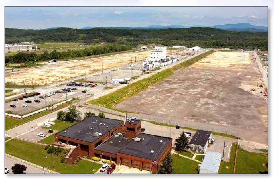
An aerial view of the K-25 footprint. This property comprises much of the Main Plant Area groundwater remediation zone at ETTP.

"We've done a very thorough characterization of the groundwater out there," he said. "We've analyzed for every chemical and radiological