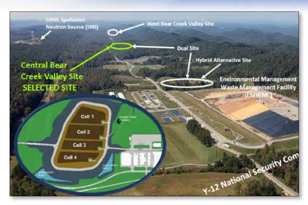
OREM considered several sites for the proposed new disposal facility.

For the large buildings at Y-12, it will take a number of years to do the characterization and to clean out those buildings to get them ready for demolition. OREM typically removes areas of higher contamination first before dealing with items that would go in an on-site facility. However, there would ideally be at least two years of overlap in the closure of EMWMF and opening of EMDF, he added. That would, among other things, allow OREM to respond quickly if Congress allocated additional funds to Oak Ridge