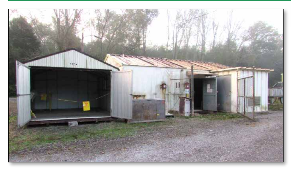
The Tritium Target Preparation Facility at Oak Ridge National Laboratory prior to demolition. The building was constructed in 1968 and had not operated since 1990.