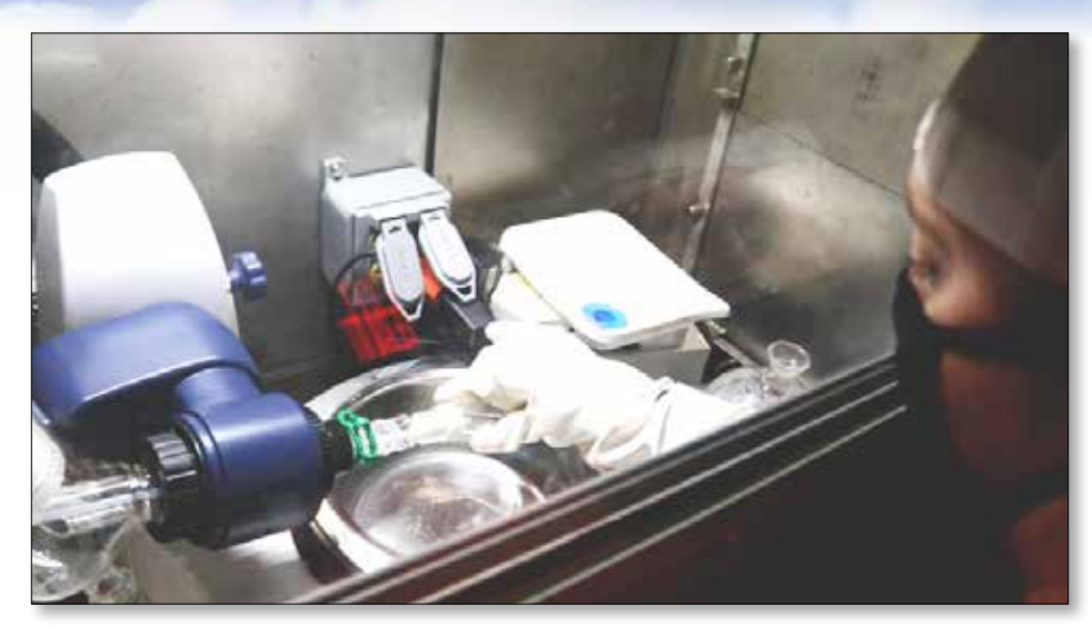
An operations technician removes a tube of thorium-229. Under a newly expanded agreement, EM contractor Isotek will further refine the thorium to provide TerraPower an enhanced purified product to generate Actinium-225 for cancer research and treatment.

The work will provide TerraPower with medical isotopes with higher purity for next-generation cancer research and treatment. Isotek will further refine the thorium before TerraPower transports the material to its research facility. Isotek will receive additional funds that can be invested back into the project.