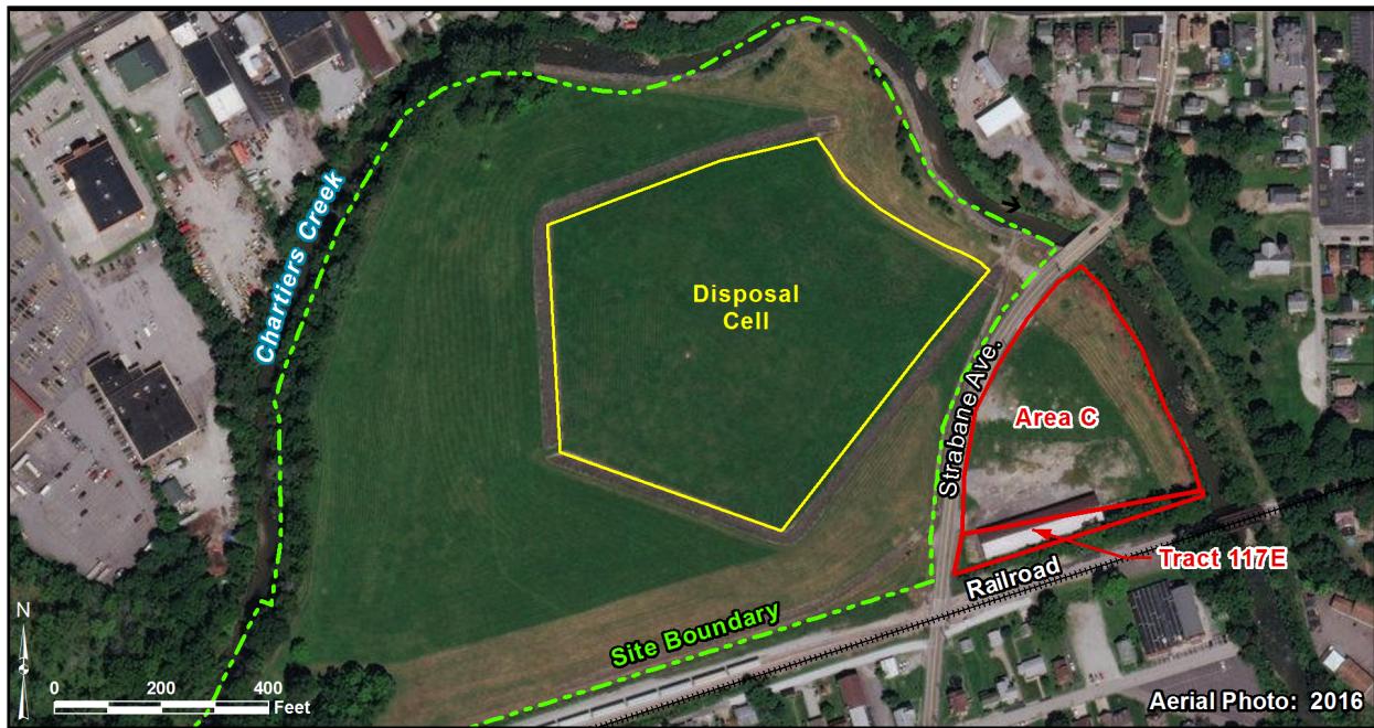
Boundaries of the Canonsburg Site and Area C.

Processing of radioactive materials at the Canonsburg site since the early 1900s resulted in contamination of groundwater in the uppermost aquifer beneath the main site and beneath a 3-acre area known as Area C east of the main site. Constituents of concern in groundwater are manganese, molybdenum, and uranium. A number of other constituents in groundwater samples have at times been identified in concentrations above maximum concentration limits in 40 CFR 192 or other benchmark concentrations since monitoring activities began. Distribution of contaminants in the unconsolidated materials is sporadic, and no well-defined contaminant plumes are apparent. Manganese concentrations are elevated in background groundwater samples because of regional activities not associated with processing of radioactive materials at the Canonsburg site. Uranium is the only constituent that is present at concentrations in groundwater samples above the 40 CFR 192 standard and that can clearly be attributed to site activities. In recent years, uranium concentrations in groundwater samples collected beneath Area C are less than the standard.