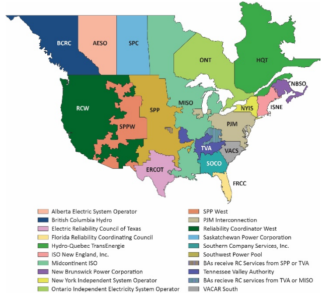
Figure 2: NERC reliability coordinators, December 2019

A consequence of these events for transmission operations was the passage of the Energy Policy Act of 2005 and NERC taking on a new role as the Electric Reliability Organization with the authority to require compliance with evolving NERC Reliability Standards. This change resulted in increased responsibility and authority for NERC reliability coordinators (RCs, which had been known before 2001 as "security coordinators"). As noted in NERC IRO-001.1.1, "Reliability Coordinators must have the authority, plans and agreements in place to immediately direct reliability entities within the Reliability Coordinator Areas to re-dispatch generation, reconfigure transmission, or reduce load to mitigate critical conditions to return the system to a reliable state." Figure 2 [22] shows a map of current RCs. When we compare Figures 1 and 2, it is clear that most RTOs are also the RCs for their respective areas.