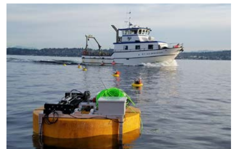
Back page photo of a mini wave energy converter test.

WPTO's Marine Energy e-newsletter shares news and updates on tools, analysis, and emerging technologies to advance marine energy. bit.ly/MarineEnergyNewsletter ■