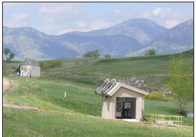
When the East Trenches Plume Treatment System was turned on in 2016, it was the only known solar powered commercial air stripper in use in the United States at the Rocky Flats Site in Colorado.