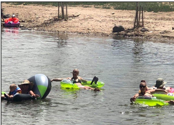
People enjoy water features created at the River Park at Las Colonias, location of the former Grand Junction, Colorado, Processing Site.

LM's conservation reuse includes activities supporting natural resource protection, habitat development and enhancement, and wildlife management options at LM sites. Conservation reuse includes areas where a proactive measure has been