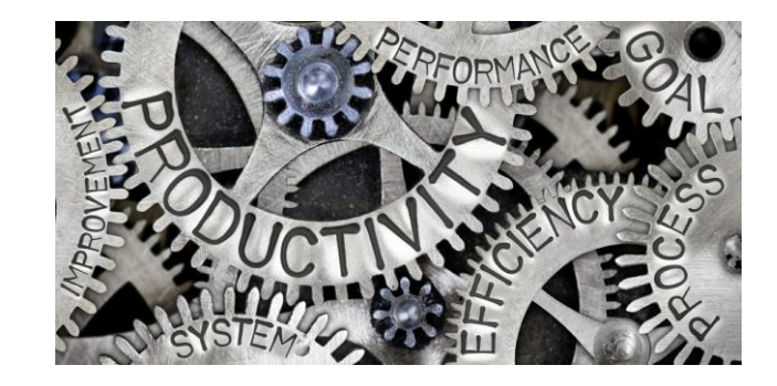
"There is no pain in change itself, there is only pain in resistance to change."