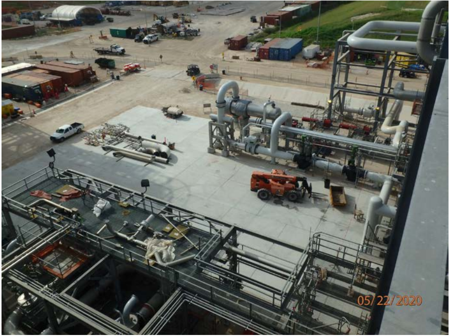
Inlet gas area progress overview