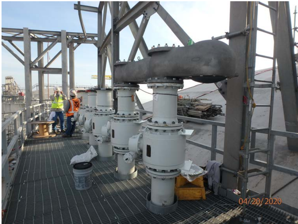
LNG Tank B – Vacuum breaker installed