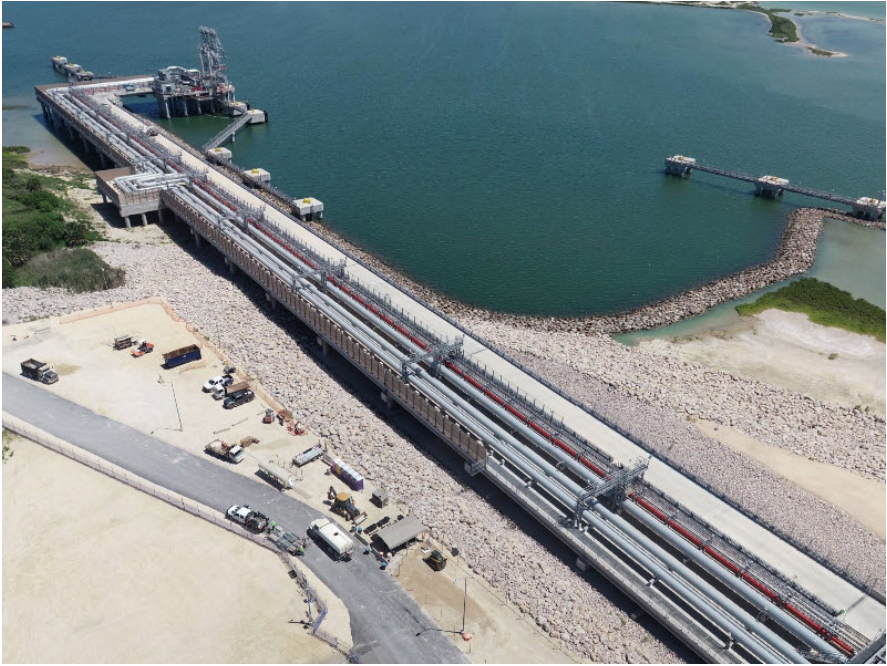
East Jetty progress overview