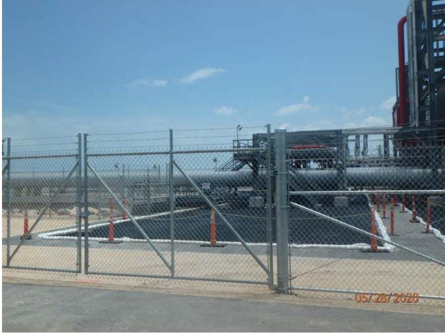
East Jetty – fence gate and area tacked for asphalt