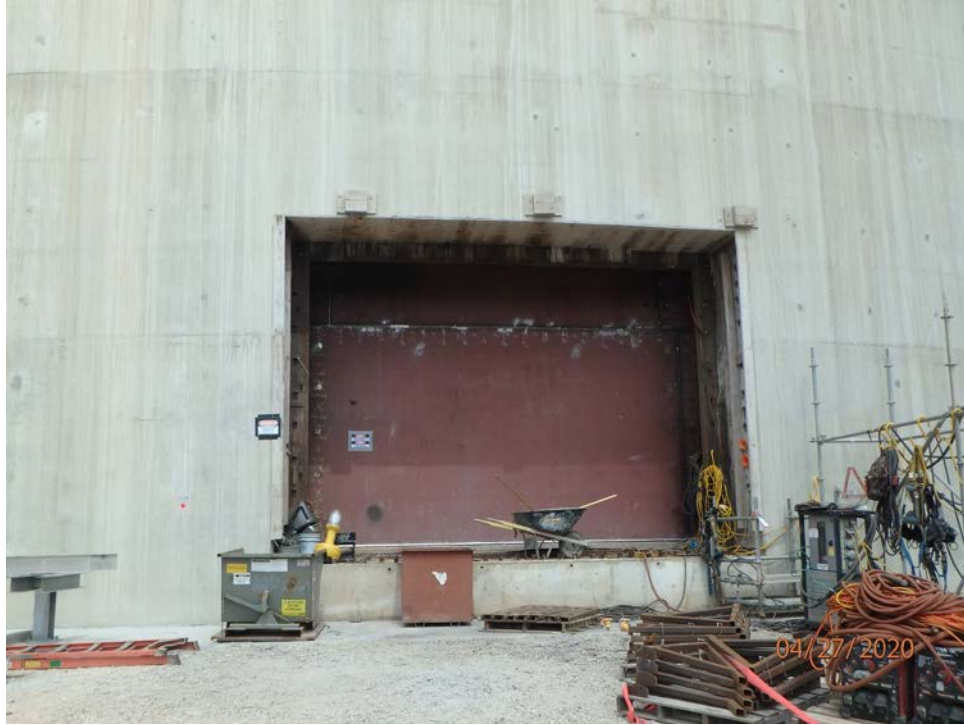
LNG Tank B - East door sheet closed