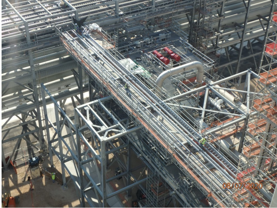
Jump over piping installation in progress