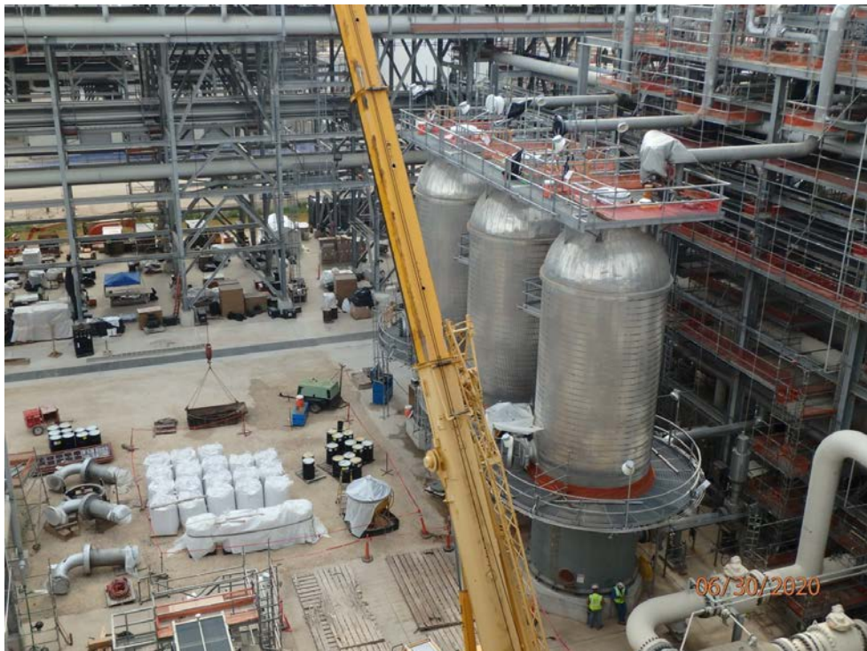
Loading internals in Molsieve Dehydrators