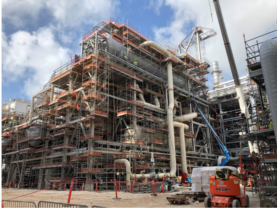
Propane refrigeration area progress overview