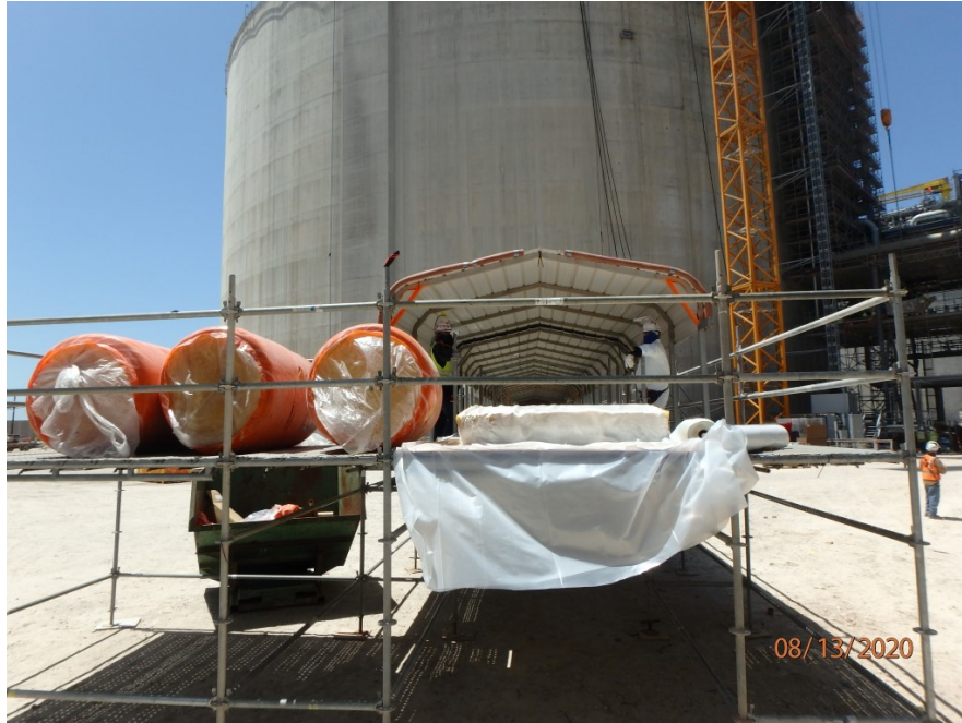
LNG Tank B – resilient blanket installation