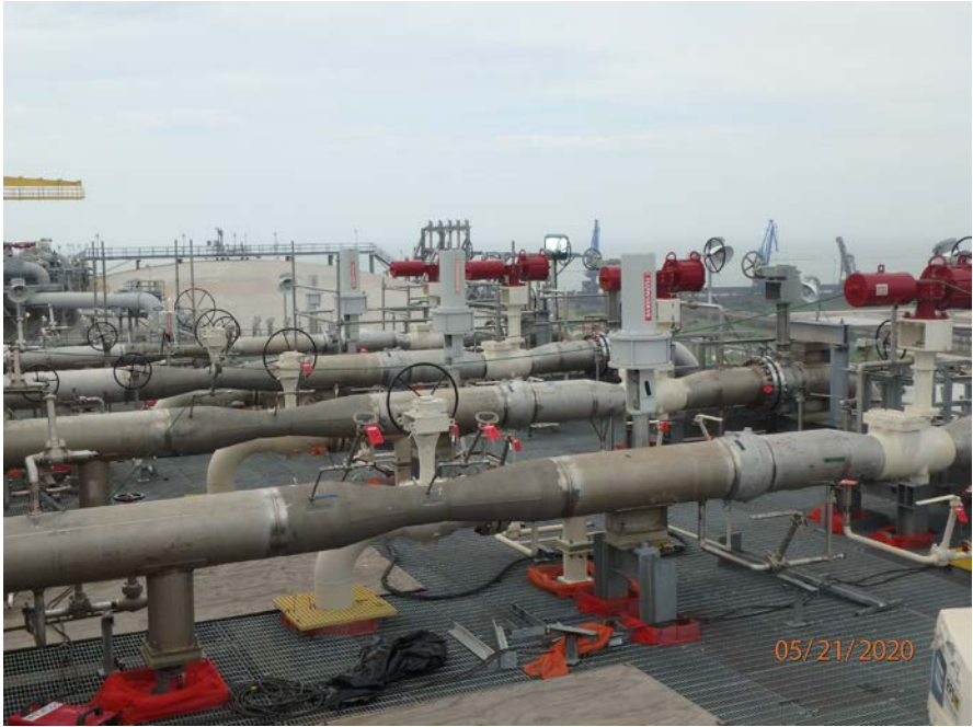
LNG Tank B – overview piping progress atop tank