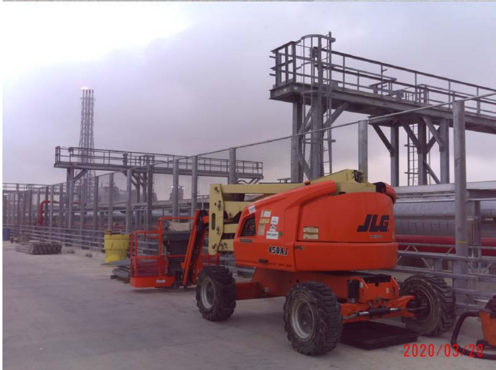
East Jetty – security fence installation in progress