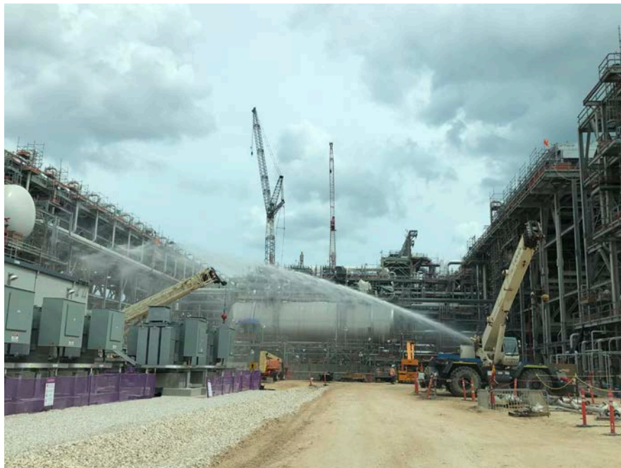
Firewater system spray pattern test