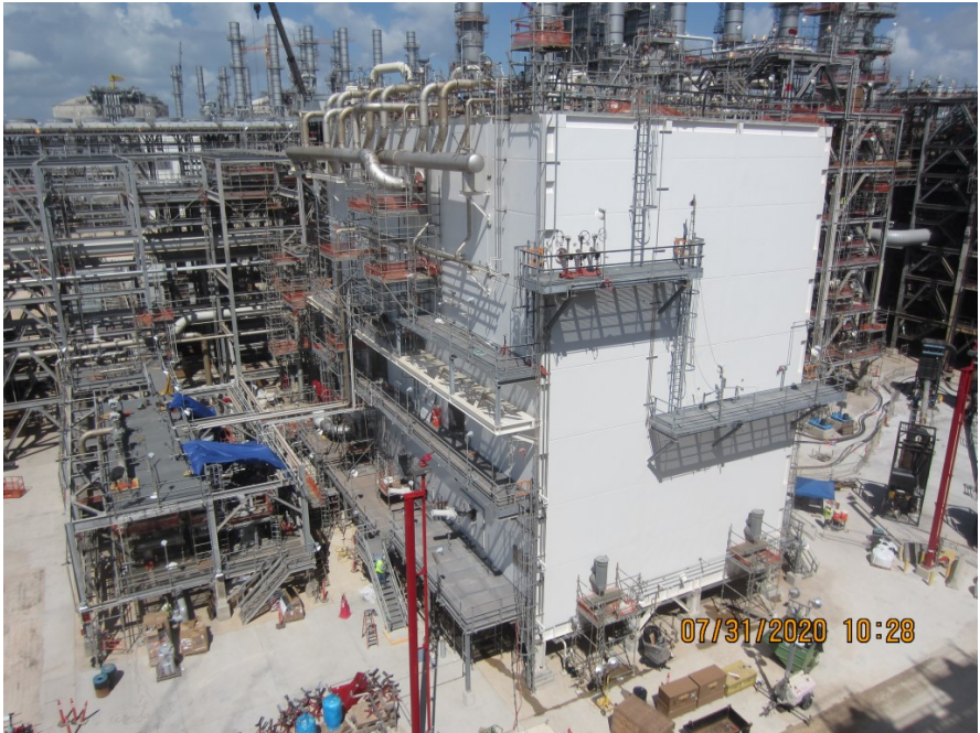
Methane cold box progress overview