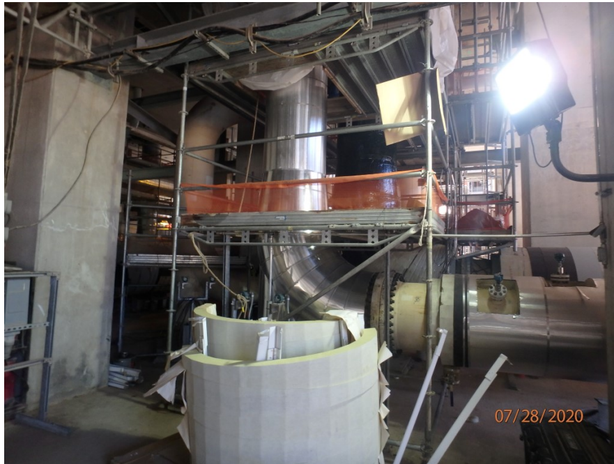
Piping insulation under compressor deck