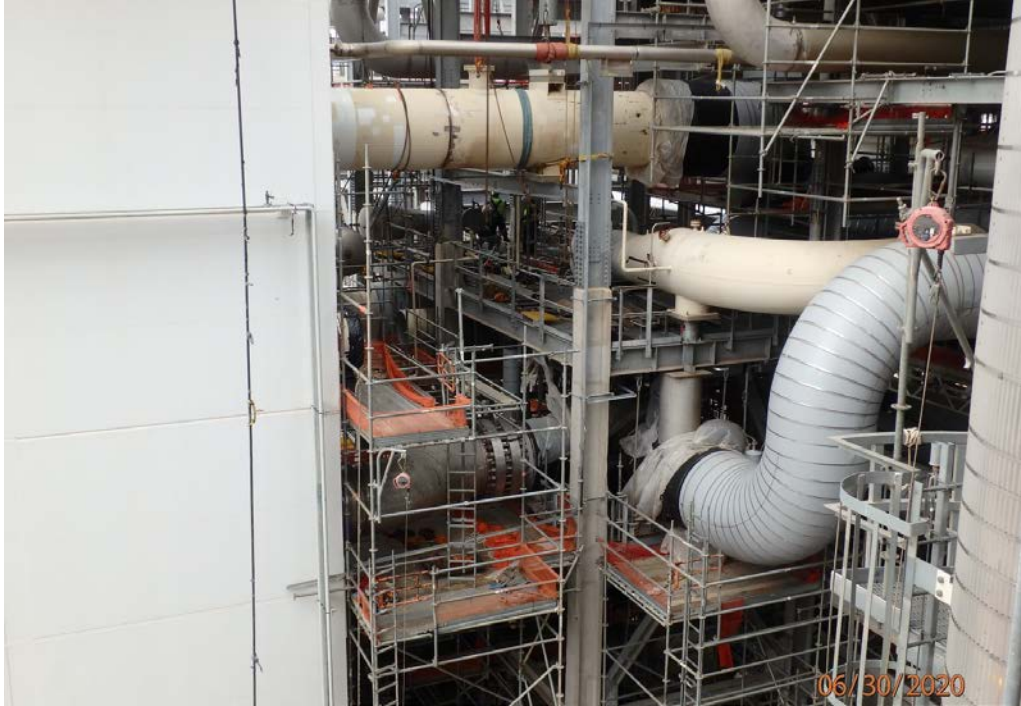
Methane cold box piping tie-in progress