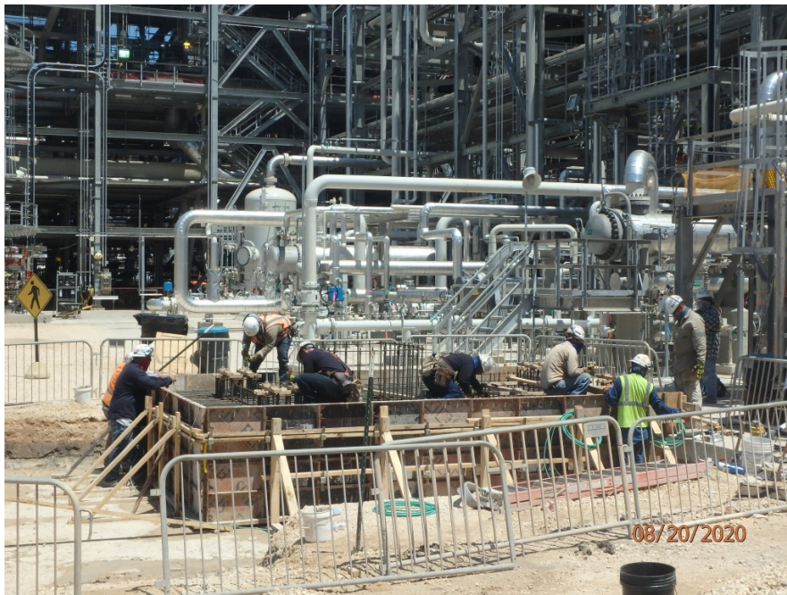
Foundation for RO sump in progress