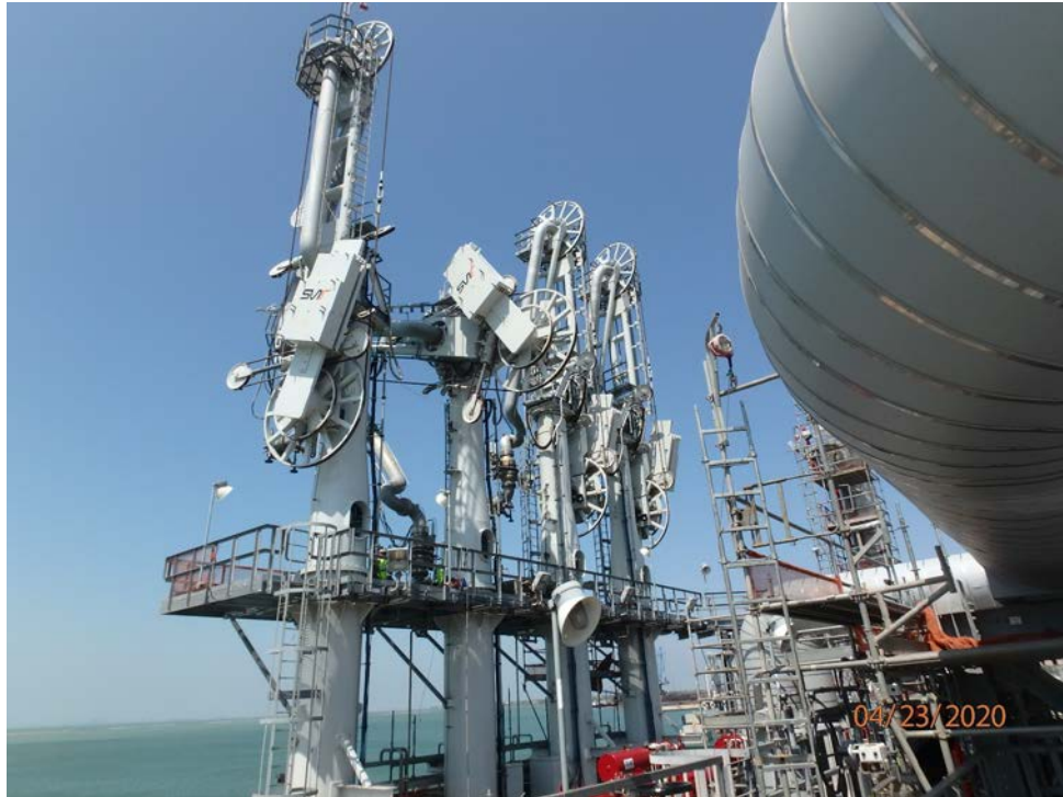
Loading arms pre-commissioning