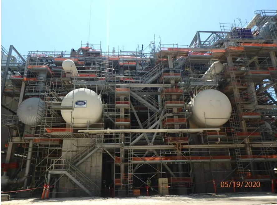
Equipment insulation in progress for propane chiller