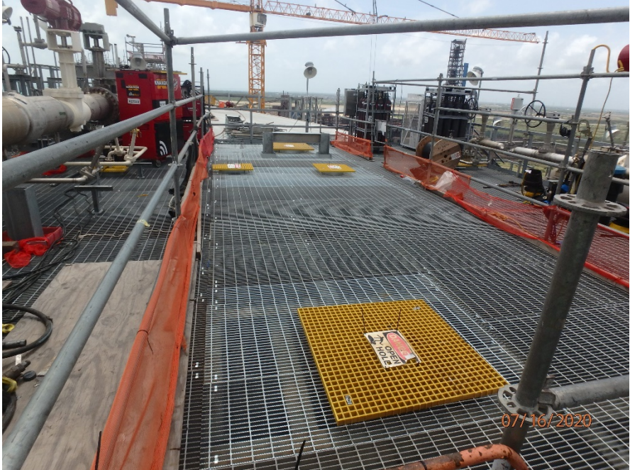
LNG Tank B - Steel modifications for fifth in-tank pump