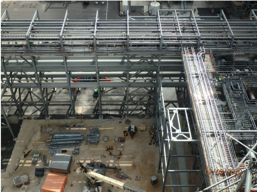
Cable pulling from OSBL to LNG Tank B