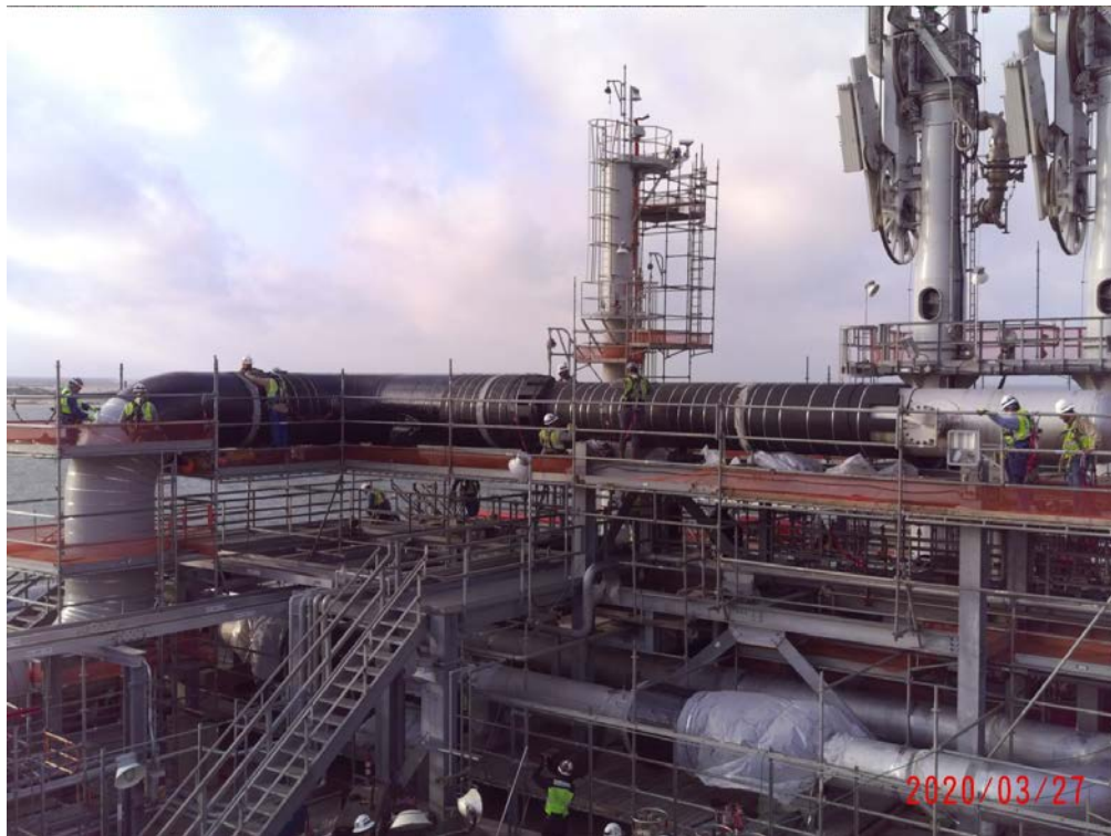
East Jetty piping insulation in progress