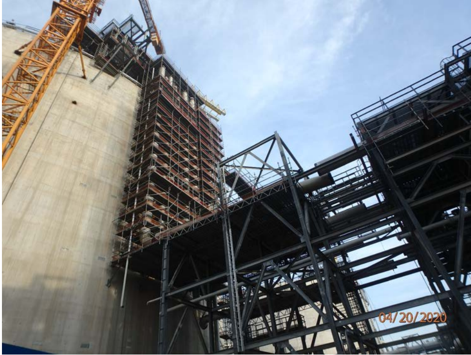
OSBL finger rack piping and LNG Tank B waterfall piping progress