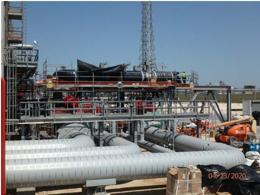
Overall insulation progress