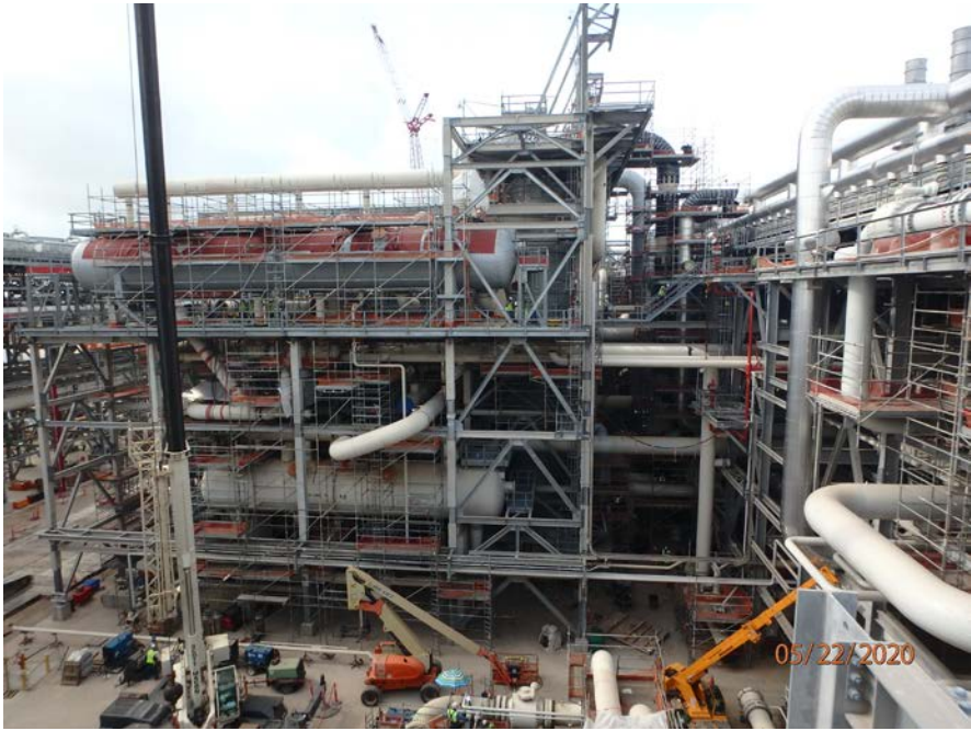
Propane refrigeration area progress overview