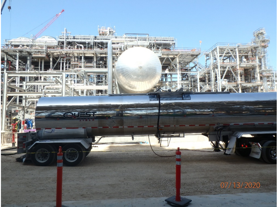
Loading therminol 55 into hot oil system