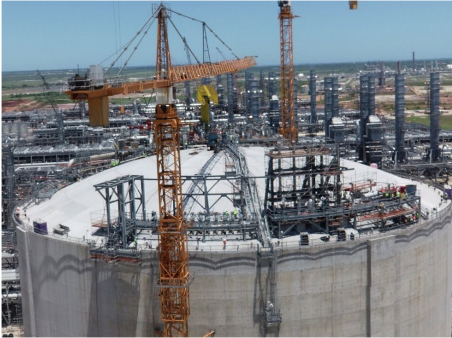
LNG Tank B – overview progress PSV platform