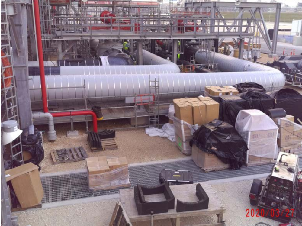
East Jetty piping insulation in progress