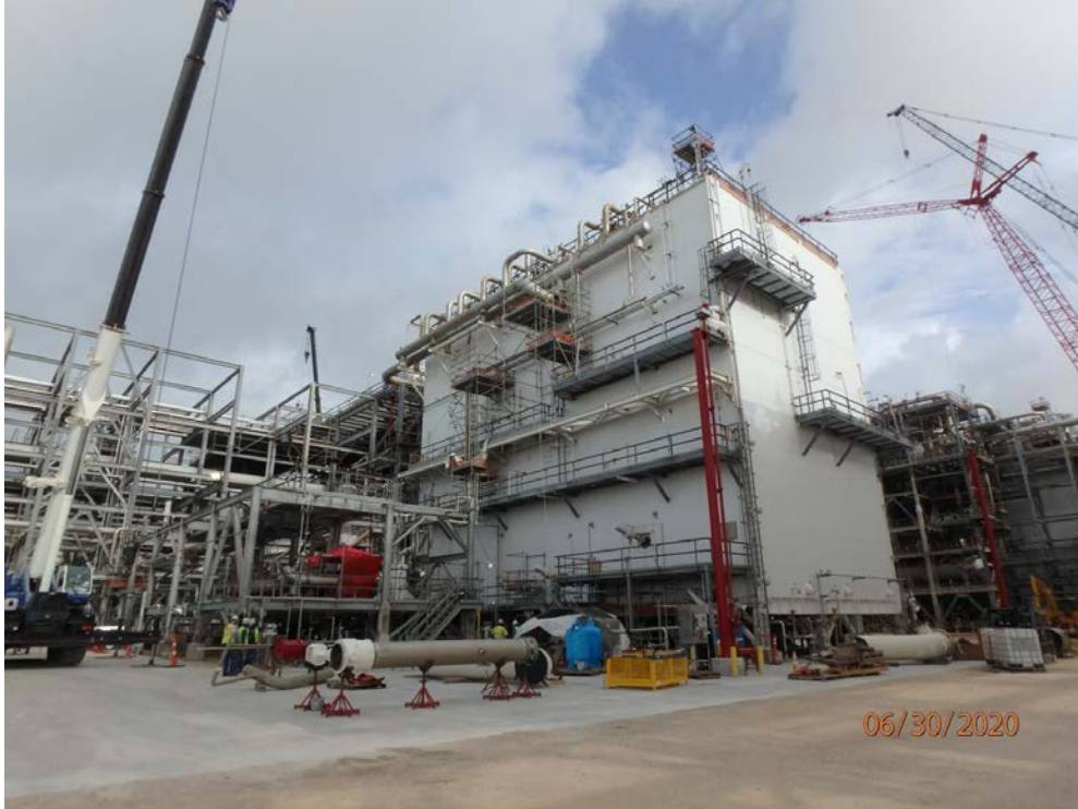
Methane cold box area progress overview