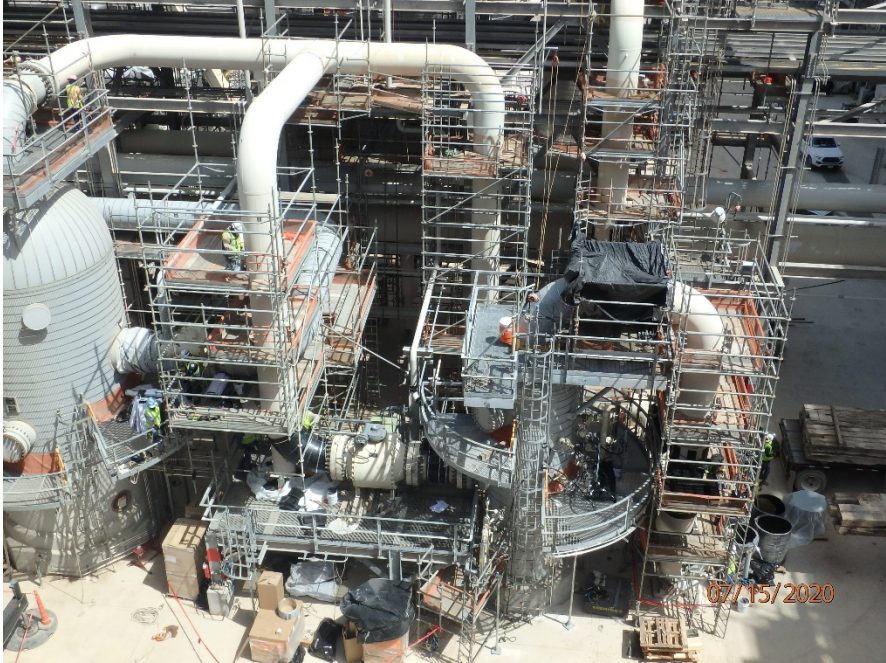
Piping insulation at Dryer feed KO drum