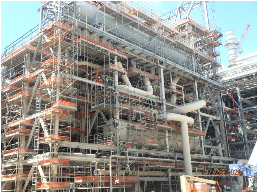
Propane refrigeration area progress overview