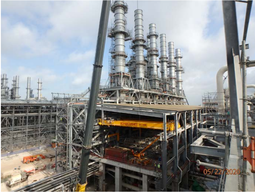
Bridge crane commissioning