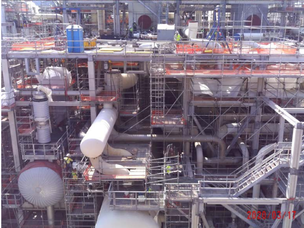
Train 3 - Overall progress at propane refrigeration area