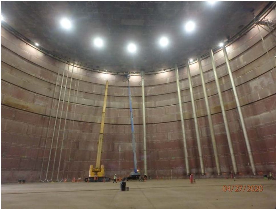
LNG Tank B – Pump tubes welded out