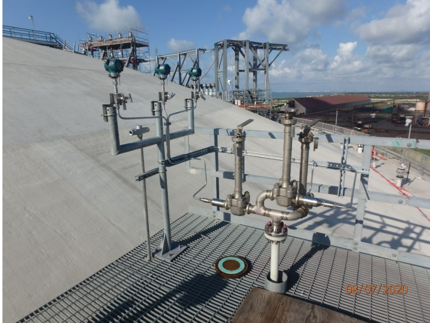
LNG Tank B – instrument installation in progress