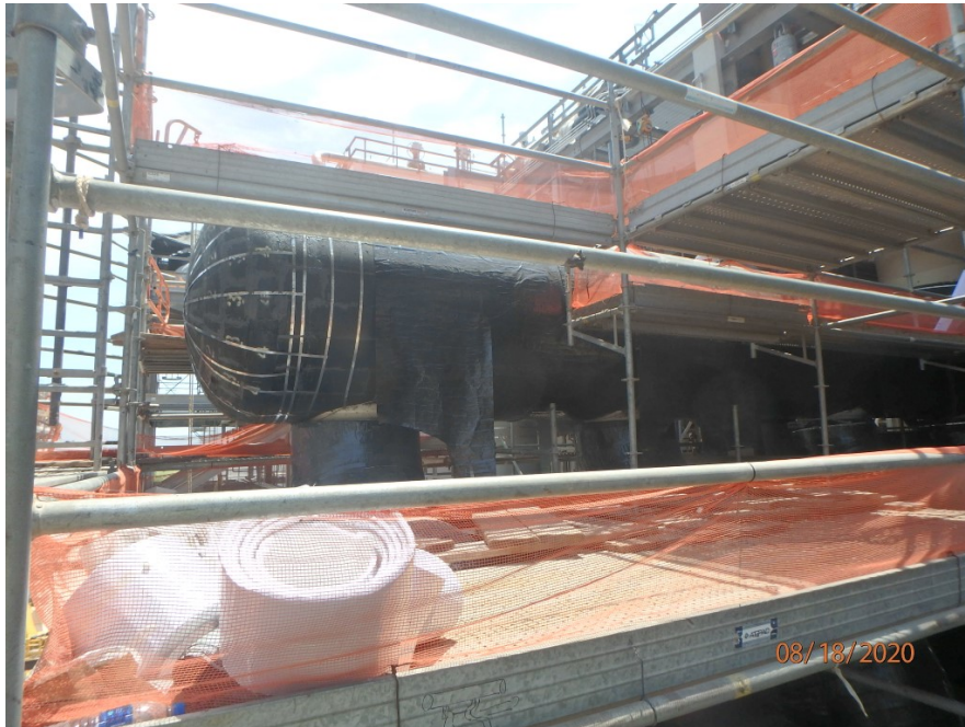
Chiller equipment insulation in progress