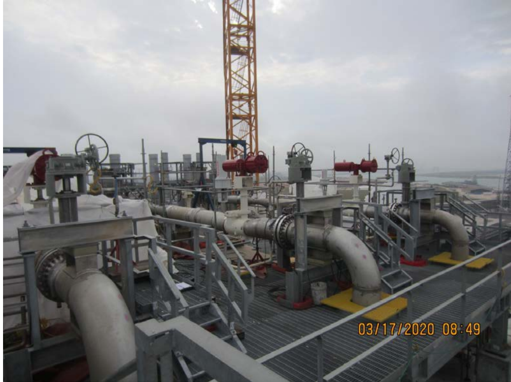
LNG Tank B - Piping progress on top of the tank