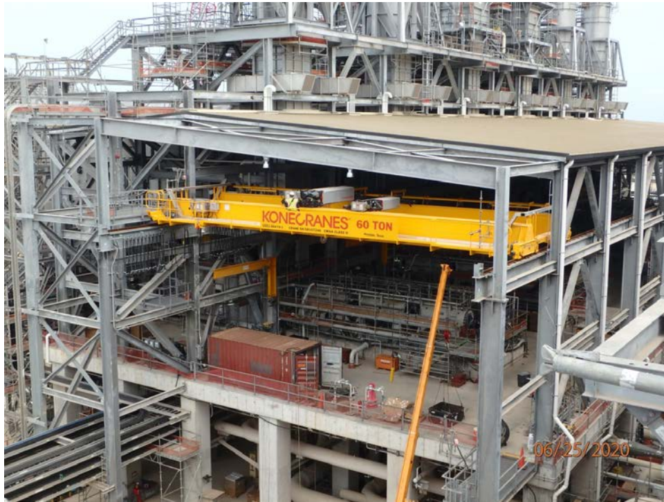
Bridge cranes at compressor deck