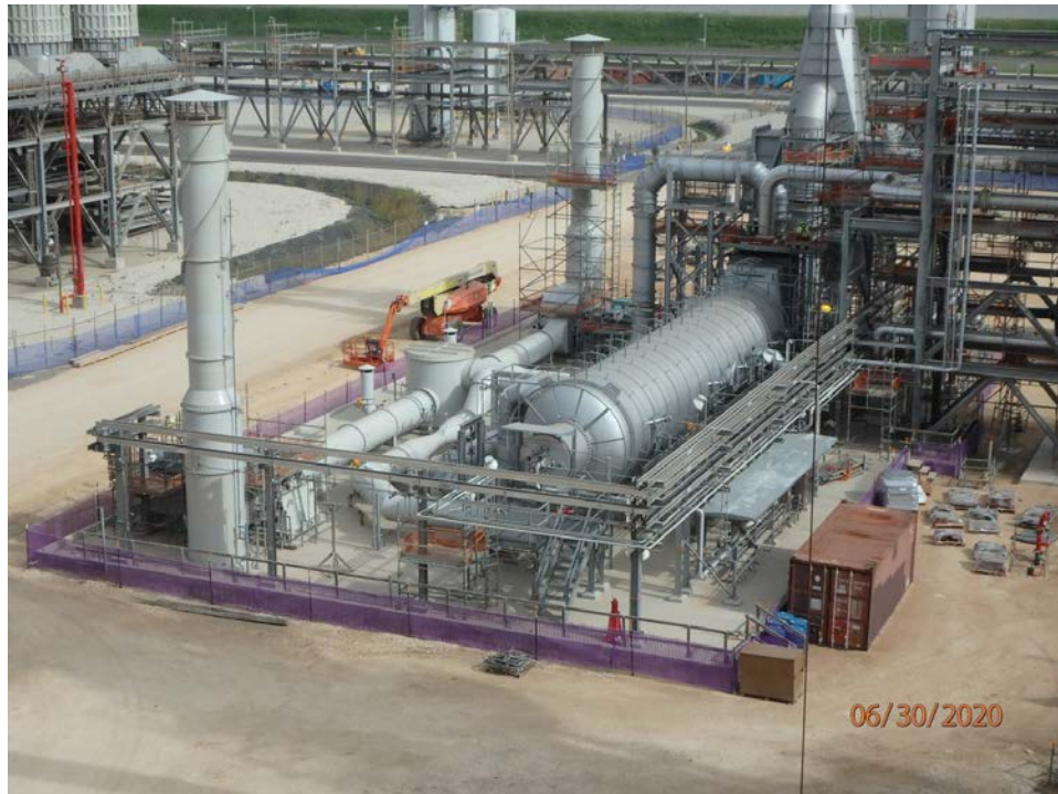
Thermal oxidizer area progress overview