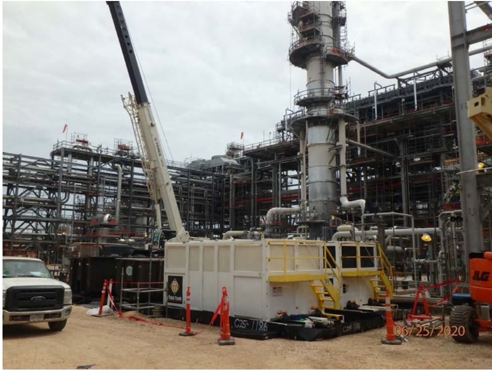
Setup for Amine system chemical cleaning