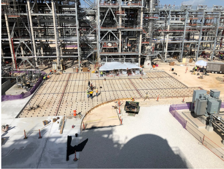
Area paving in progress