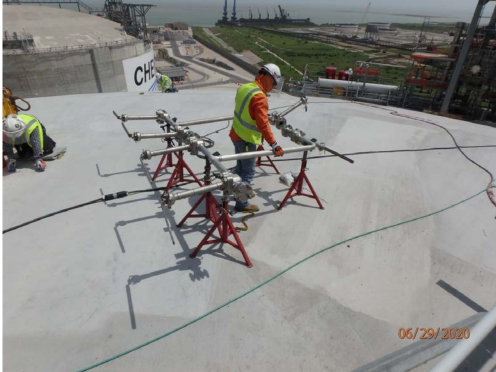
LNG Tank B – Utility piping fabrication