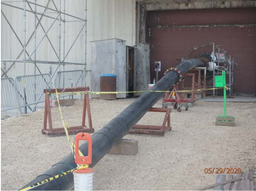
LNG Tank B – commenced hydrostatic test