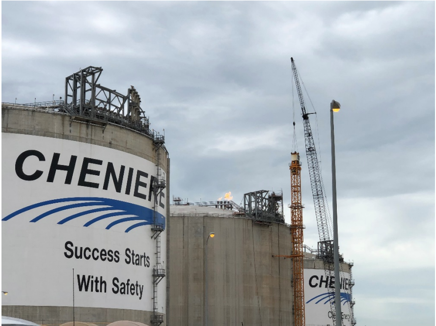
LNG Tank B - dismantling of west tower crane