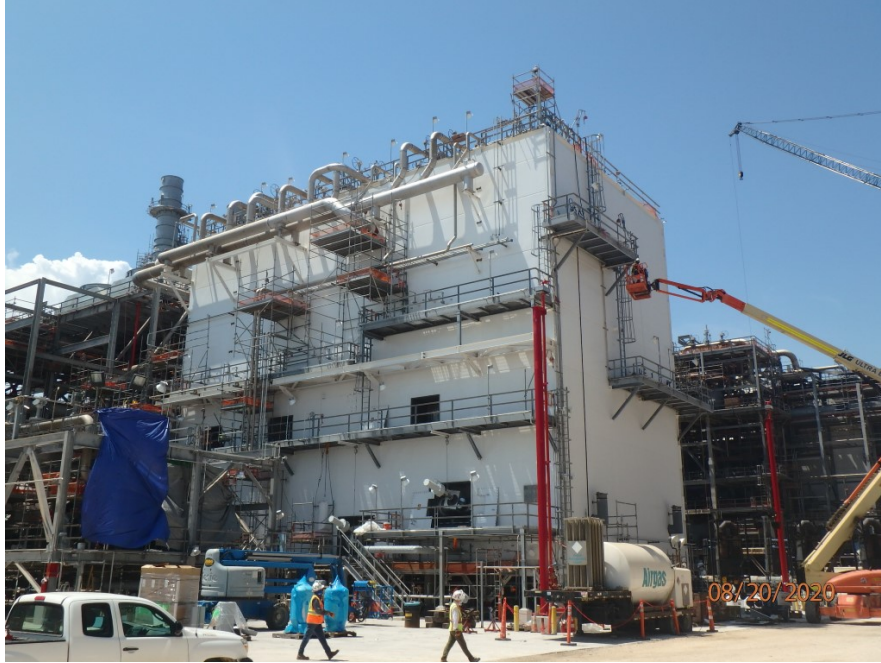
Methane cold box progress overview