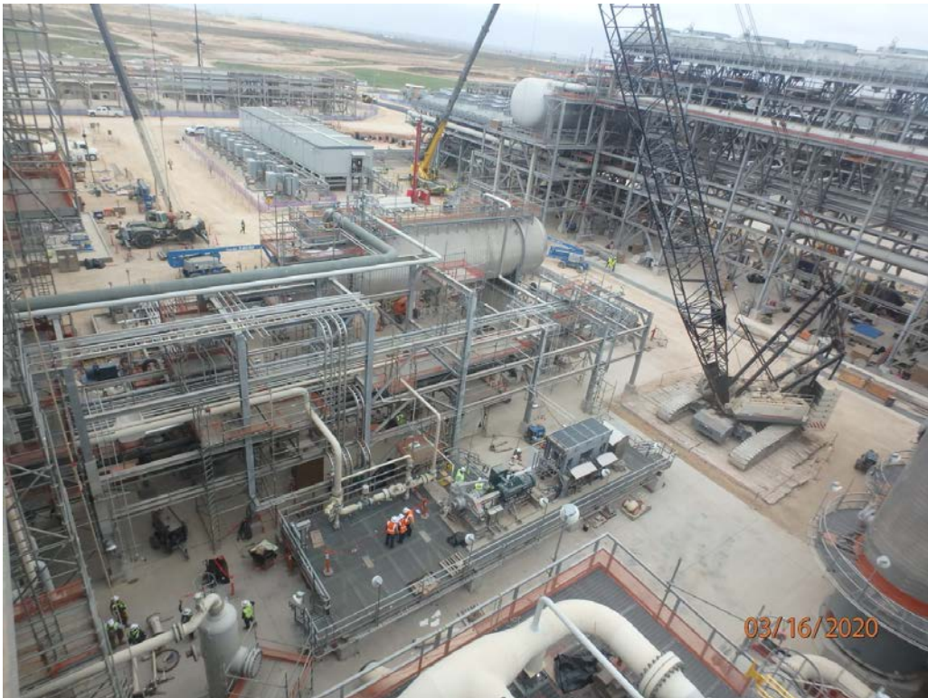
Train3 - Overview progress at Regen gas compressor area