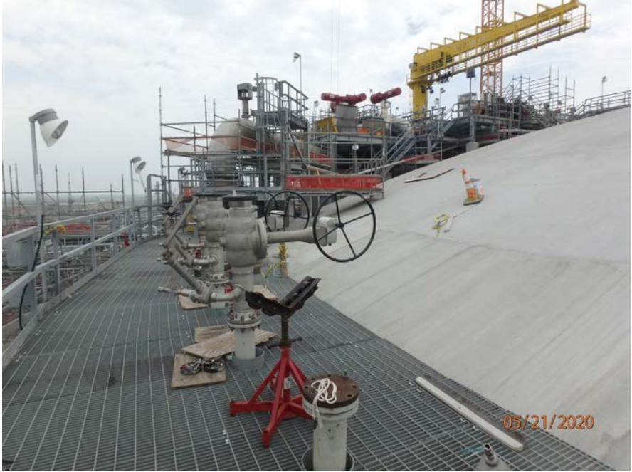
LNG Tank B – piping installation progress atop tank