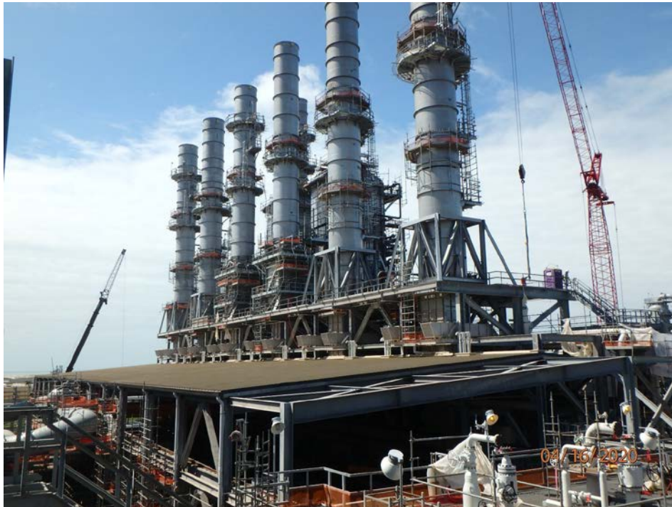
Roofing at compressor shelter completed