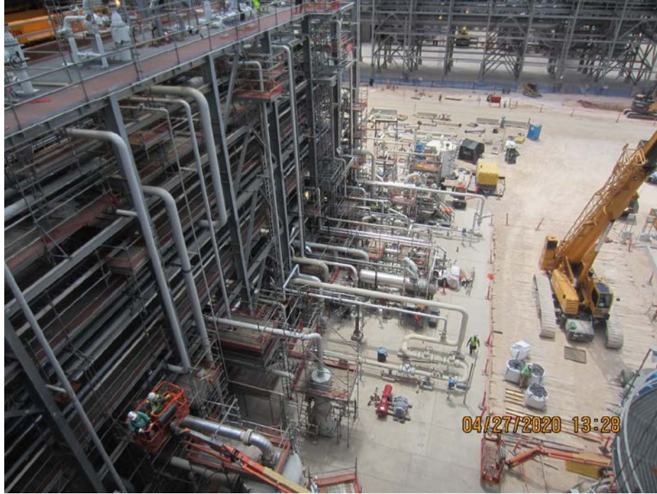
Fuel gas area progress overview