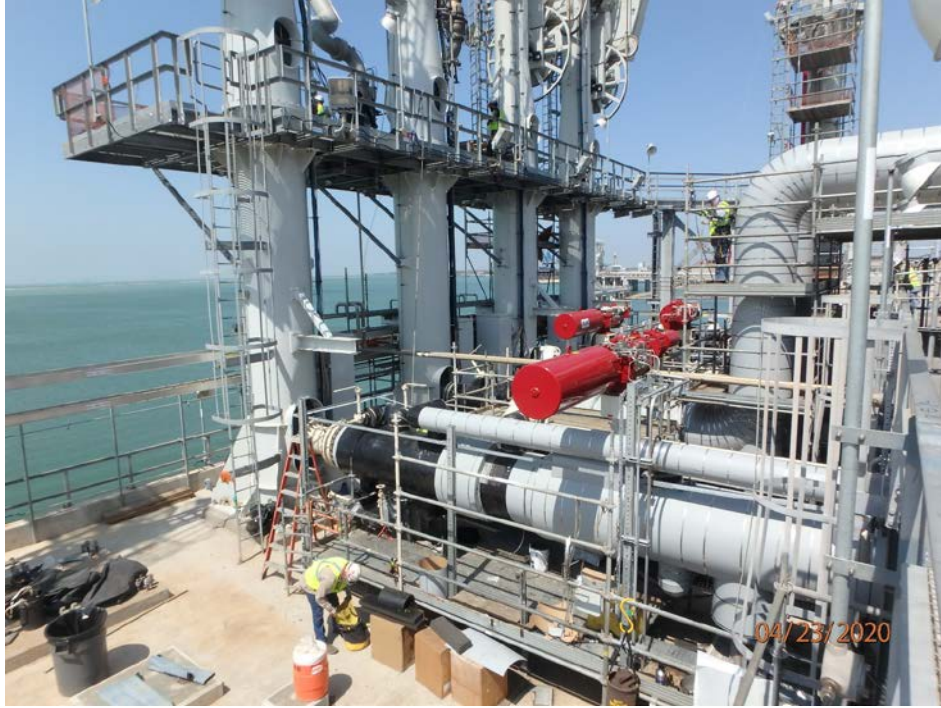
Overall insulation progress