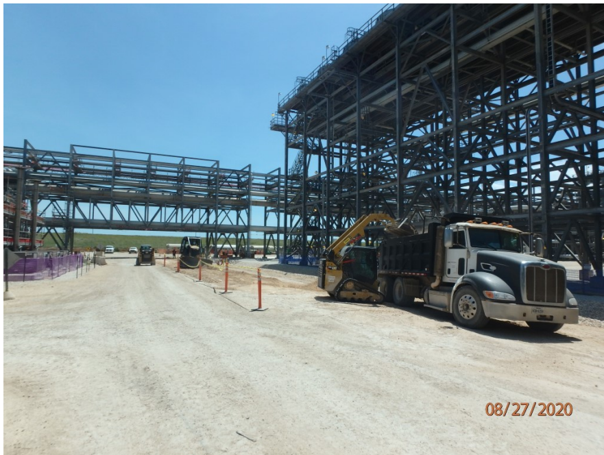
Final grading in Train 3