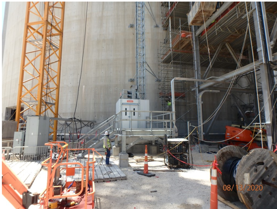
LNG Tank B – permanent elevator installed