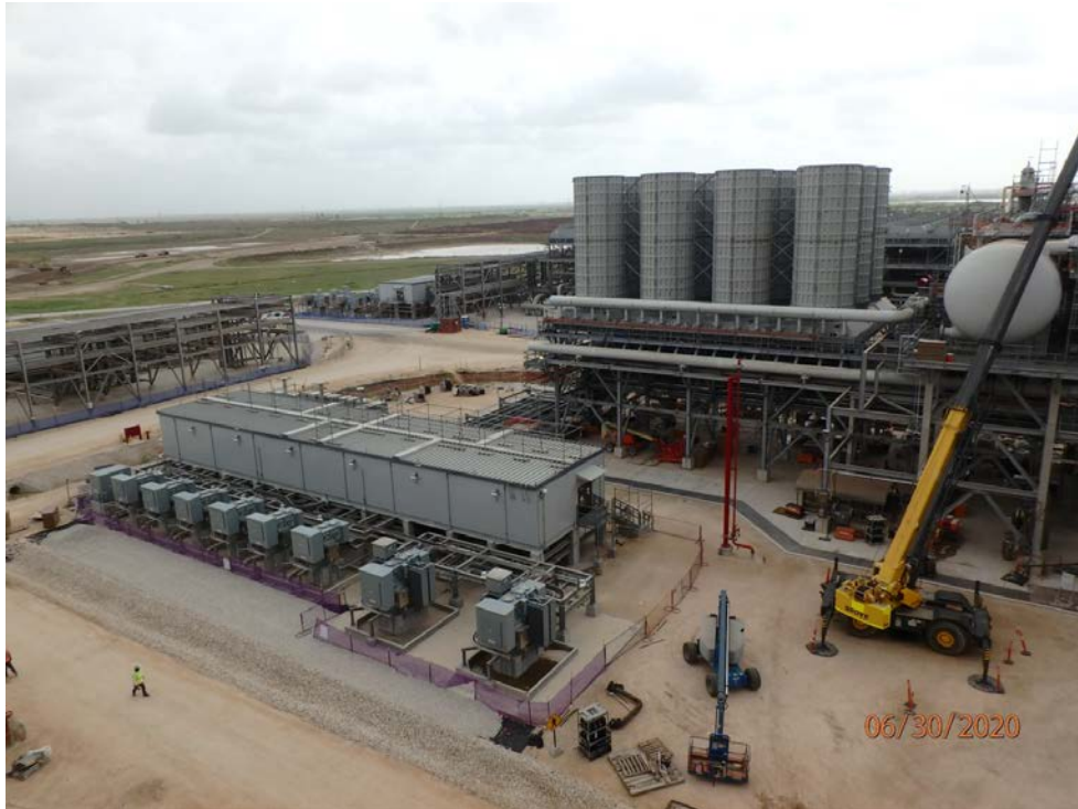
Propane substation purple fenced