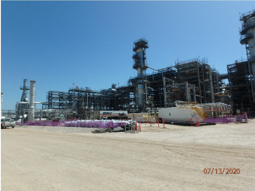
Setup for amine system chemical flush