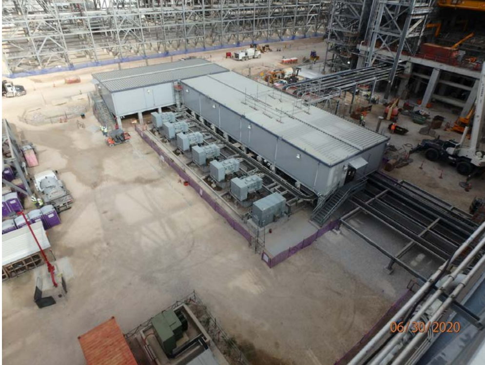
Compressor substation purple fenced