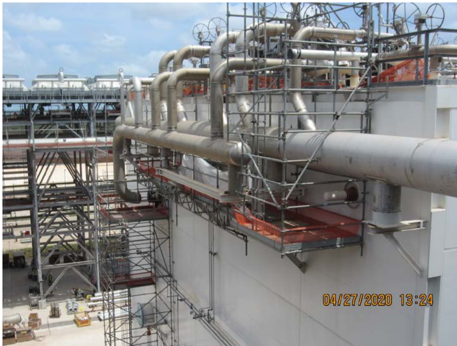
Dry flare header installed at methane cold box