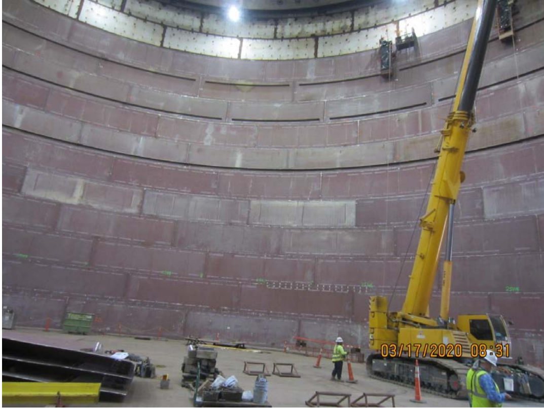
LNG Tank B – Ring 11 welding in progress