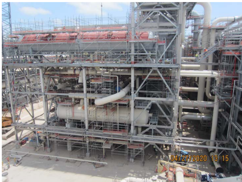
Propane refrigeration area progress overview