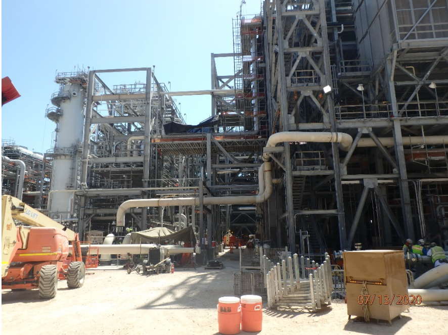
Inlet air chilling piping installation in progress