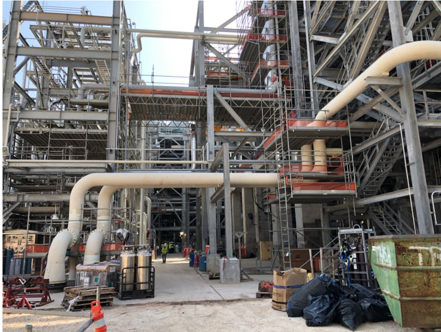
Inlet air chilling system piping installation in progress