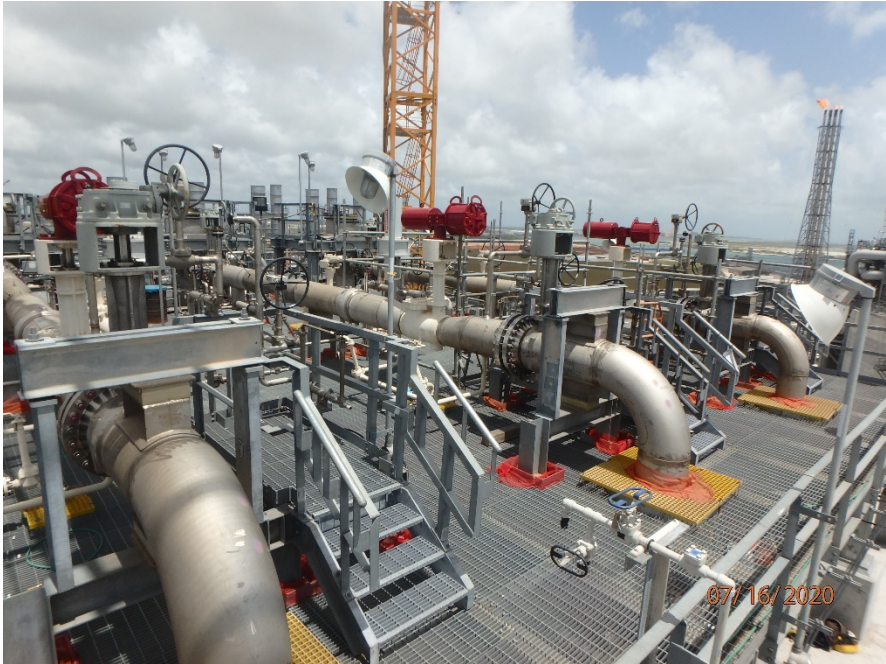
LNG Tank B - Piping progress atop tank