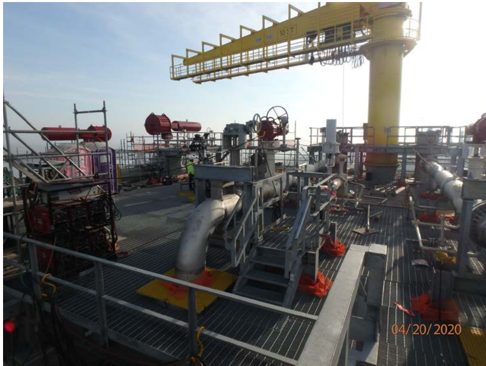
LNG Tank B – Piping installation progress on top