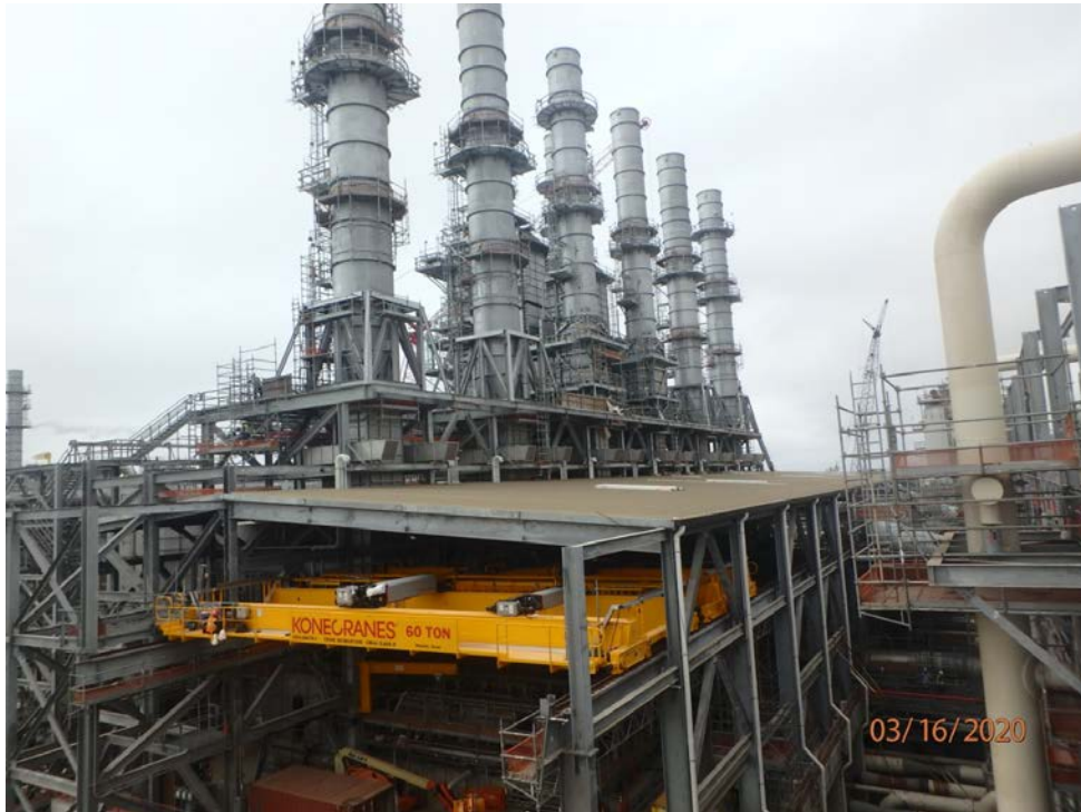
Train 3 - Roofing at compressor shelter and bridge cranes installed