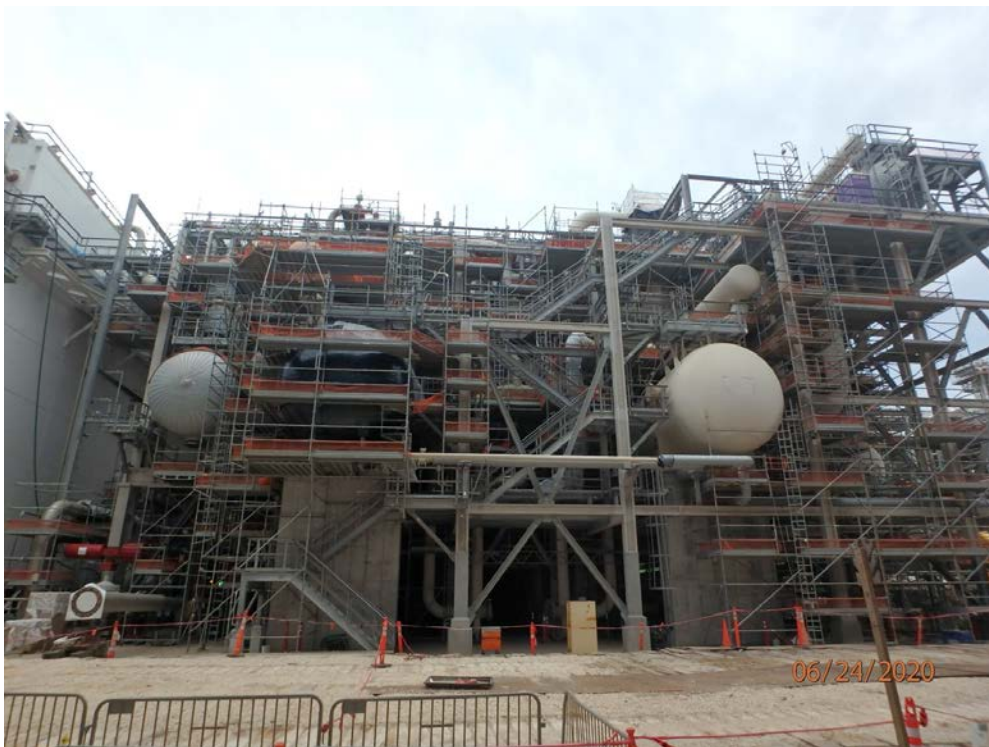
Propane refrigeration area progress overview