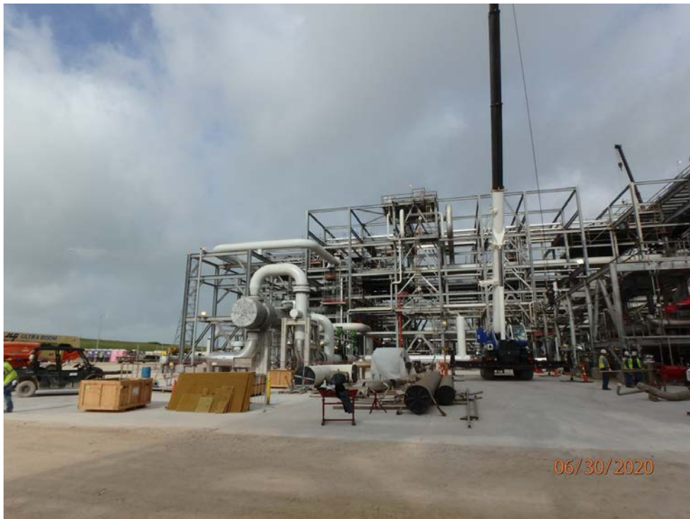
Inlet feed gas area overview