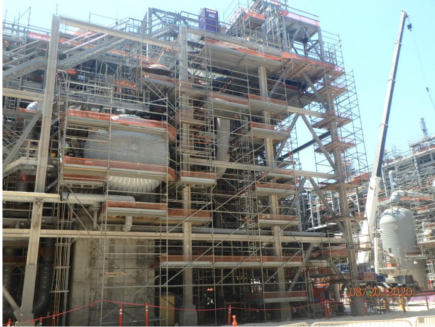
Fireproofing installation in progress