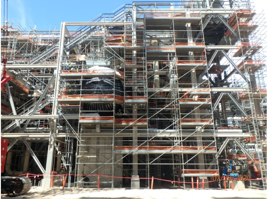
Propane chiller insulation in progress