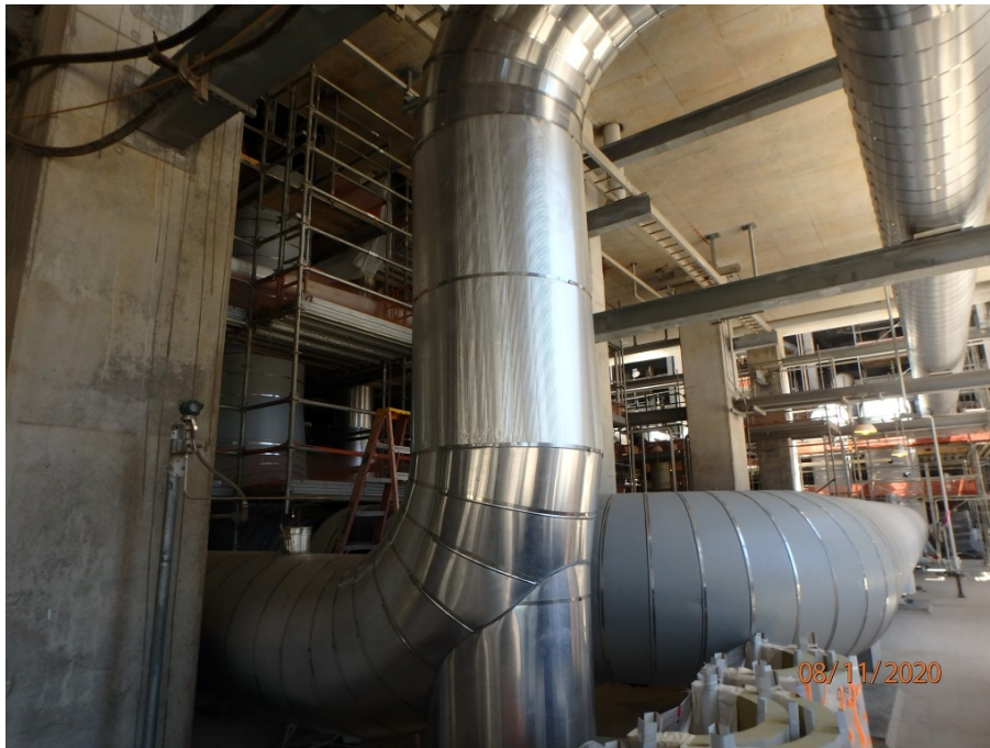
Piping insulation under compressor deck