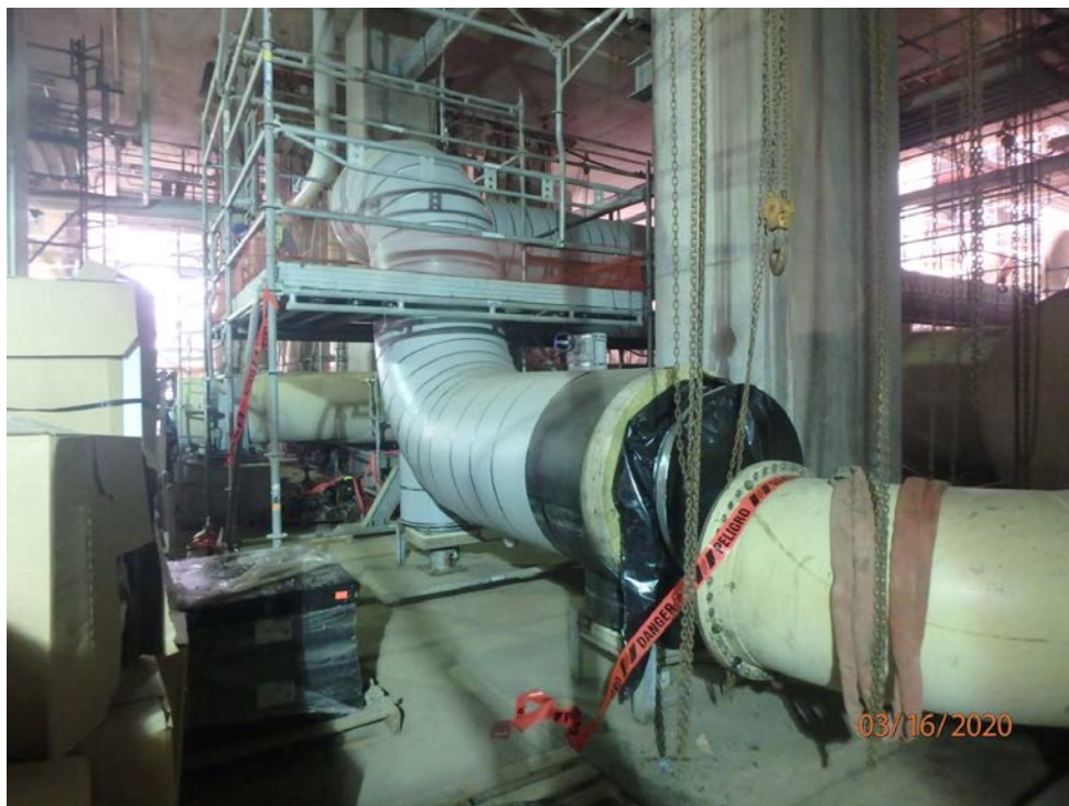
Train 3 - Piping insulation under compressor deck in progress