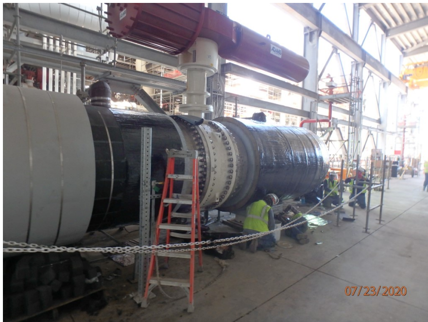
Piping insulation on the compressor deck