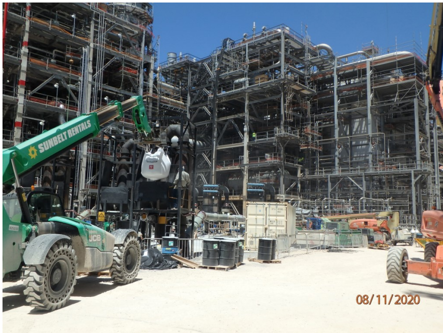
Cold box perlite installation in progress