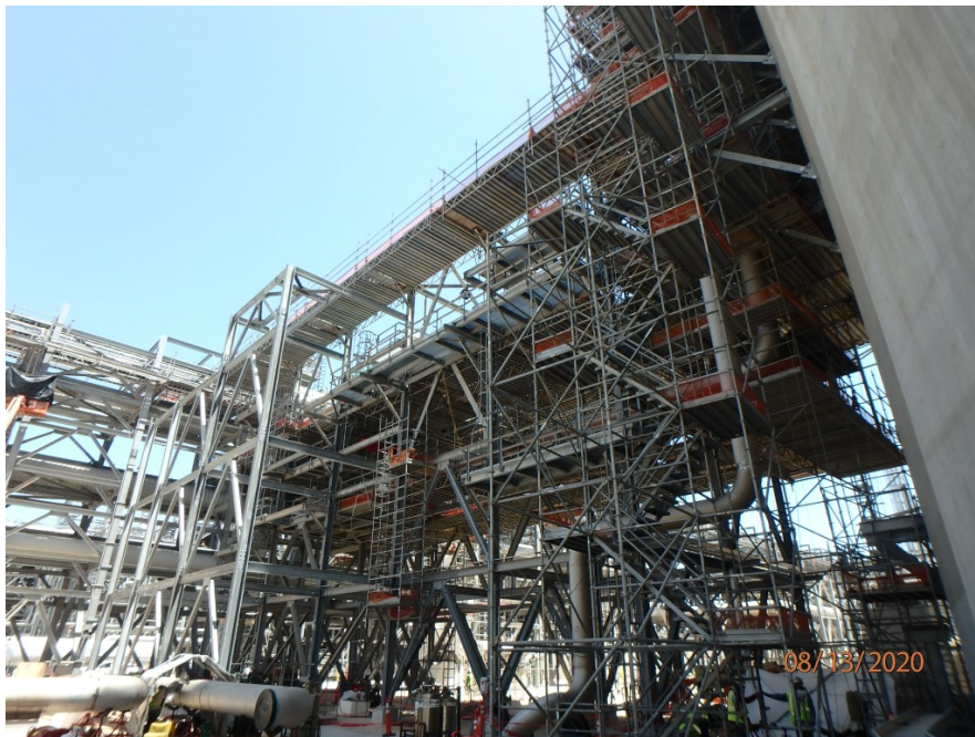
OSBL piping installation in progress