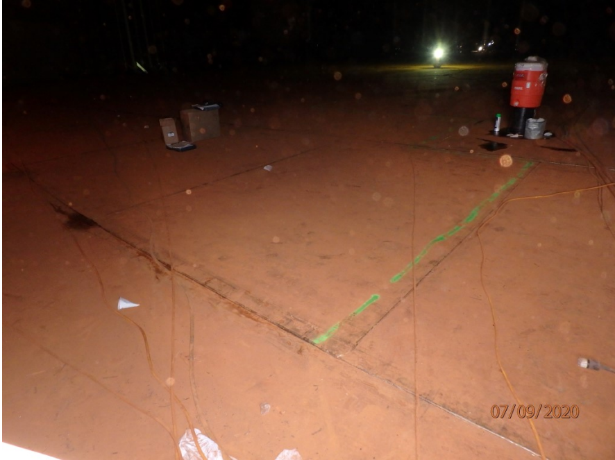
LNG Tank B - Inside the tank post water discharge