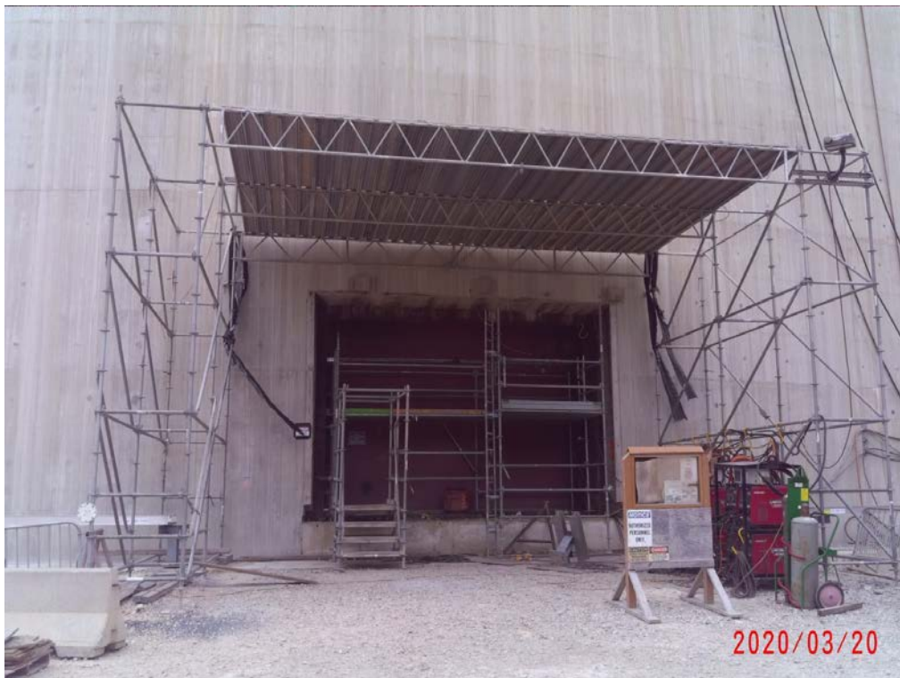
LNG Tank B – East door sheet closed in preparation for hydrostatic test