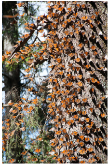
Monarchs roosting on trees