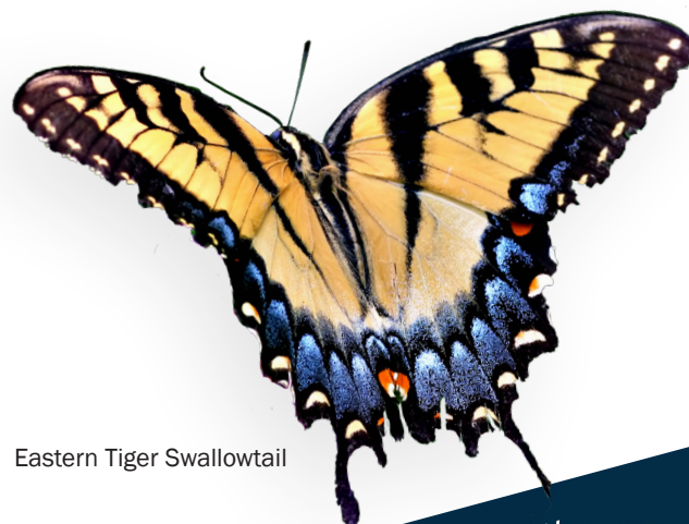
Eastern Tiger Swallowtail