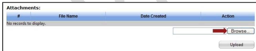
Figure 3: Standard Form (SF-424) Attachments

All supporting documentation should be added as attachments to the SF-424. To attach a document, go to the attachments section at the bottom of the SF-424 and click on the Browse button (Figure 3). Find the file you want to upload and click the Open button. Click the Upload button to attach the file to the application. When you have completed the upload process, click Save .