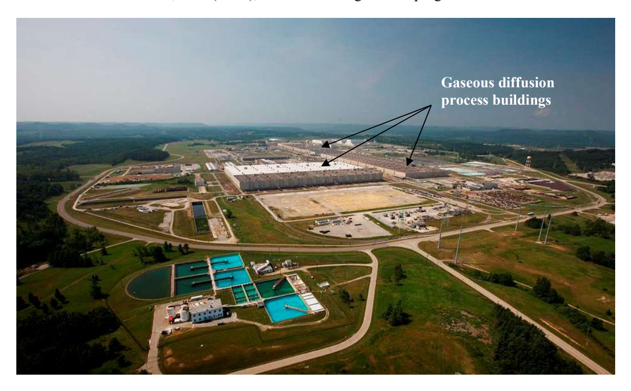
Figure 1.1 The Portsmouth Gaseous Diffusion Plant. (looking from the north-northeast towards the south-southwest)

DOE is responsible for D&D of the gaseous diffusion process buildings and associated facilities, environmental restoration, waste management, and uranium operations. DOE contractors FBP, Portsmouth Mission Alliance, LLC (PMA), and MCS managed DOE programs at PORTS in 2018.