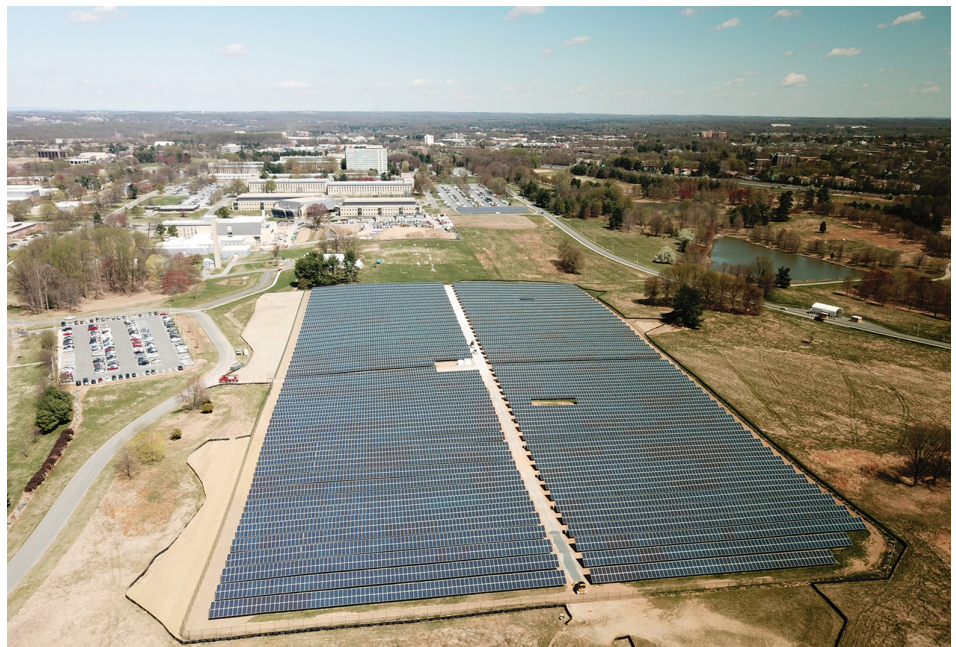
U.S. Department of Commerce, National Institute of Standards and Technology (NIST) 5 MW-DC solar photovoltaics (PV) array in Gaithersburg, MD. Project was awarded as an ESPC energy sales agreement under ENABLE.

ESPC ENABLE builds off the success of the U.S. Department of Energy Federal Energy Management Program's (FEMP) ESPC program by offering an alternative for small, individual sites, or a bundle of them, to implement projects. Advantages of ESPCs that also apply to ESPC ENABLE projects include: zero upfront capital costs to the agency; ECMs designed and installed by an energy