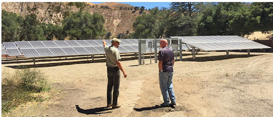
Part of a Forest Service ENABLE project encompassing 63 facilities in two national forests, this 67 kW solar PV system was installed at Los Prietos Ranger Station, Santa Barbara, CA.