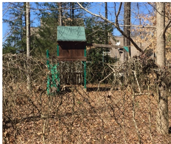
Example of a swimming pool (left) along Midway Turnpike and wooden playset (right) installed on Reservation property along North Boundary Road

The issues we observed were particularly troubling since the occurrences were within locations designated as the most significant interface areas of concern by Reservation Management