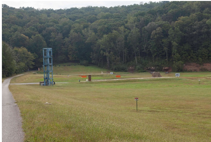
Example of a forested area within the live firing ranges surface danger zones at the Central Training Facility

In addition, we also observed a forested area along the edge of live fire ranges, which was concerning due to the potential for a wildland fire from the heavy fuel buildup within the surface danger zones 9 of the ranges. While Reservation Management officials have acknowledged the need for thinning of dense pine trees at several locations within these areas, there was no mitigation plan in place to reduce the threat.