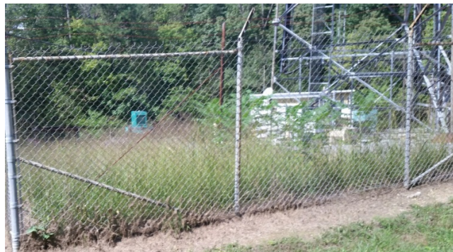
Example of excess vegetation around communication equipment owned by an offsite entity

Federal officials are to inspect the easement areas for compliance with easement terms. However, as highlighted by the picture below and our discussion with Reservation Management officials, these inspections did not always occur.