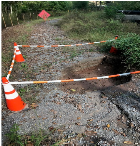
Example of a road closure due to a failed culvert on Midway Turnpike

During our field observations, we captured the following image of a road closure due to a failed culvert: