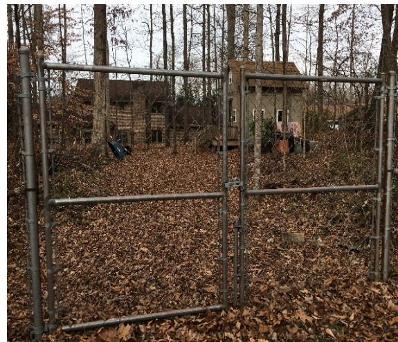
Examples of combustible debris (left) and a wooden shed on Reservation property as well as a private access gate with a lock (right) installed on the Reservation’s fence along North Boundary Road