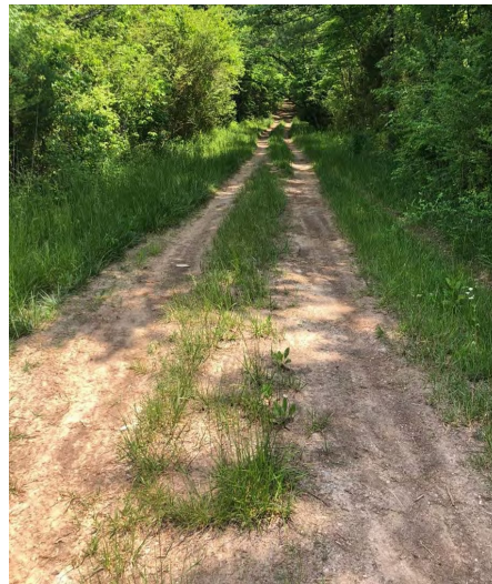
Example of washout conditions (left) on Midway Turnpike as well as improper clearance and excess vegetation (right) on Sam Grubb Road

Compounding the fire road maintenance issue, we found that fire roads were also impacted by failing culverts which, in some instances, led to road closures. This is concerning because the Reservation has over 580 culverts, the majority of which support fire roads.