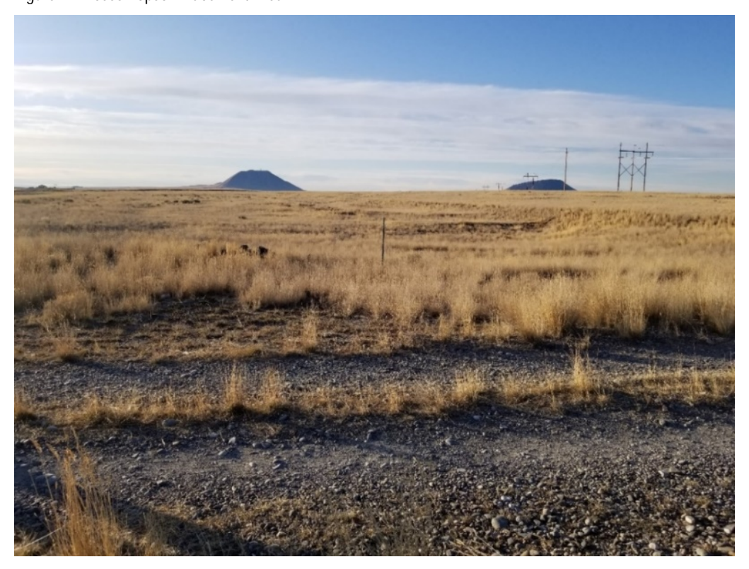
Figure 3. Excess Topsoil Placement Area 2