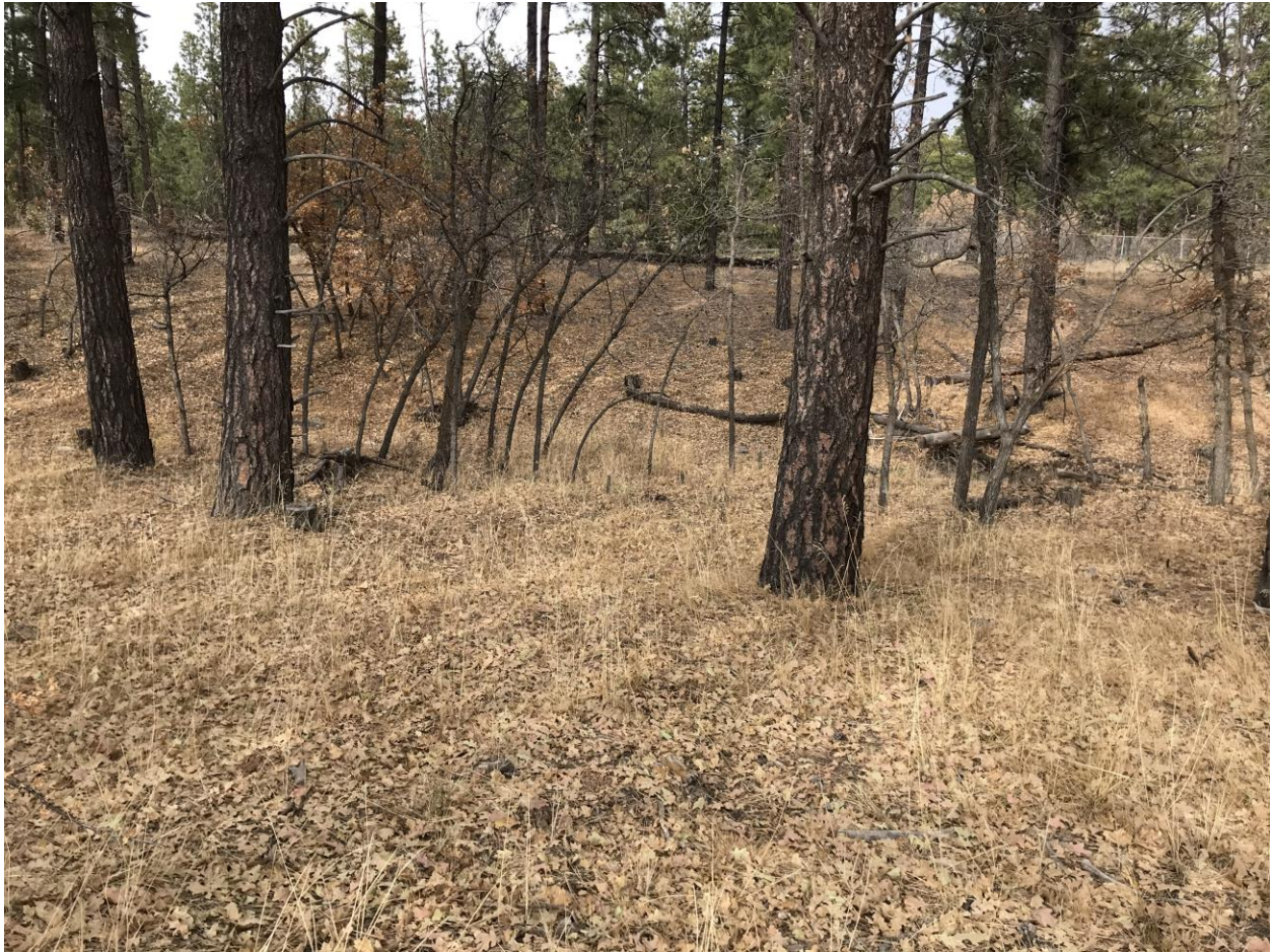
Photo 1. View across Starmer's Gulch 100-yr floodplain, facing north. Note existing fence in background.