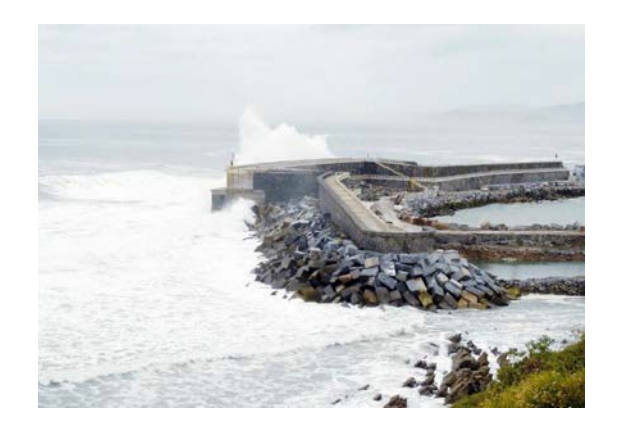
Figure 8.2. Mutriku, Spain, oscillating-water-column-breakwater integration.