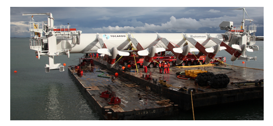
Figure 8.5. Five tidal turbines integrated with the Oosterscheldekering storm surge barrier in the Netherlands.

Figure 8.4. Oosterscheldekering storm surge barrier in the Netherlands.