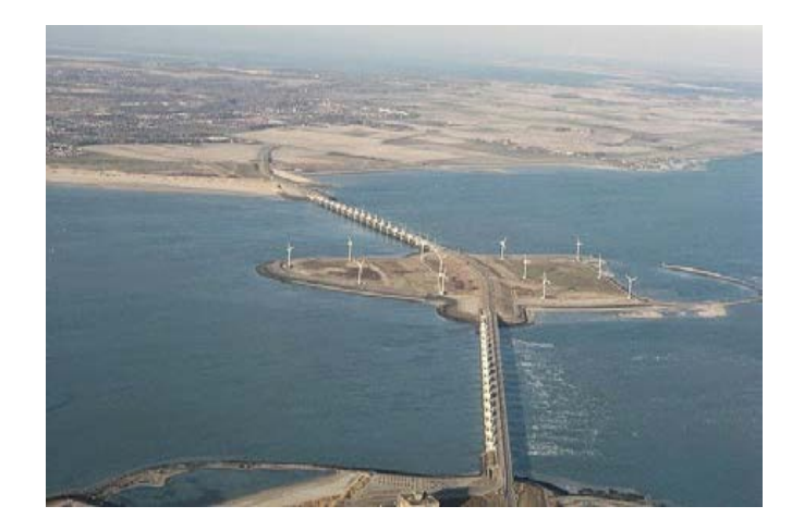
Figure 8.4. Oosterscheldekering storm surge barrier in the Netherlands.