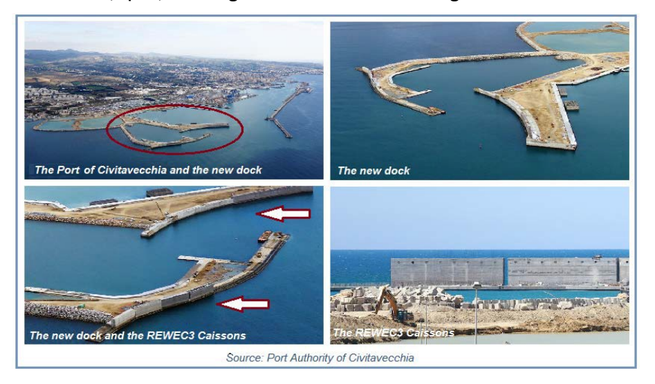
Figure 8.3. The Resonant Wave Energy Converter 3 Device in Civitavecchia Port, Italy.